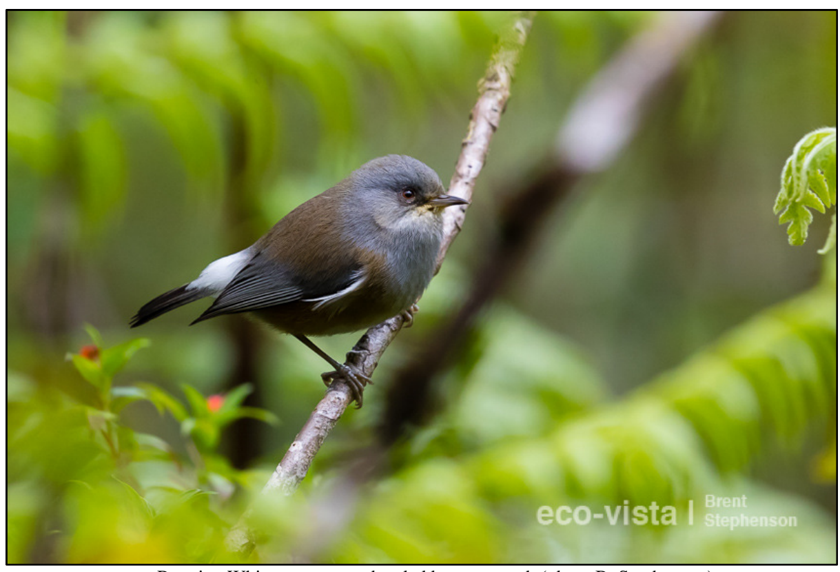
Reunion White-eye, a gray-headed brown morph