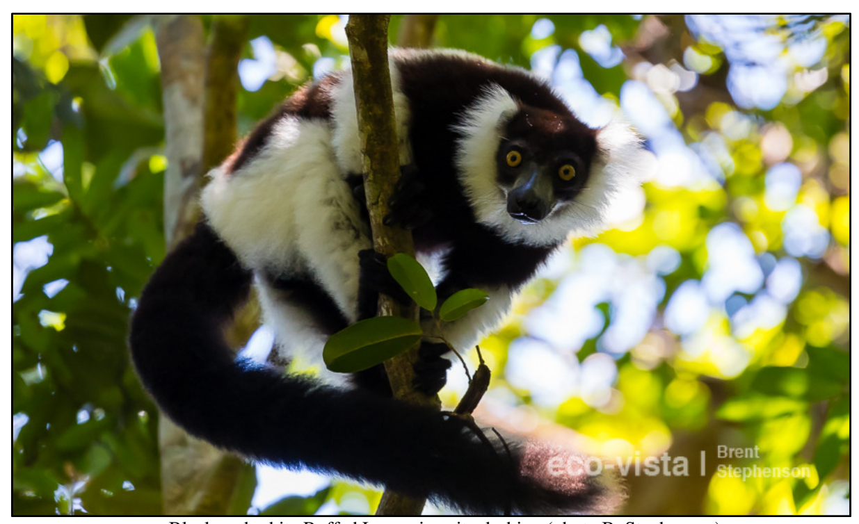
Black-and-white Ruffed Lemur is quite dashing

Madagascar is a wonderful bird island, but unfortunately you have to be fast to witness their beauty. Slash and burn is seen everywhere; we drove for around 2 hours from Amber Mountain to the ship, and most of the habitat outside of the national park was destroyed and turned into agricultural fields.