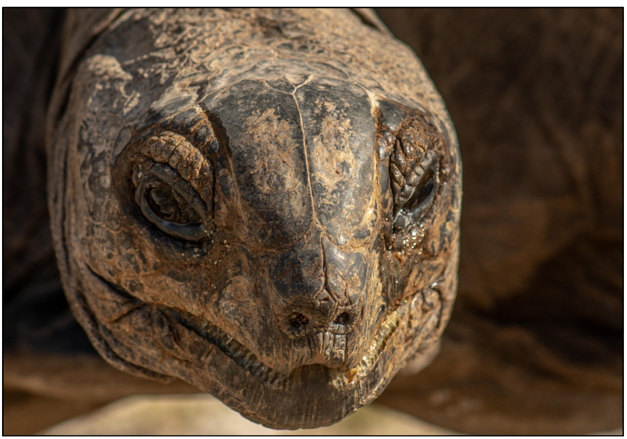
A close-up of Aldabra Giant Tortoise

Birding on the atoll was superb with all species not being afraid of humans as they no longer pose a threat. The famous Aldabra race of the White-throated Rail was running around more or less everywhere. They literally walk right under you and come have a look in your lens when you try to photograph them. The other targets were also quickly found with the Aldabra Drongo, Aldabra White-eye, and Aldabra Fody all being endemic to the atoll. The abbotti race of Malagasy Sacred Ibis strutted by in search of a next meal. The final target here was the Comoro Blue-Pigeon which, unfortunately, only gave some fly-by views.