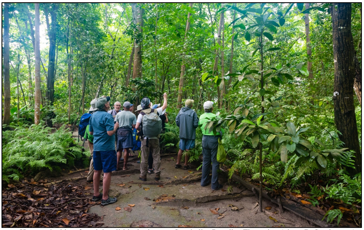
Here we had just found the all-black plumage Seychelles Paradise-Flycatcher