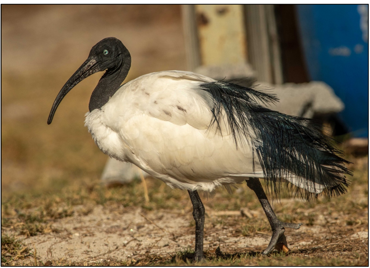
abbotti race of Malagasy Sacred Ibis is a possible split.

largest coral atoll in the world and also a UNESCO World Heritage Site. We learned that a constant population of around 30 persons inhabits the sanctuary. They are responsible for research and planning but also guiding the few visitors the atoll receives every year. All our bags were cleaned on the ship from possible invasive seeds. The sky was filled with Red-footed Boobies, splendid White-tailed and Red-tailed tropicbirds, Lesser and Greater frigatebirds, a couple of Sooty Terns, and the occasional Brown Noddy.