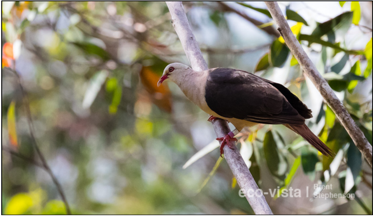
The alluring Pink Pigeon is not just your common neighborhood pigeon!