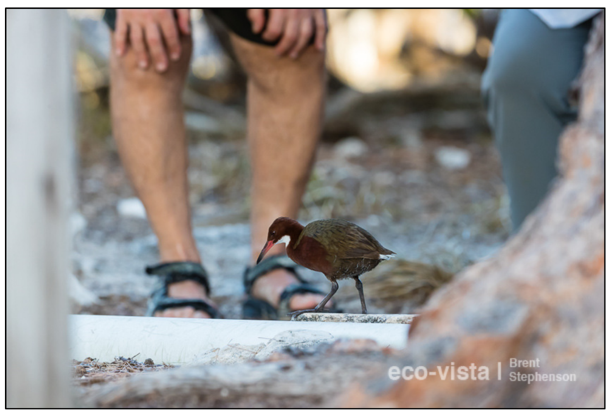
The flightless Aldabra Rail is a race from the White-throated Rail but definitely a possible split....