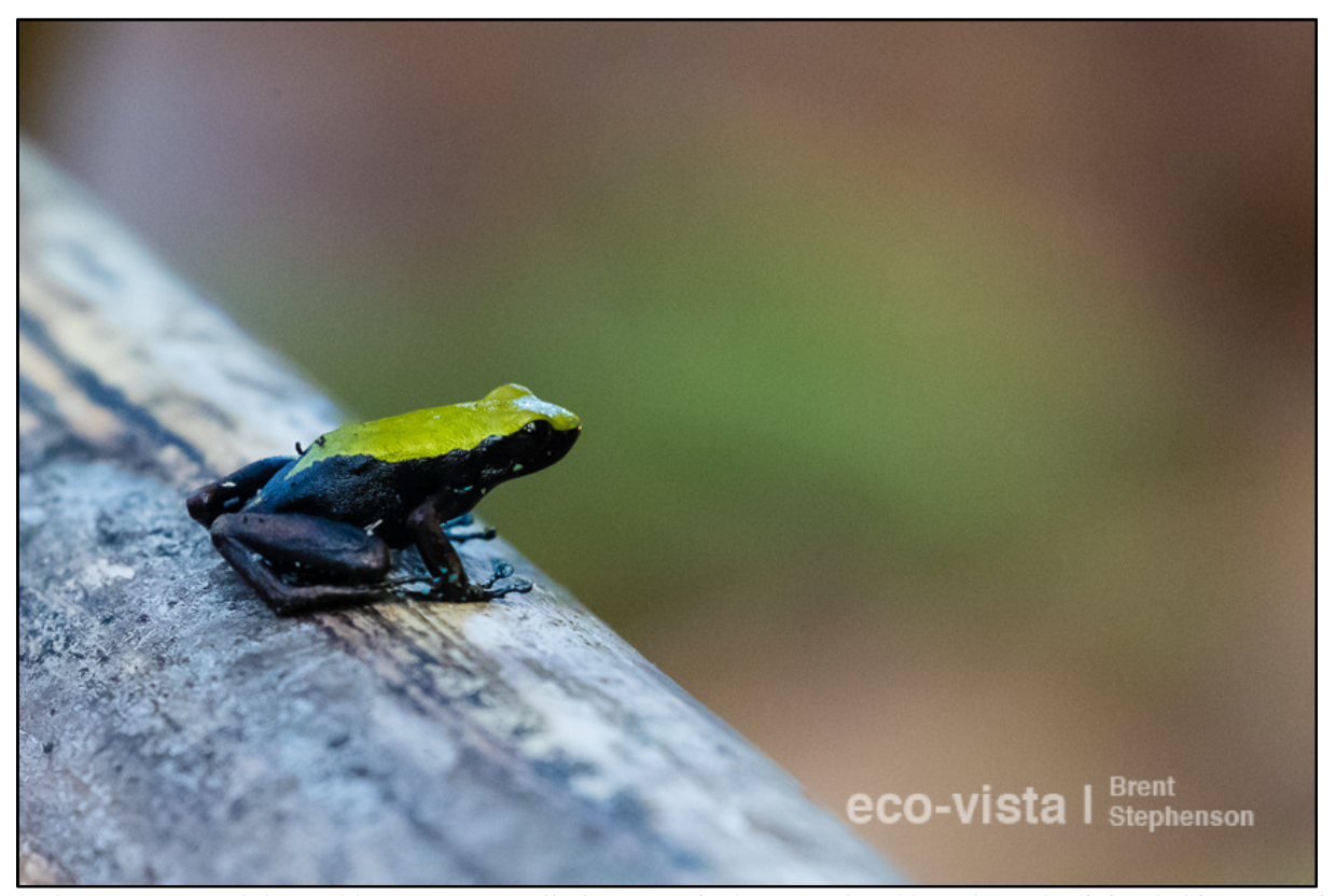
The gorgeous Folohy Golden Frog Mantella laevigata is threatened and has also a declining habitat range in northern Madagascar