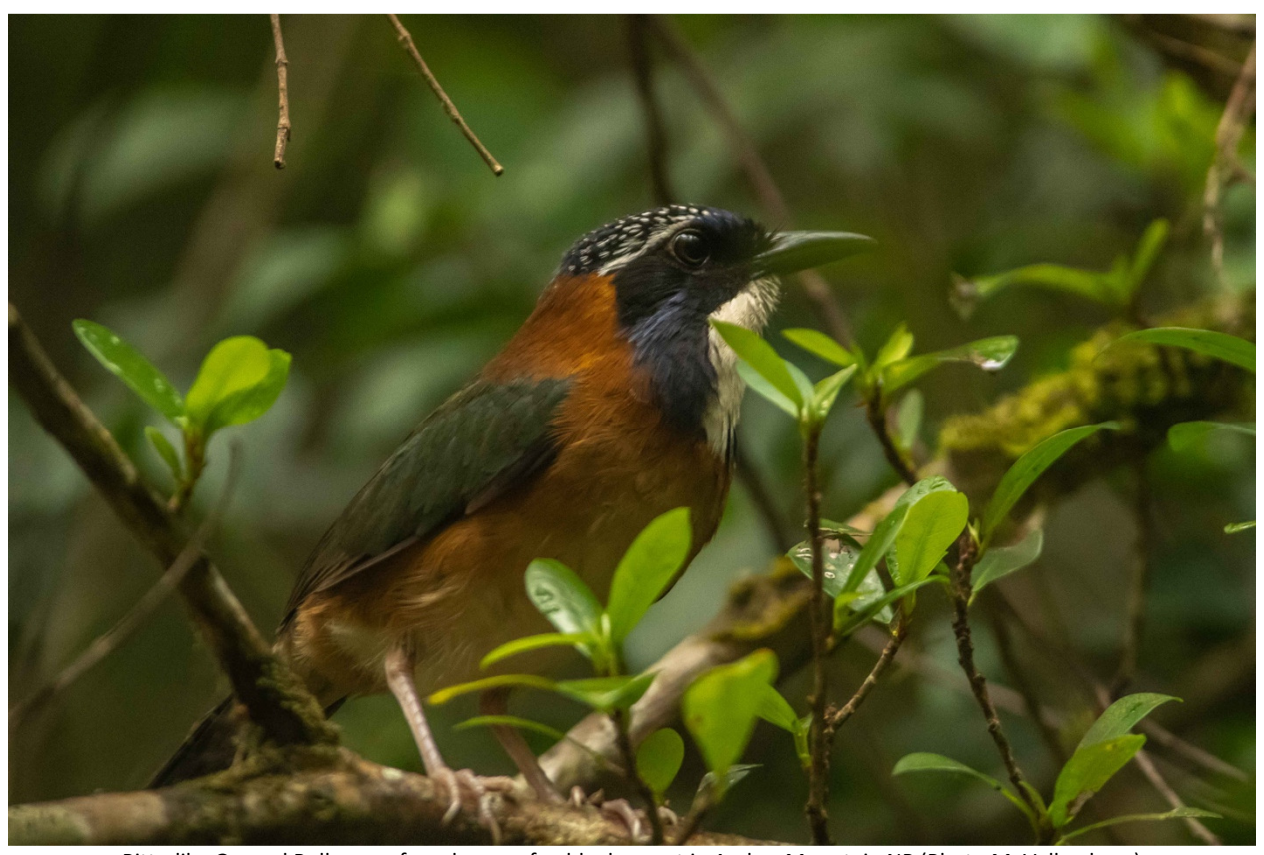
Pitta-like Ground Roller was found near a freshly dug nest in Amber Mountain NP

ABOARD THE SILVER DISCOVERER OCTOBER 20-NOVEMBER 6, 2018