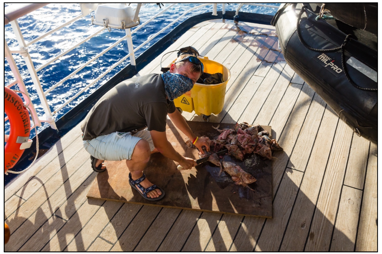
Yours truly cutting up the rotting fish for a little chumming session