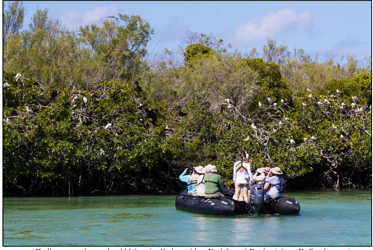
Zodiac excursion at the Aldabra Atoll alongside a Red-footed Booby