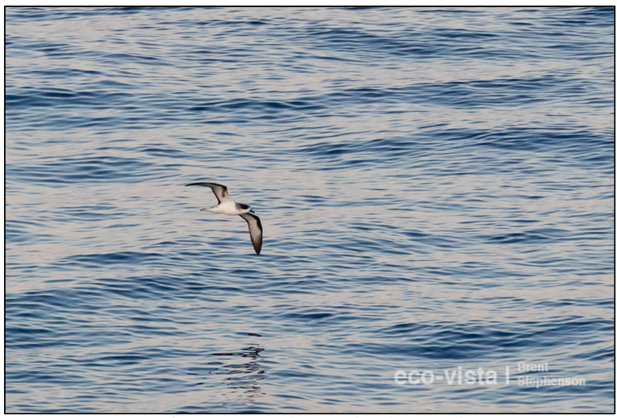
One of many Barau's Petrel near Reunion