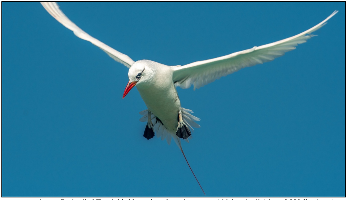
An elegant Red-tailed Tropicbird hovering above its nest at Aldabra Atoll

After Poivre we headed straight for the Aldabra Atoll; this was a rather wild crossing with several glasses being shattered and not surviving the crossing until the calmer waters at Aldabra. Aldabra is the second