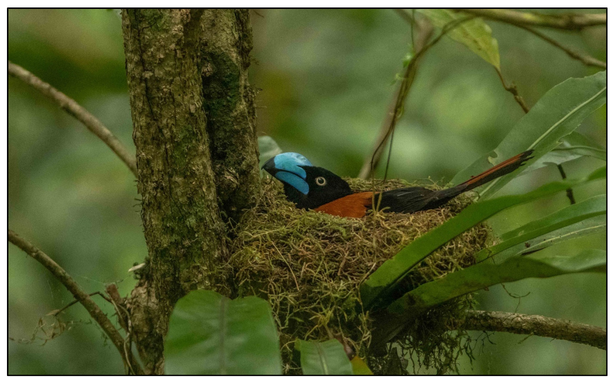
Helmet Vanga; bird of the trip for many of us!

Madagascar is a wonderful bird island, but unfortunately you have to be fast to witness their beauty. Slash and burn is seen everywhere; we drove for around 2 hours from Amber Mountain to the ship, and most of the habitat outside of the national park was destroyed and turned into agricultural fields.