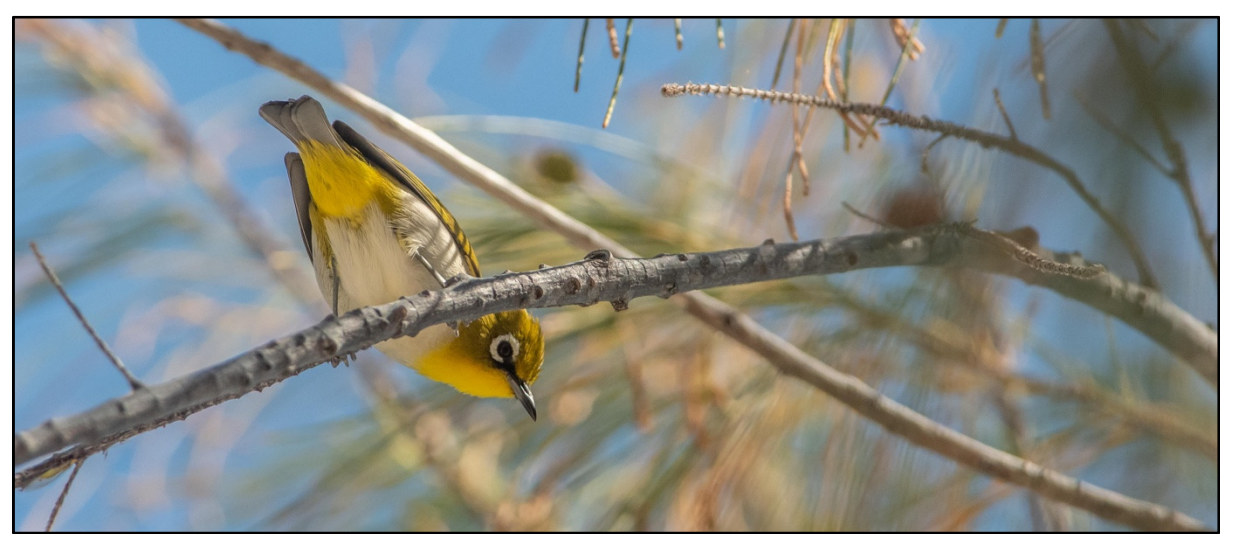
One of the cute Aldabra White-eyes that we found on Aldabra and Assumption Island