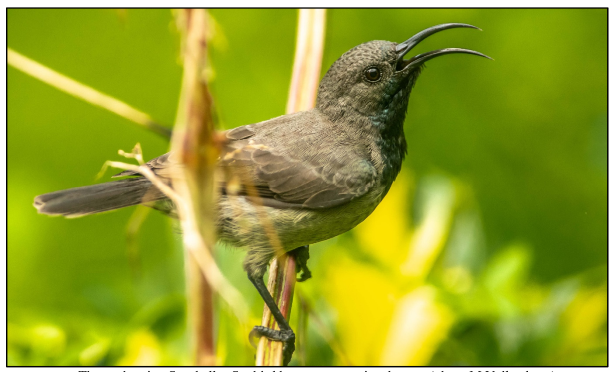
The enchanting Seychelles Sunbird has a very restricted range

When I learned about the option of leading this fascinating Zegrahm cruise for VENT, I jumped right on it, as I knew it would deliver some spectacular birds, mammals, and landscapes. Oooh man I was right! The trip started in paradisiacal surroundings on the island of Mahe, the largest of all islands that together form the Seychelles. Before embarking the Silver Discoverer , we planned some pre-tour birding. In the afternoon we made an outing to find the rare Seychelles White-eye, Seychelles Blue-Pigeon, and Seychelles Sunbird. Rapidly they were found, and good looks were enjoyed by all. In the evening after dinner we went out for probably the rarest and most difficult bird of the entire tour, the Seychelles Scops-Owl. For a long time we heard no response, but just before we decided to leave the designated spot we heard one quick rasping call. Soon after, we found the bird in full delight—just amazing!