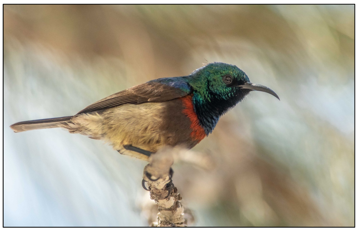
Abbott's Sunbird was found on the beach at Assumption, a race of Souimanga Sunbird!

Another major highlight was the Aldabra Giant Tortoise that luckily is now very common again; they were almost extinct as western sailors caught them for food on their passage to India. These colossal tortoises are very friendly and love it when they are scratched on those difficult to reach places. It was a great experience to be eye-to-eye with such an ancient creature. Our next stop was the island of Assumption where we spent the morning birding and snorkeling. On the beach we quickly found some gorgeous Aldabra White-eyes together with the Abbott's Sunbird, a race of Souimanga Sunbird quickly found as well, the latter being very attractive as shown in the picture below.