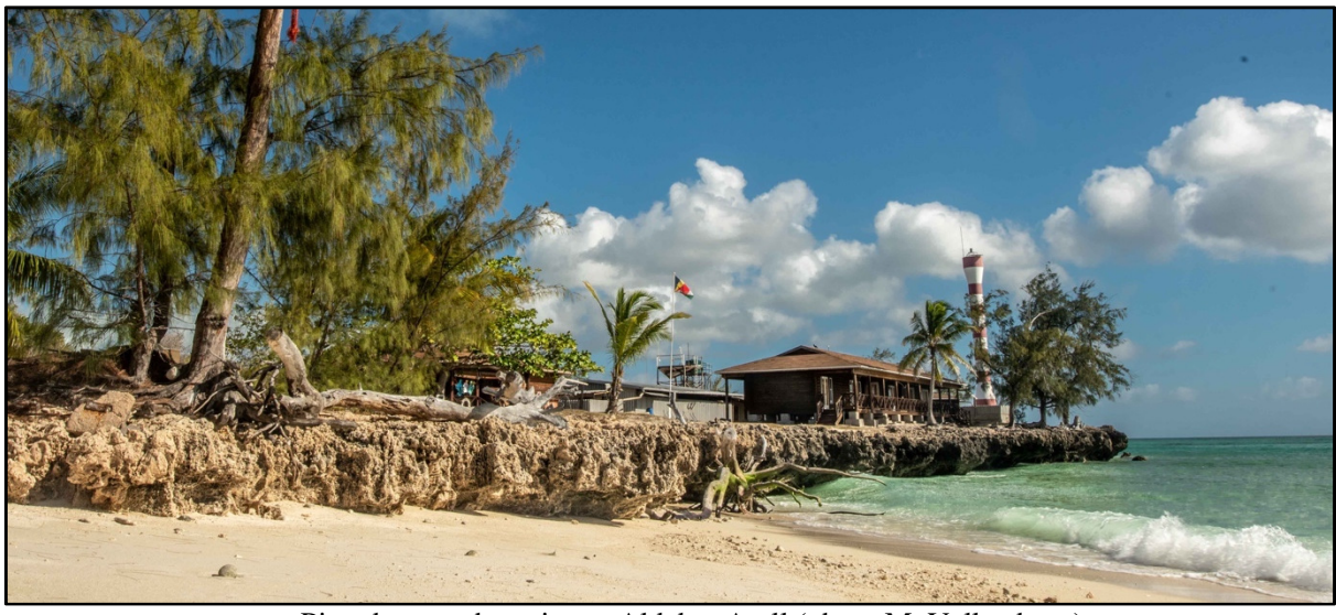
Picard research station at Aldabra Atoll