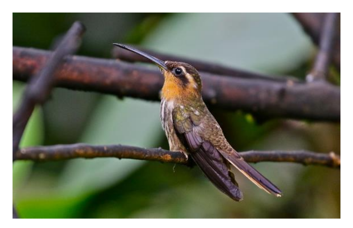
Saw-billed Hermit, Sítio Folha Seca, Ubatuba