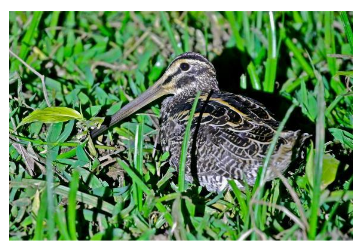
Giant Snipe, "Snipe Valley" near Itatiaia NP