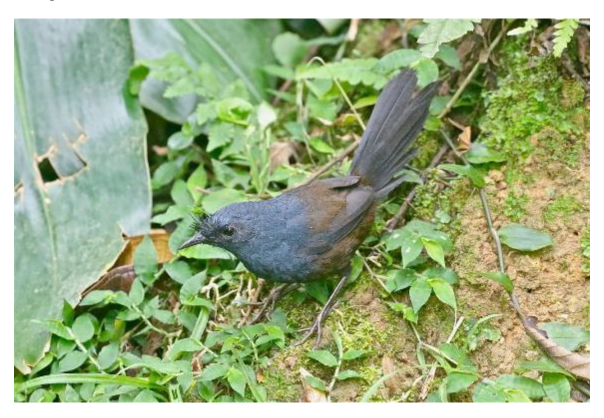
Slaty Bristlefront (male), Itatiaia NP

Despite all of the changes, the park's trails continued to deliver great birding and a number of memorable sightings. The Jeep (Maromba) Trail produced an unusually cooperative Black-billed Scythebill, our first Scaled Woodcreeper, White-browed and White-collared foliage-gleaners, our best studies of Greenish Schiffornis and Yellow-olive Flycatcher, and others, and the Tres Picos Trail delivered such prizes as White-bibbed Antbird, Tufted Antshrike, and White-breasted Tapaculo. Best of all, we were treated to a mesmerizing performance from a male Slaty Bristlefront , right along the main park road.