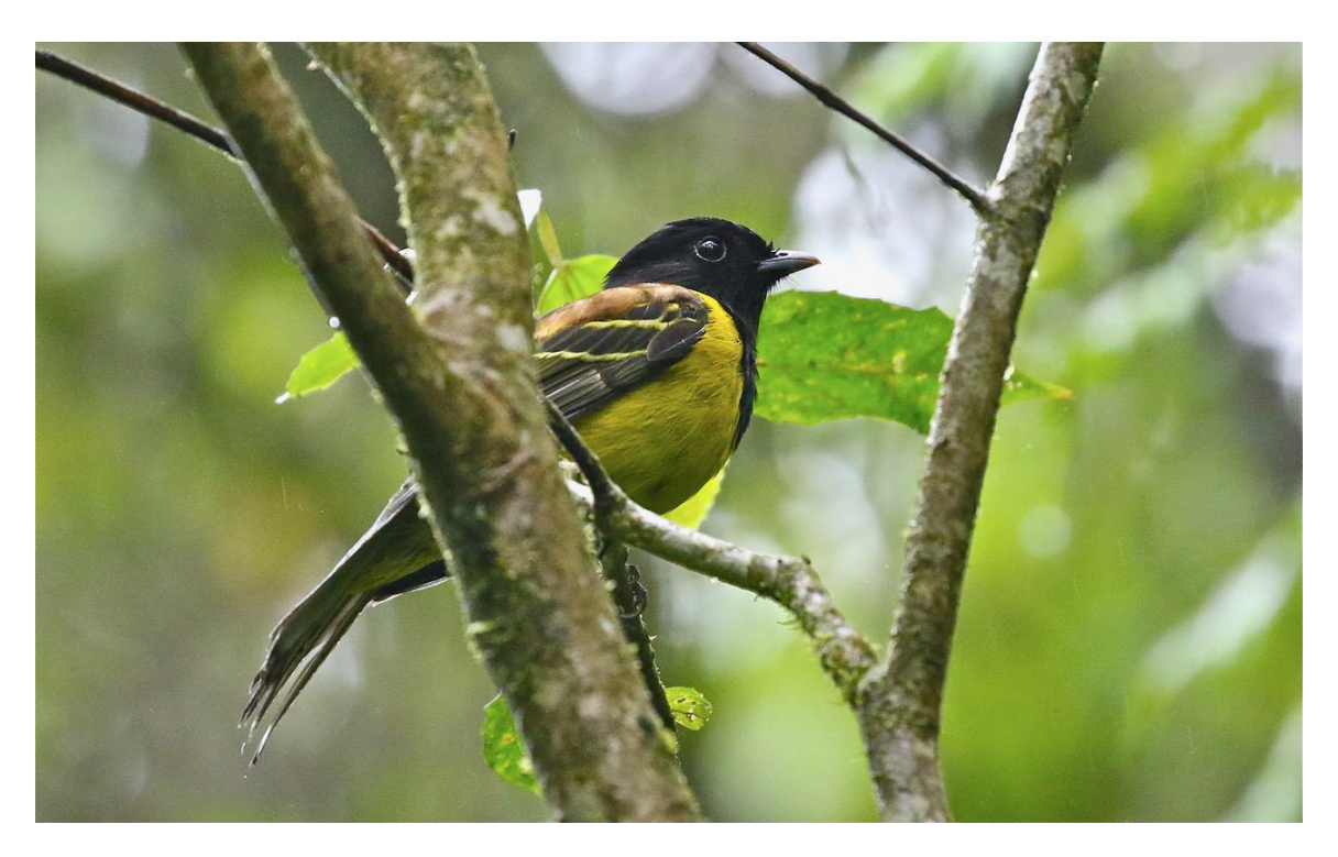
Hooded Berryeater (male), Intervales SP

defining avian voice of the Serra do Mar. Our destination on the trail was a large pond surrounded by forest, where "Atlantic" Royal Flycatchers have nested in the past, and where, Gerson informed us, a pair was actively constructing a new nest. We made it to the pond, and, in short order, located the nest, but it appeared to be incomplete, and there was no sign of the builders, so we made our way back, pausing at one point to sort through a big mixed-species flock that included both a Sharpbill and a female-plumaged Bare-throated Bellbird, some stunning Red-necked Tanagers, and three unrelated döpplegangers – Buff-fronted Foliage-gleaner, Brown Tanager, and Chestnut-crowned Becard.