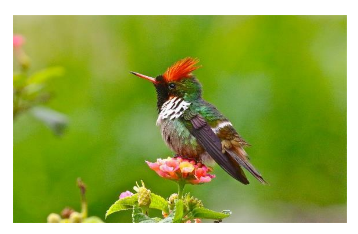
Frilled Coquette (male), Hotel do Ypé, Itatiaia NP