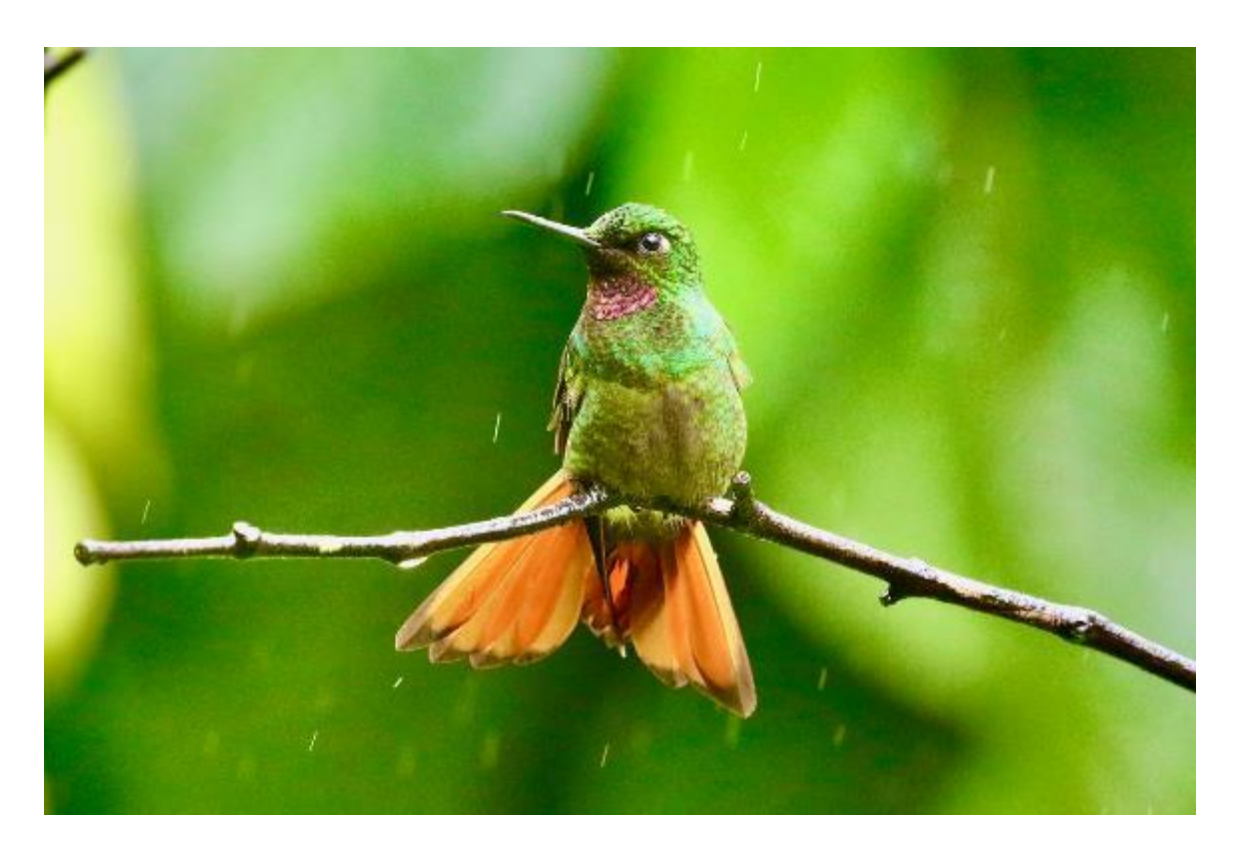
Brazilian Ruby (male), Sítio Folha Seca, Ubatuba

Stripe-breasted Starthroat ( Heliomaster squamosus ) - UB (1 bird, seen perched in a tree-top at Fazenda Angelim was a surprise. This species is typically found to the north and west, and is only a wanderer to this region.)