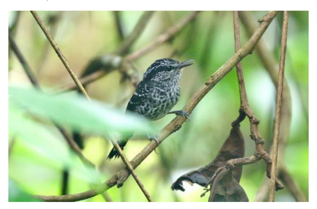
Scaled Antbird (male), Fazenda Angelim, Ubatuba

Scaled Antbird ( Drymophila squamata ) ( E ) - UB (Fazenda Angelim & Condominio Verde Mar.)