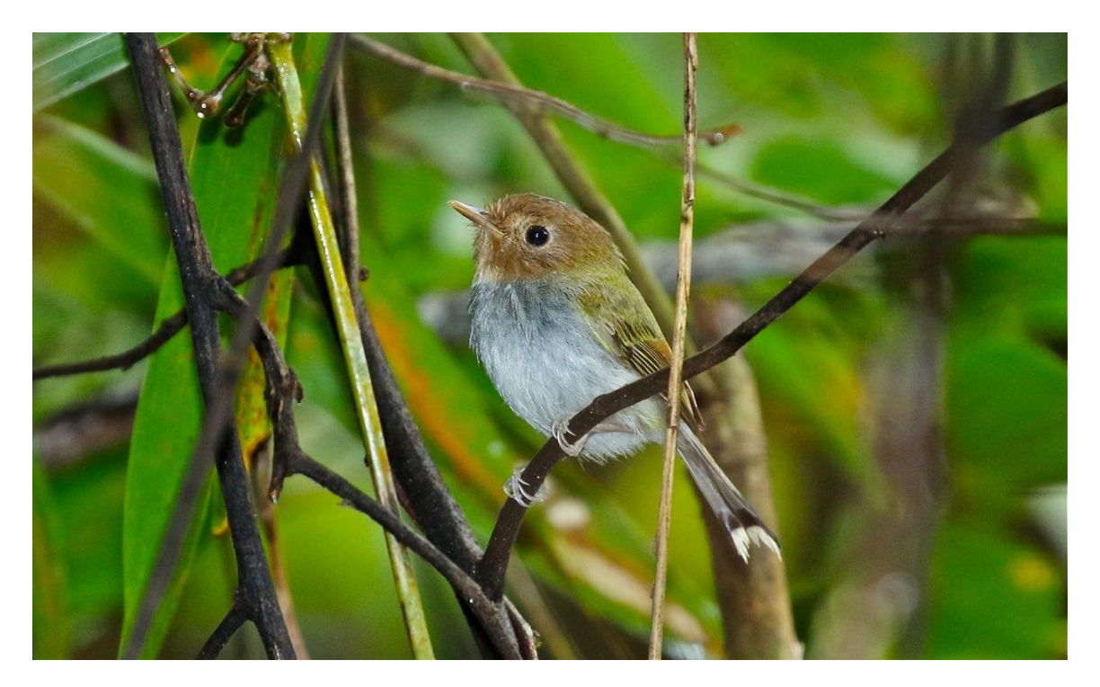
Fork-tailed Pygmy-Tyrant, Fazenda Angelim, Ubatuba area

remainder of the morning. In spite of these less-than-ideal conditions, we did score some good finds, among them, Scaled Antbird, Fork-tailed Pygmy-Tyrant , a perched Rufousthighed Kite, and a singing Temminck's Seedeater.