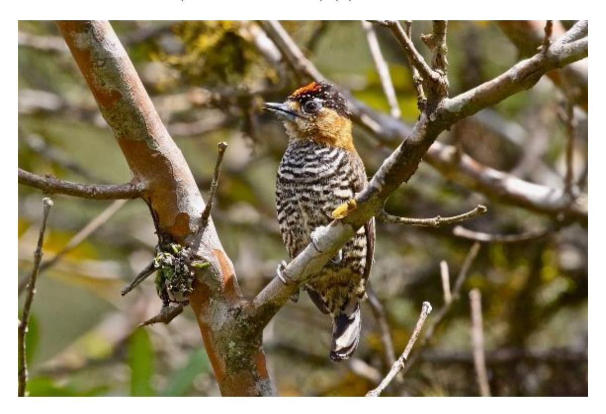
Ochre-collared Piculet (male), Intervales SP

White-barred Piculet (Picumnus cirratus cirratus) (E) - PE, IT Ochre-collared Piculet (Picumnus temminckii) (E) - IN