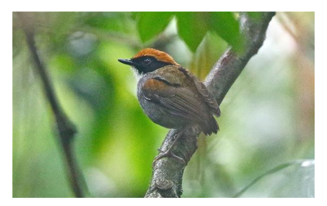
Black-cheeked Gnateater (male), Condominio Verde Mar trail, Ubatuba

We returned to town for 20 minutes of scanning the bay for Magnificent Frigatebirds, Brown Boobies, Kelp Gulls, and Royal Terns, then headed for lunch. After checking out of our hotel, we settled in for the afternoon drive to Itatiaia National Park , where we arrived just at dusk. Fortunately, the persistent rain that had plagued us in the Ubatuba region had not followed us to Itatiaia, but we did arrive to much colder than usual temperatures, which persisted throughout our stay, and which seemed to be part of the same unseasonably cold and wet weather system that had funneled up out of the south. Even the hotel staff was remarking on how unusual it was for it to be so cold in November, which is usually the height of spring. Never before, in 30 years of October–November visits to the park, had I ever had occasion to make use of the fireplace in my cabin, but I gladly took advantage of nightly roaring fires throughout our stay, as did most everyone in the group.