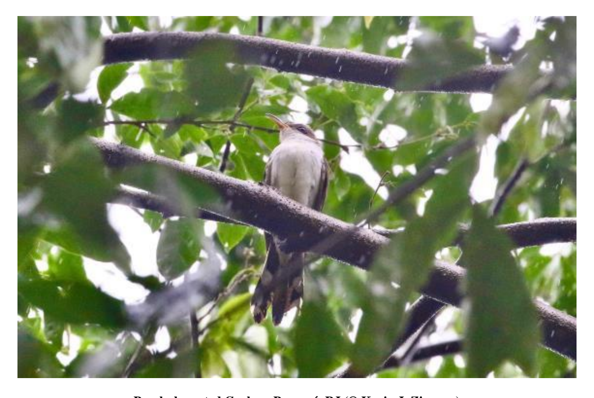
Pearly-breasted Cuckoo, Perequé, RJ

Pearly-breasted Cuckoo ( Coccyzus euleri ) - PE (Very uncommon on our route.)