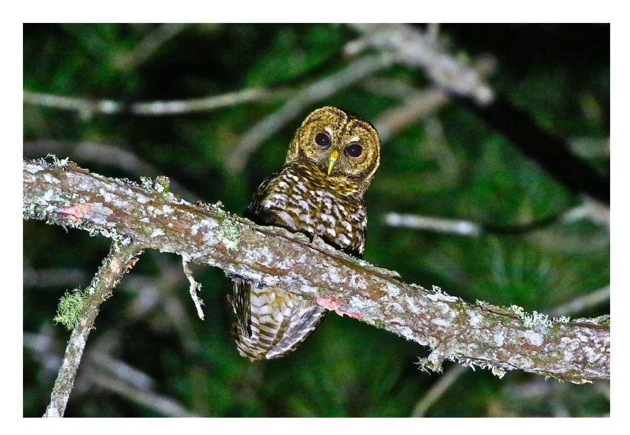
Rusty-barred Owl, Intervales SP

The morning of October 28 <sup>th</sup> was devoted to a fairly long trek out the Lajeado Trail , my personal favorite of the many trails and jeep tracks in the park. We encountered more mixed-species flocks along this trail, which treated us to pairs of Scalloped and White-throated woodcreepers, a nice variety of foliage-gleaners (including the fancy Black-capped Foliage-gleaner and the Sharp-billed Treehunter), and some fabulous comparisons of Oustalet's, São Paulo and Mottle-cheeked tyrannulets, among others. We also caught up with what had heretofore been only a persistent, distinctive voice – the Rufous-tailed Attila, which finally showed well. Other avian highlights were of a more terrestrial (and less neck-straining) variety, including some point-blank, extended studies of a Rufous-breasted Leaftosser and a Mouse-colored Tapaculo. A Squamate Antbird and Starthroated Antwren also showed well, but the only Black-cheeked Gnateater that we encountered was unusually uncooperative, offering only the briefest of views, while never approaching particularly close.