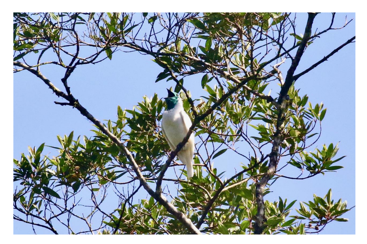
Bare-throated Bellbird (male), Carmo Road, Intervales SP

Our afternoon excursion was centered on a visit to a Purple-crowned Plovercrest lek outside of the park proper, beyond Porteria (Entrance Gate) #2. There were a couple of male plovercrests attending the lek, but, as usual, they were perching low, in dense thickets of second growth, and moving around a lot, which wasn't making it easy. There was only a narrow window in the vegetation allowing views of the favored song perches, which meant that we could squeeze only 1 or 2 people in at a time. But, with patience, we eventually got everyone good views of these elegant little hummers with the lapwing-like crest.