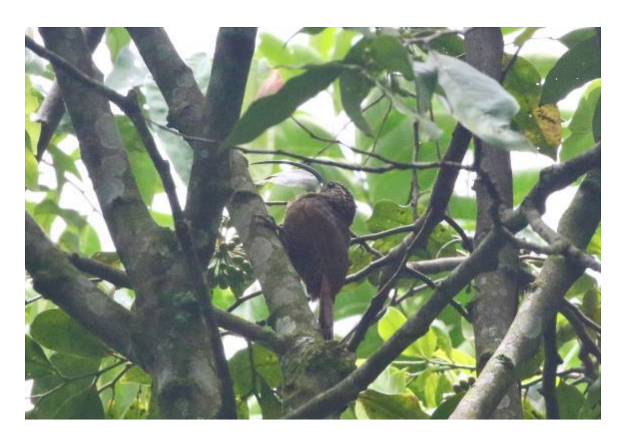
Black-billed Scythebill, Jeep Trail, Itatiaia NP

Scaled Woodcreeper ( Lepidocolaptes squamatus ) ( E ) - IT (Jeep Trail, Tres Picos Trail, and, by David, along the main park road.)