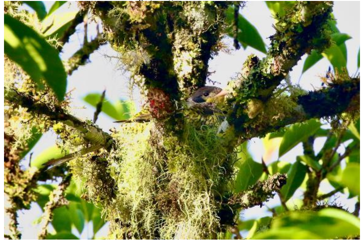
Swallow-tailed Cotinga (female on nest), Pousada Oikos, Serra do Mar SP (© Kevin J. Zimmer)

Swallow-tailed Cotinga (male), Intervales SP (© Kevin J. Zimmer)