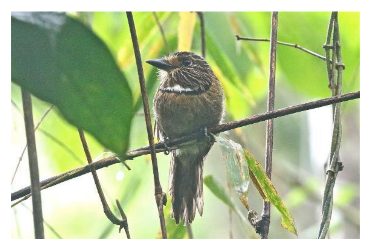
Crescent-chested Puffbird, Condominio Verde Mar trail, Ubatuba

Rusty-breasted Nunlet ( Nonnula rubecula ) - IN (Brief looks of a calling bird along the Mirante da Anta trail on 10/26.)