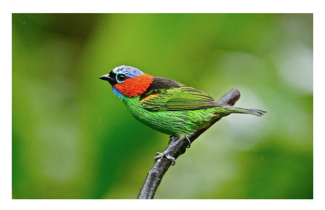
Red-necked Tanager (male), Sítio Folha Seca, Ubatuba

Once again, our Southeastern Brazil Tour delivered the bonanza of Atlantic Forest endemics and all-around great birding that we have come to expect from this region. But no two trips are ever exactly alike, and, as is always the case, the relative success of this tour in any given year, at least as measured in total species count and number of endemics seen, comes down to weather. And as we all know, the weather isn't what it used to be, anywhere! Weather had a larger than usual impact on us this year. While we enjoyed fairly typical conditions during our stay at Intervales, our three-and-a-half days based out of Ubatuba were plagued by nearly continuous rain, ultimately costing us a number of birds that we seldom, if ever, miss on this tour. Things were better at Itatiaia, where we lost only one afternoon and a couple of nights of planned owling to rain, but an unusual cold snap plunged temperatures far below the norm, which, literally, had a chilling effect on the levels of bird activity and vocalization.