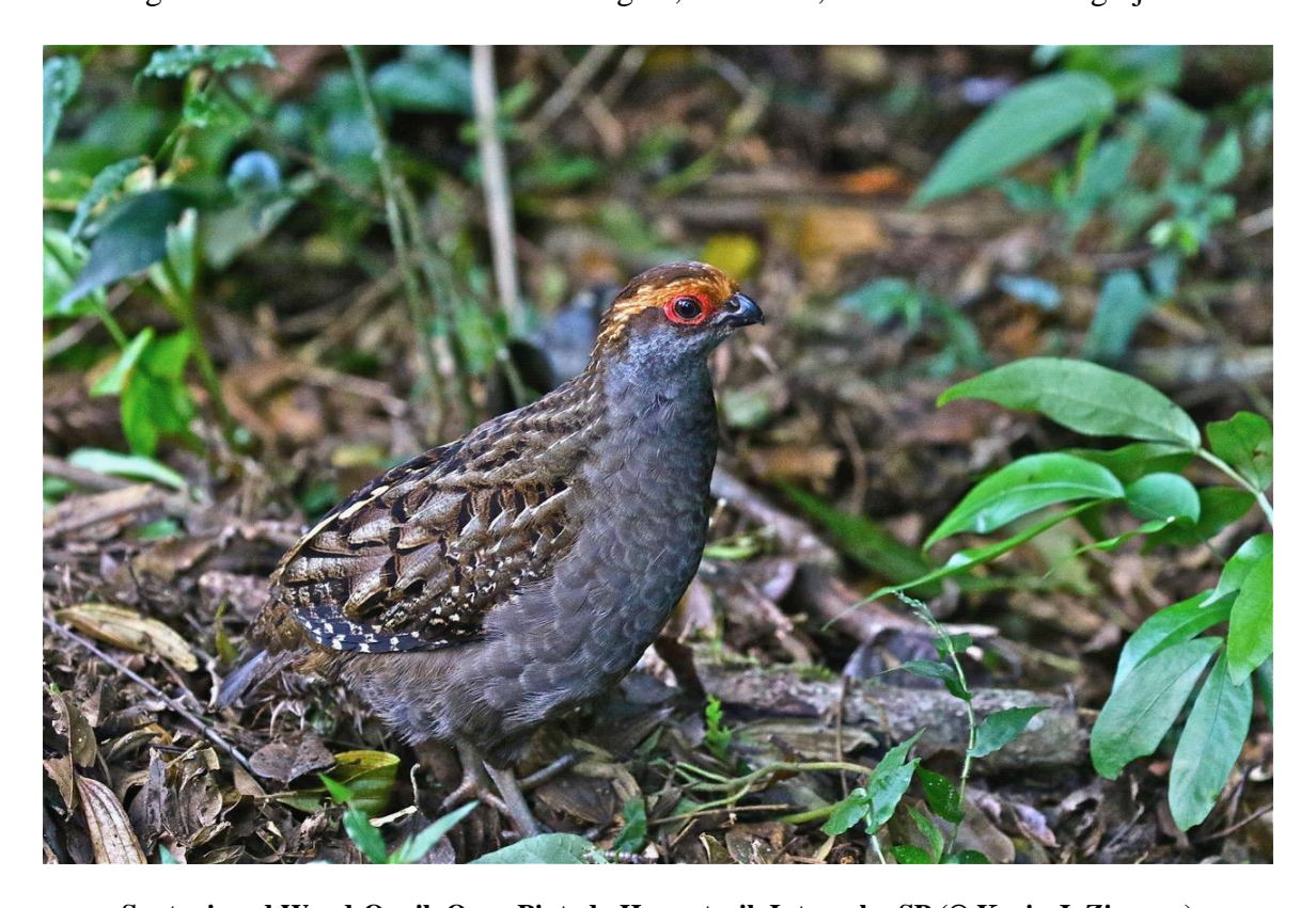
Spot-winged Wood-Quail, Onça Pintada House trail, Intervales SP

Gerson was mobbed by a covey of 9 wood-quail (4 adults and 5 youngsters that appeared to be about 2/3s grown) that nearly ran us over in their haste to receive a handout! The trail to the feeding station also treated us to an understory mixed-species flock led by multiple Red-crowned Ant-Tanagers, and which also included White-eyed Foliage-gleaner, Rufous-capped Spinetail, White-browed Warbler and others. Upon emerging from the gloom of the forest, we spotted a Black-and-white Hawk-Eagle soaring overhead and scored a Rufous Gnateater just inside another nearby forest patch. We then drove over to the Sede de Pesquizas for another hour of late afternoon birding, highlighted by a lovely pair of locally scarce Chestnut-backed Tanagers, a responsive pair of Dusky-tailed Antbirds, and a Striped Cuckoo that I managed to entice out into the open. With the gathering dusk, it was time to load up and drive outside the park along the entrance road to look for the spectacular Long-trained Nightjar. Unfortunately, a biting, cold wind had come up, and there was no sign of the nightjar at the staked-out spot. After a dusk vigil proved pointless, we headed back to the restaurant for dinner, knowing that we would have four more nights, if needed, to search for the nightjar.