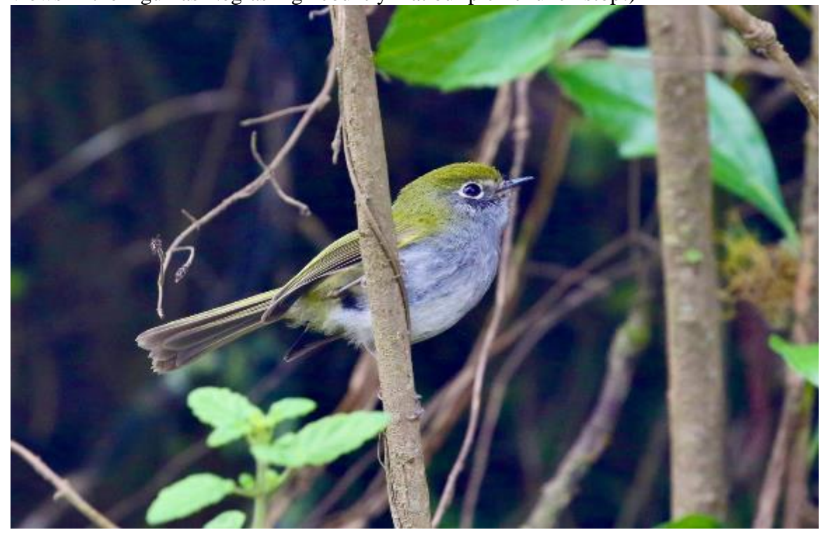
Serra do Mar Tyrannulet, Agulhas Negras Road, Itatiaia NP

Serra do Mar Tyrannulet ( Phylloscartes difficilis ) ( E ) - IT (Fabulous, point-blank views in the Agulhas Negras high country – at our picnic lunch stop!)