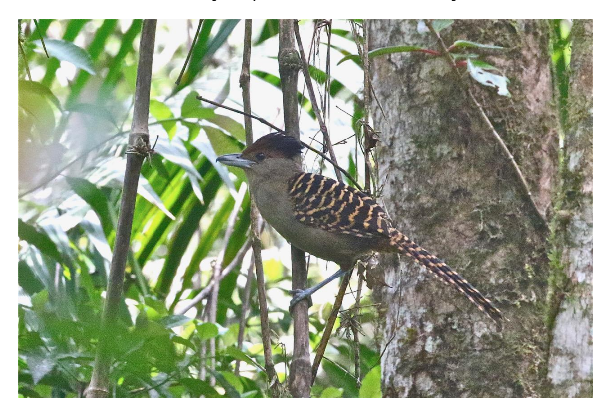
Giant Antshrike (female), Barra Grande Trail, Intervales SP

The following day was our last full day in the park. We devoted the morning to hiking the Barra Grande Trail , which we had previously visited only in the late afternoon. This decision paid big dividends, netting us good studies of a number of key birds that had, to this point, eluded us. Most exciting of all was the spectacular pair of Giant Antshrikes that came screaming down on top of us, offering prolonged studies of both male and female of this largest of all antbirds (roughly the size of a Squirrel Cuckoo) – one that, although not endemic to the Atlantic Forest, would definitely make my list of the 10 Coolest Birds of South America. Other highlights included another large antshrike, the Spot-backed, which we had heard on multiple occasions, but always distantly; Pale-browed Treehunter; "Atlantic" Royal-Flycatcher; male Pin-tailed Manakins (we had seen a female right outside of Pica-Pau House earlier, but no males) chasing one another about; a hyper-responsive Serra do Mar Tyrant-Manakin and Riverbank Warbler; Three-striped Flycatcher; and White-throated Spadebill.