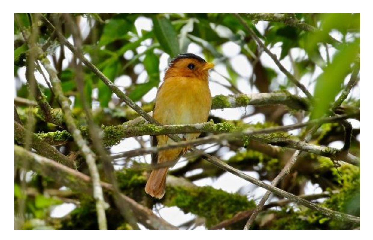
Black-capped Piprites (male), Agulhas Negras Road, Itatiaia NP

After thoroughly working the lower portion of the road, we climbed higher, eventually driving above the clouds and topping out at 2,450 m (8038') in elevation. A stop en route at a traditional lek site for the Green-crowned Plovercrest offered no evidence of current occupation by that species – a pattern that would be repeated at other known lek sites at still higher elevations. It seemed as though the current cold-front that we were experiencing had forced the plovercrests to warmer, if not greener, pastures, because we heard nary a one of these typically vocal hummingbirds.