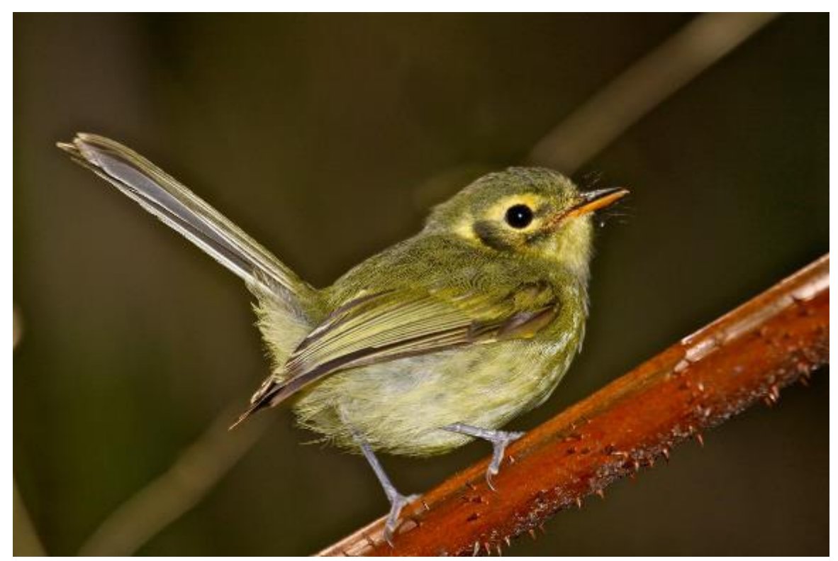
Oustalet's Tyrannulet, Lajeado Trail, Intervales SP

Serra do Mar Tyrannulet ( Phylloscartes difficilis ) ( E ) - IT (Fabulous, point-blank views in the Agulhas Negras high country – at our picnic lunch stop!)