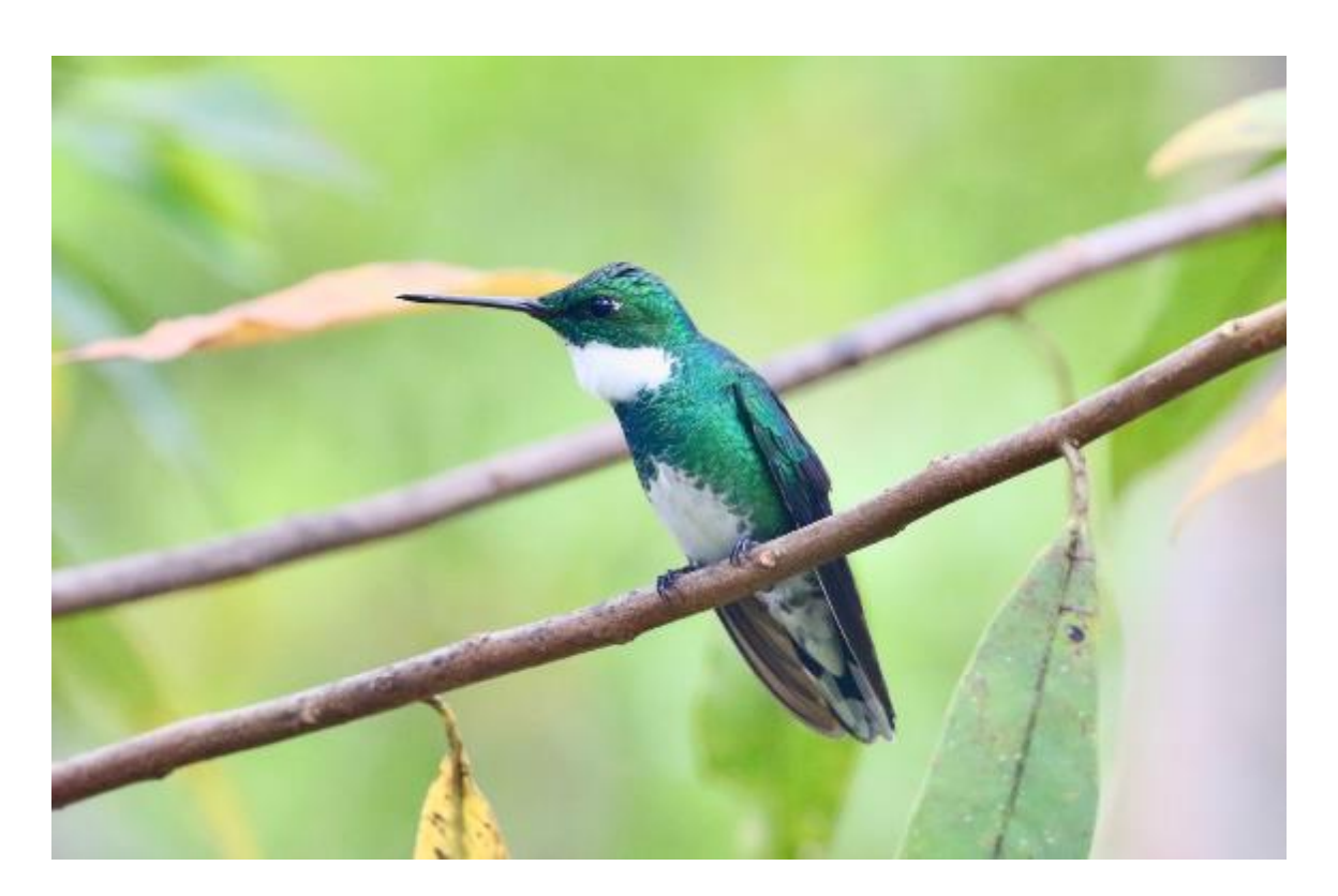
White-throated Hummingbird, Pousada Oikos, Serra do Mar SP

Sapphire-spangled Emerald ( Amazilia lactea ) - IN (1 perched at the edge of the big marsh, near Reception, on 10/26, was our only record.)