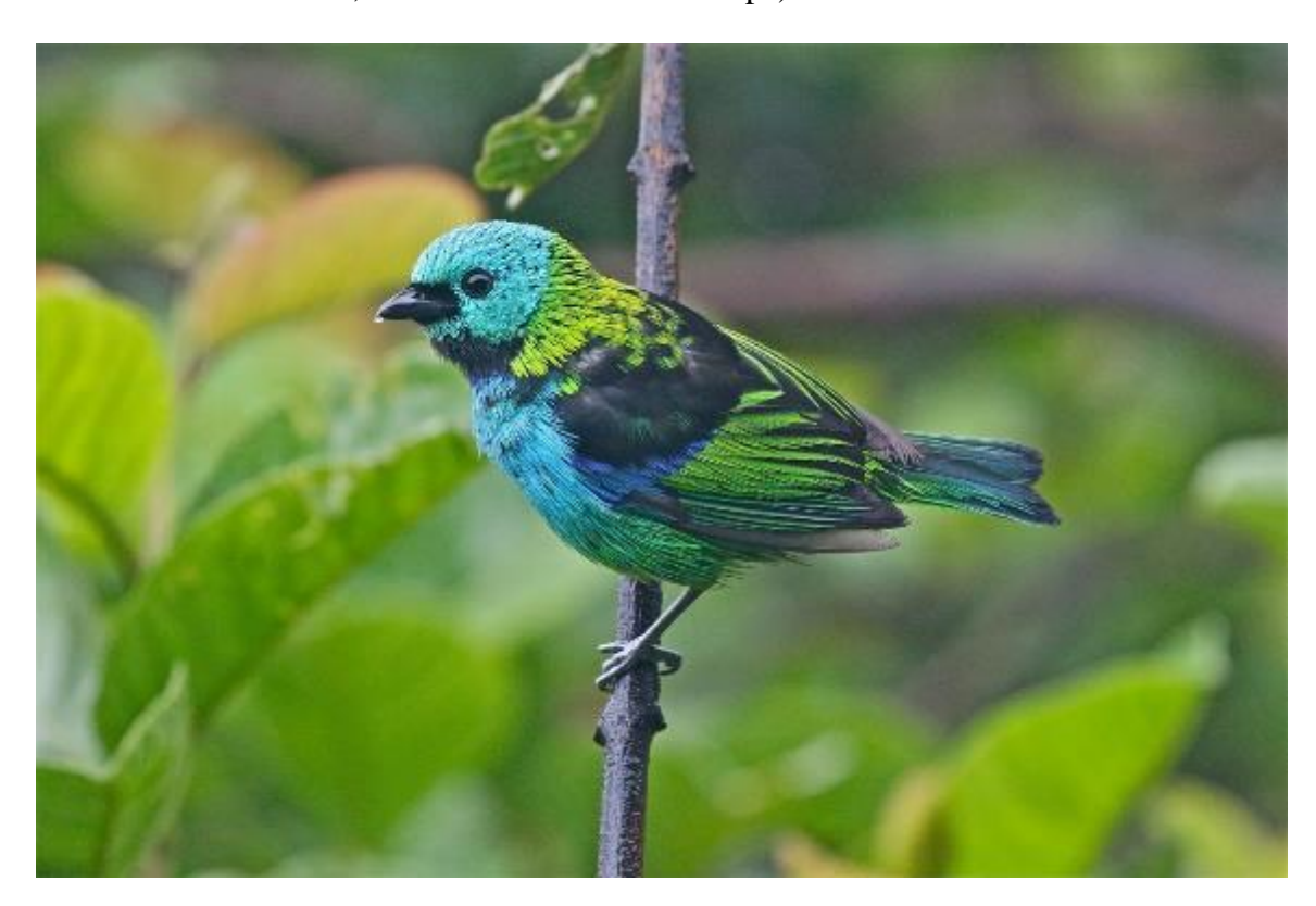
Green-headed Tanager, Hotel do Ypé, Itatiaia NP

Green-headed Tanager ( Tangara seledon ) ( E ) - Common; seen daily (except for the initial long travel day of 10/24), and at all forested locales visited, including many stunning, point-blank studies at the various feeding stations (Pica-Pau House, the restaurant at Intervales, Folha Seca and Hotel do Ypé).