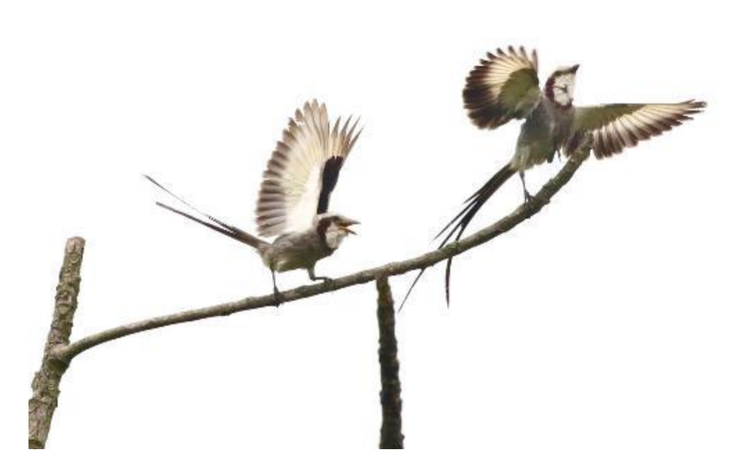
Streamer-tailed Tyrants, Resende Marsh, RJ

On our last day, we spent a final hour enjoying the feeder action at the Hotel do Ypé and then began our return drive to Rio, with a couple of important, open-country birding stops en route. These were highlighted by wildly displaying Streamer-tailed Tyrants , duetting White-eared Puffbirds and Wing-banded Horneros, Snail Kites and Savanna Hawks, Ash-throated Crake, Green-barred Woodpecker, White-rumped Monjita, Whistling Heron, and rare views of a perched Tawny-headed Swallow, among many others.