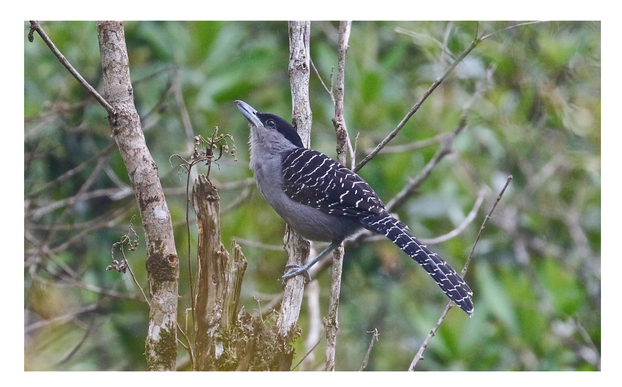
Giant Antshrike (male), Intervales SP

Intervales is always a hard act to follow, but the next venue on our itinerary was the coastal resort of Ubatuba , which promised its own set of highlights. But first we had to get there – no mean feat, given that we had to drive all of the way back to São Paulo, and then on to Moji das Cruzes, where, with the clock ticking in the late afternoon, we needed and completed a surgical strike (successful!) on the recently described Marsh ("São Paulo") Antwren before continuing on to Ubatuba.