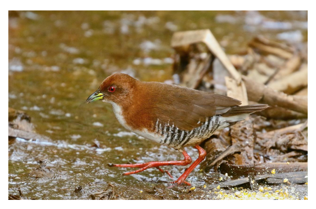
Red-and-white Crake, Intervales SP

the bananas and papayas with which we had baited the feeder out front. Gradually, we made our way over to the park headquarters, where Gerson pointed out an active Swallow-tailed Cotinga nest. We spent some time admiring these exquisite birds and got to see the male and female exchange places at the nest. From here, we made our way around the big marsh to a small lake, and then back past the soccer field, checking off one special bird after another. Highlights of this walk included extended, point-blank studies of a very responsive male Ochre-collared Piculet (at eye level no less); a snazzy Gray-hooded Attila; a skulking pair of Orange-breasted Thornbirds; and a confiding White-rumped Monjita. However, our real quarry of the walk around the marsh was the Red-and-white Crake, a secretive marsh phantom that is normally among the most difficult of a notoriously difficult family of birds to see. But, thanks to the efforts of the Intervales guides, there are a few resident pairs of crakes that have become habituated to being fed, and one of these lovely little birds materialized out of the reeds almost as soon as the site was baited.