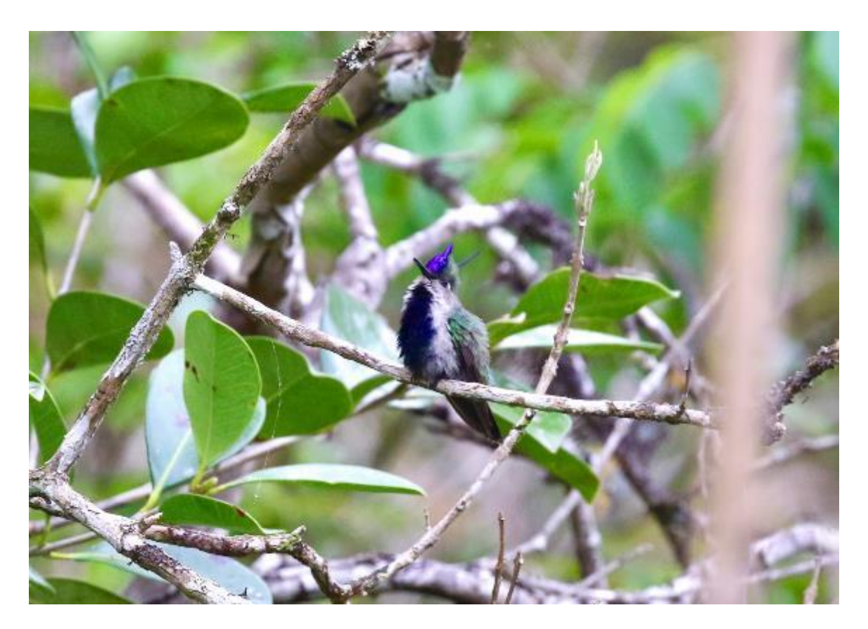
Purple-crowned Plovercrest (male at lek), Intervales SP

Violet-capped Woodnymph ( Thalurania glaucopis ) ( E ) - IN, UB, IT Swallow-tailed Hummingbird ( Eupetomena macrourus ) - SP, SP to IN, UB, PE Sombre Hummingbird ( Eupetomena cirrochloris ) ( E ) - UB (Lone individuals at Pousada Oikos on 10/31, and at Folha Seca on 11/1.)