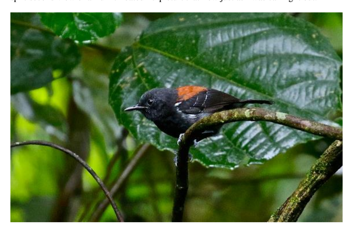
Black-hooded Antwren (male), Pereque, Rio de Janeiro