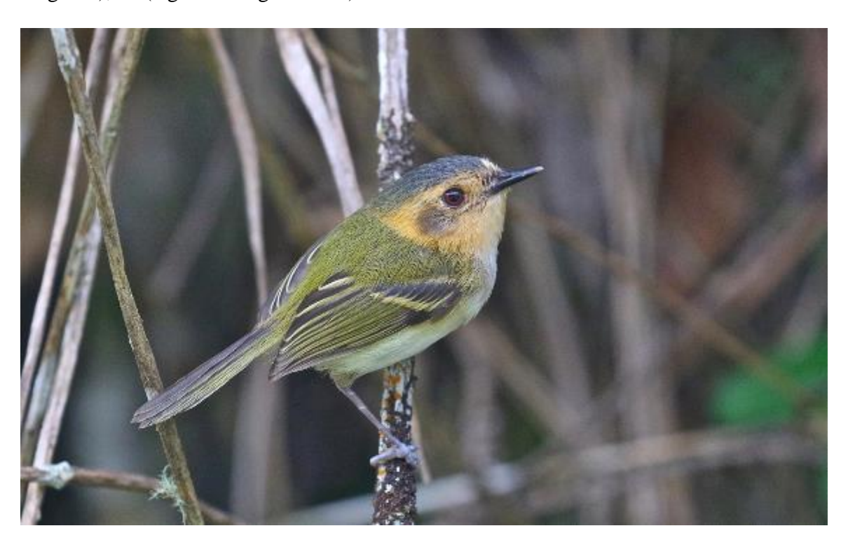
Ochre-faced Tody Flycatcher, Pica-Pau House, Intervales SP

Ochre-faced Tody-Flycatcher ( Todirostrum plumbeiceps plumbeiceps ) (e) - IN (Seen/heard daily, most often right off the driveway at Pica-Pau House.), UB* (Fazenda Angelim), IT (Agulhas Negras Road)