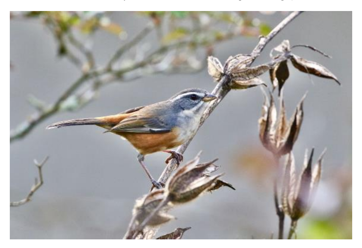
Gray-throated Warbling-Finch, Taquinho Restaurant, Intervales SP area

Gray-throated Warbling-Finch ( Microspingus cabanisi ) - IN (Territorial pair around the restaurant, where seen almost daily.) (See taxonomic note under previous species above. Intervales is essentially at the northern limit of this species' range.)