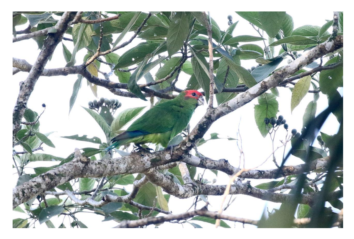
Pileated Parrot (male), Pica-Pau House, Intervales SP

With dusk approaching, it was time to head back out the entrance road and take another stab at our biggest nocturnal target, the endemic Long-trained Nightjar . Males of this spectacular nightjar tend to appear each evening at favorite spots on the forest roads, from which they hawk flying insects. Rainy conditions mean few or no flying insects, and it also means that nightjars sitting on the ground risk matting their magnificent tails with mud. But it was dry on this night, not to mention warmer, and without the brisk winds of the previous night, so conditions appeared to be in our favor. Sure enough, we had not been on site long before the male nightjar appeared, like an apparition, its incredibly long, white tail-streamers wafting on the slight breeze as it cruised up and down the road past us, before alighting on the roadside, frozen in our spotlight beams. We went first for scope views, and then, when it was apparent that the bird was not going anywhere, we all walked closer, for what proved, ultimately, to be mind-blowing views and photo-ops. Getting this bird on just our second try was a real coup – many trips require multiple attempts, and if the weather doesn't cooperate, it's an easy bird to miss entirely.