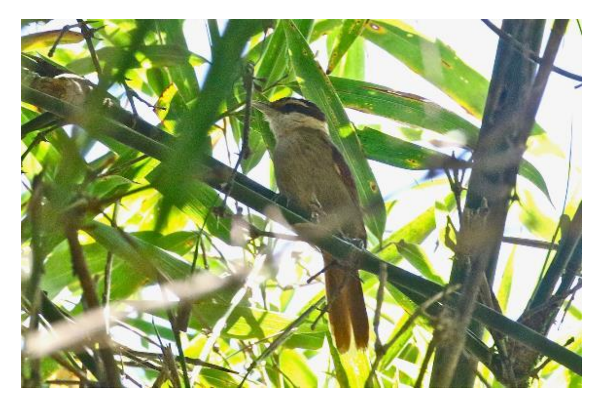
White-bearded Antshrike (female), Mirante da Anta Trail, Intervales SP

Rufous-capped Antshrike ( Thamnophilus ruficapillus ) (e) - MO (At the antwren marsh.), IT (In the alpine "heath" zone at the top of the Agulhas Negras Road.) Variable Antshrike ( Thamnophilus caerulescens caerulescens ) (e) - IN, IT Star-throated Antwren ( Myrmotherula gularis ) (E) - IN (Carmo Road and Lajeado Trail), UB (Seen nicely at Fazenda Angelim.), IT* (Heard along the Jeep Trail.) Spot-breasted Antvireo ( Dysithamnus stictothorax ) (E) - IN, UB, IT Plain Antvireo ( Dysithamnus mentalis ) (e) - IN, IT