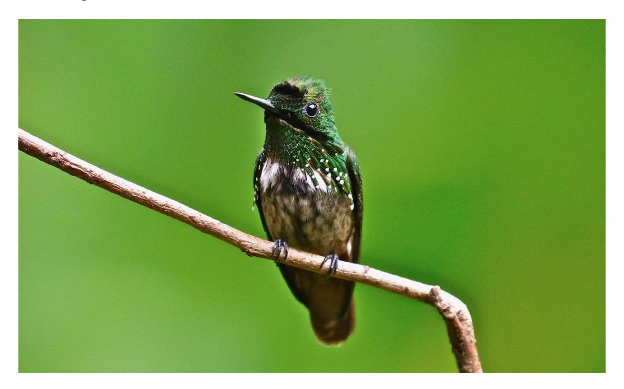
Festive Coquette (male), Sítio Folha Seca, Ubatuba