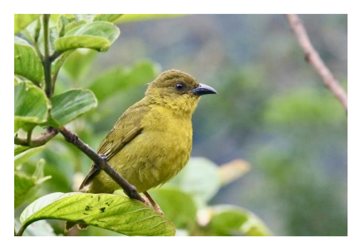
Olive-green Tanager, Hotel do Ypé, Itatiaia NP