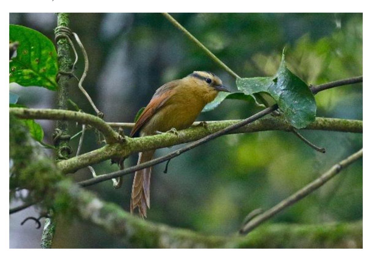
Buff-fronted Foliage-gleaner, Carmo Road, Intervales SP

Buff-fronted Foliage-gleaner ( Philydor rufus ) - IN (4-10 daily), IT (Jeep Trail & Tres Picos Trail)