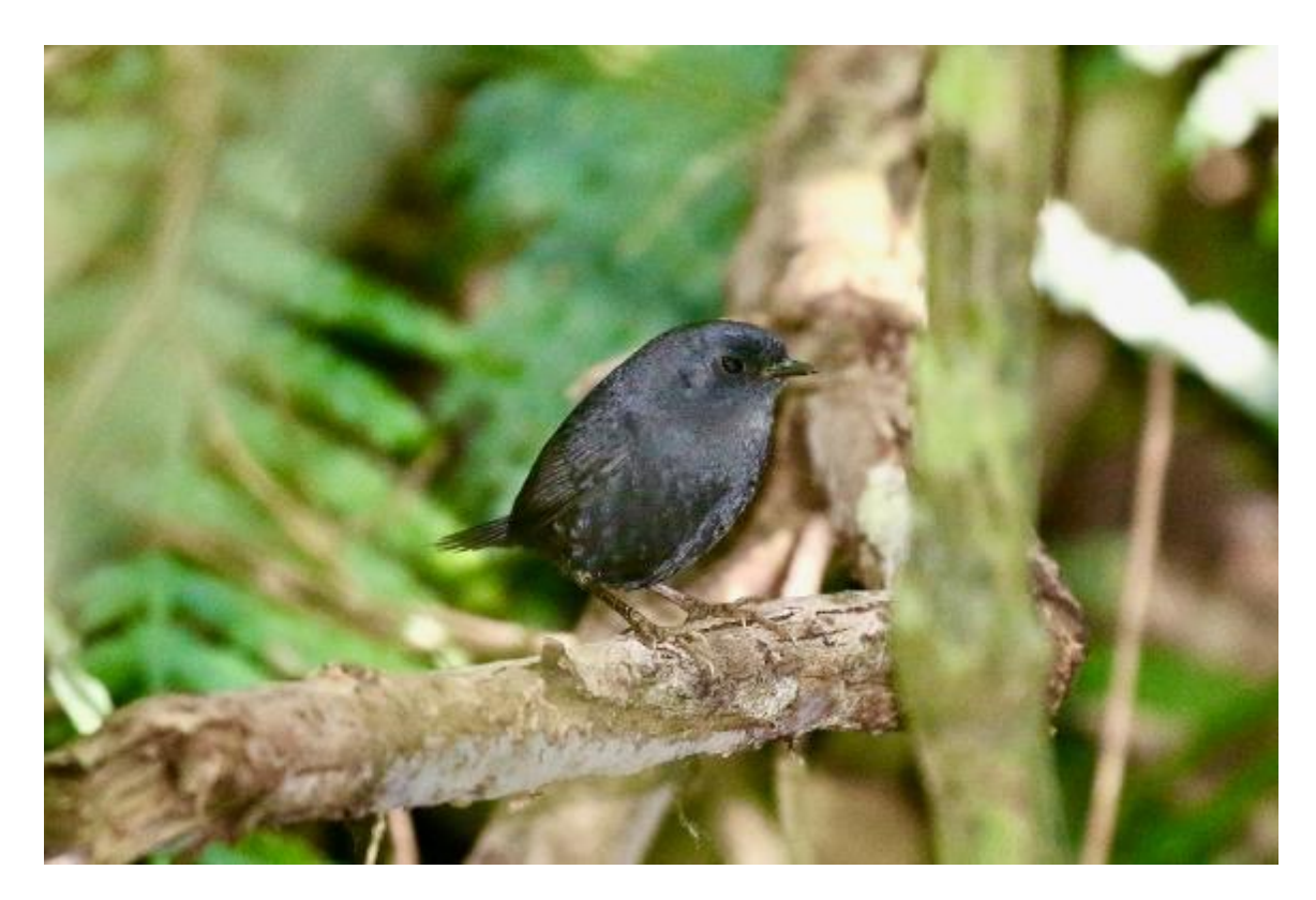
Mouse-colored Tapaculo (southern vocal type), Lajeado Trail, Intervales SP

"Northern" Mouse-colored Tapaculo (Scytalopus speluncae) (E) - IT (Agulhas Negras Road) {See taxonomic note above.}