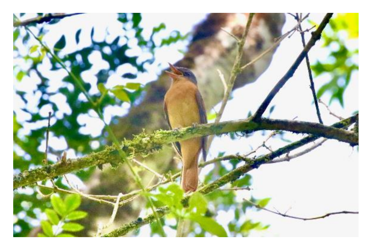
Rufous-tailed Attila, Lajeado Trail, Intervales SP

Gray-hooded Attila ( Attila rufus ) ( E ) - IN (Seen on the back side of the big marsh, and along the Lajeado Trail; heard along the Carmo Road and Barra Grande Trail.), UB* (Heard daily.), PE, IT* (Heard daily.)