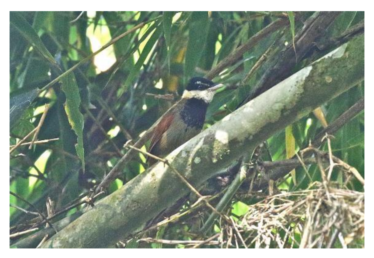
White-bearded Antshrike (male), Mirante da Anta Trail, Intervales SP

White-bearded Antshrike ( Biatas nigropectus ) ( E ) - IN (Nice looks at both male and female of this rare, Atlantic Forest endemic, along the Mirante da Anta trail on 10/26. We actually had 3 different pairs in different stands of bamboo along that trail!)