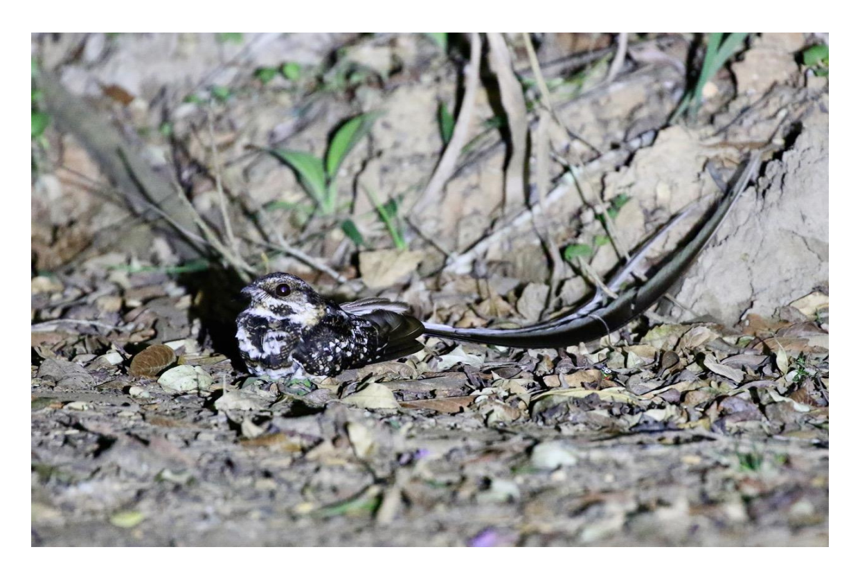
Long-trained Nightjar (male), Intervales State Park

After breakfast the following morning, we headed out to the Carmo Road , where we spent the rest of the morning walking along a jeep track through marvelous Atlantic Forest with abundant thickets of native bamboo. The number one highlight here for most of us was finding a male Bare-throated Bellbird on his song perch . We had been hearing bellbirds for the past two days, but none were particularly close, and even careful scoping of the forest canopy had failed to pick one out. This one was near the top of a small, spindly tree, isolated in a small clearing from the surrounding forest, and it was relatively close, as well as exposed. We watched this immaculately white-plumaged bird with the bare metallic-green face and throat through the scope for 30 minutes, marveling at the great, gaping yawn that preceded every hammer-on-anvil clank. The bellbird alone made the morning, but a Pavonine Cuckoo, a pair of Saffron Toucanets, a responsive pair of Bay-ringed Tyrannulets, a pair of Swallow Tanagers perched at eye level, tail-shivering Oustalet's Tyrannulets, and a Long-billed Gnatwren flaunting his namesake "lying Pinocchio" schnoz, all added substantial frosting to the cake.