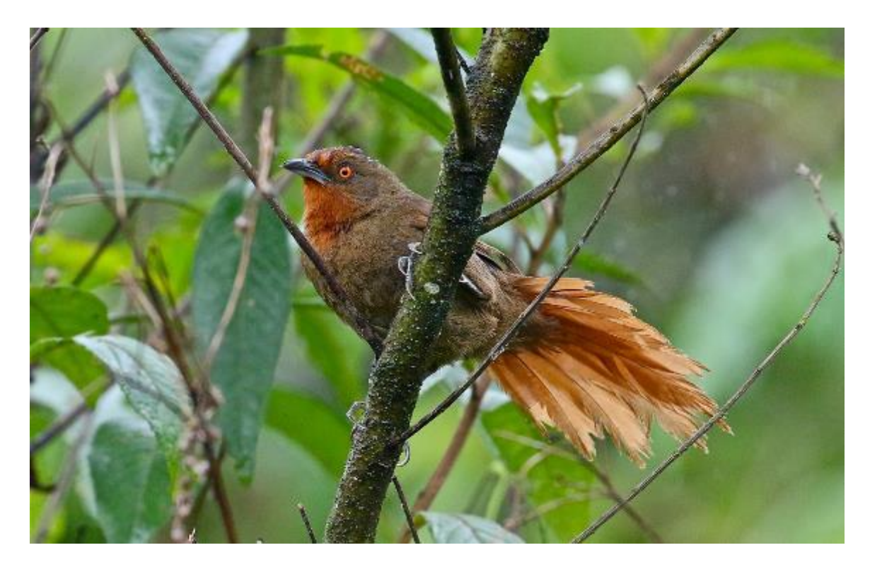
Orange-eyed Thornbird (slightly soggy), Perequé, RJ

After more showers overnight, we awoke to overcast skies, but no rain. We had a last morning to spend in the Ubatuba region, and we were still missing some target birds, so I opted to head back to the Condominio Verde Mar Trail for another try. This time, except for one very brief and very light shower, the rain held off, and we were able to work a kilometer or so of trail in the time available to us. This decision paid-off in a big way, first, when I managed to tape in a pair of Black-cheeked Gnateaters for spectacular views (the males are gorgeous!), and then, when a bird that looked suspiciously like a puffbird flashed across the trail, it proved, indeed, to be the endemic Crescent-chested Puffbird, our first, and only one of the trip. The puffbird was not inclined to stick around for long, but I managed to bring it back a few times with playback, and everyone enjoyed exceptional views. This trail also produced some mixedspecies flock activity treating us to a few new birds (Black-capped Becard, Gray Elaenia), as well as better views of some things seen earlier in the trip (Streak-backed Antwren); another Spot-backed Antshrike; Slaty-breasted Wood-Rails strolling down the center of the trail; and a swallow feeding frenzy over a small marsh that included multiple White-thighed Swallows among the more common Southern Rough-wings.