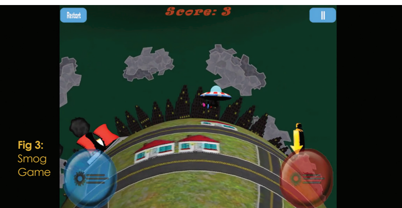
Fig 3: Smog Game