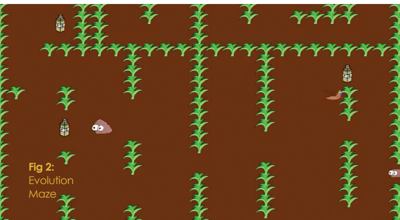
Fig 2: Evolution Maze