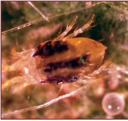
Figure 17: This two-spotted spider mite (with egg, lower right) was found on strawberry plants during December.

leaves from several plants, including the underside and be sure to check each strawberry cultivar since mites may have varietal preferences.