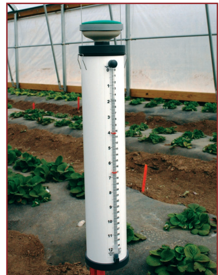
Figure 13: Atmometers are popular for measuring soil moisture levels. They offer a simple way to measure on-site evapotranspiration.