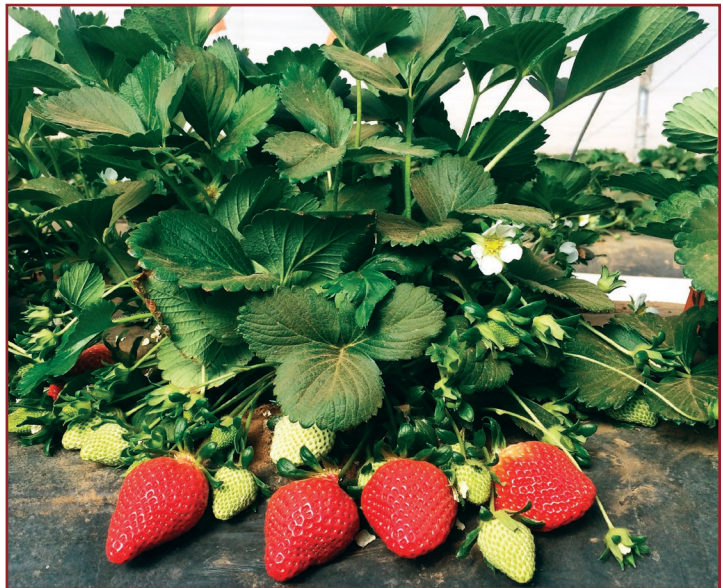
Figure 6: A healthy strawberry plant with leaves, blossoms, developing fruit, and mature berries.

All strawberry flowers have male and female structures and are somewhat self-pollinating (Fig. 7). Pollination occurs naturally with wind and movement of the flowers. However, bees and other insects can increase the pollination rate and improve berry yield and quality. The flower pistils become receptive in successive rings starting at what will form the base of the fruit. The progression of pistil maturity takes 4 to 7 days, during which time several bee visits are required for a well-formed fruit to develop.