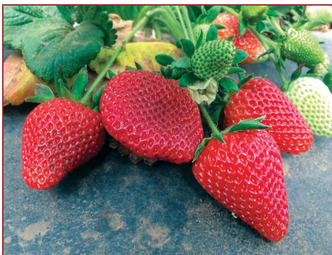
Figure 1: Locally grown strawberries are a very popular crop; however, they can be difficult to find in many areas of Texas.

If you plan to grow strawberries, do so only after very careful analysis with horticulture, risk management and marketing specialists, as well as retailers and other producers.