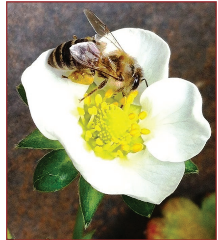
Figure 9: Honeybees will help improve pollination and overall quality of the berries.

Bee activity also depends on flowering patterns. When the crop does not have enough flowers, bees will go elsewhere. This reduces their efficiency when strawberries are in full bloom. Mow nearby weeds regularly to keep them from flowering and competing with the strawberry crop. Use insecticides cautiously and do not spray them directly onto the crop during peak bee activity.