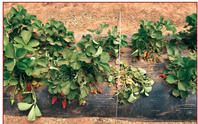
Figure 20: Strawberries are susceptible to root diseases. Some of these diseases may spread through irrigation water.

Root rot from P. fragariae causes a red discoloration of the stele (core) of the root. P. citricola is aggressive and may kill the plant rapidly. Other Phytophthora species cause problems only in low-lying areas where water drains poorly. Injury at planting may allow the pathogen to gain entry through the wound.