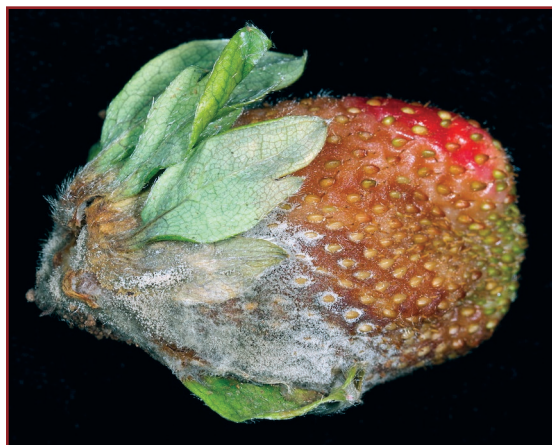
Figure 19: Botrytis grey mold is prevalent in all environments and especially during cool, wet weather. Higher humidity levels in high tunnels may increase berry infection.

The fungus infects flowers, but often only becomes active when berries are nearly mature or after harvest (Fig. 19). Like the leaves, infected berries develop a dense, gray fungal growth that