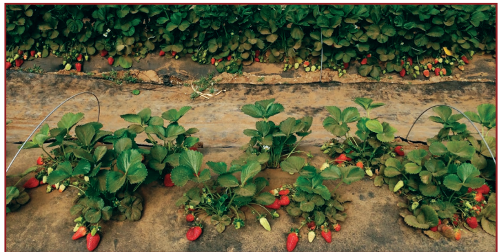
Figure 15: Spider mite damage (foreground) can reduce plant growth and strawberry yields. Producers must monitor for mites by scouting their plants weekly.

Spider mites can colonize plants from the time they are planted until the end of the season. Check strawberry plants for spider mites before transplanting—treat if they are present. Inspect plants weekly by examining