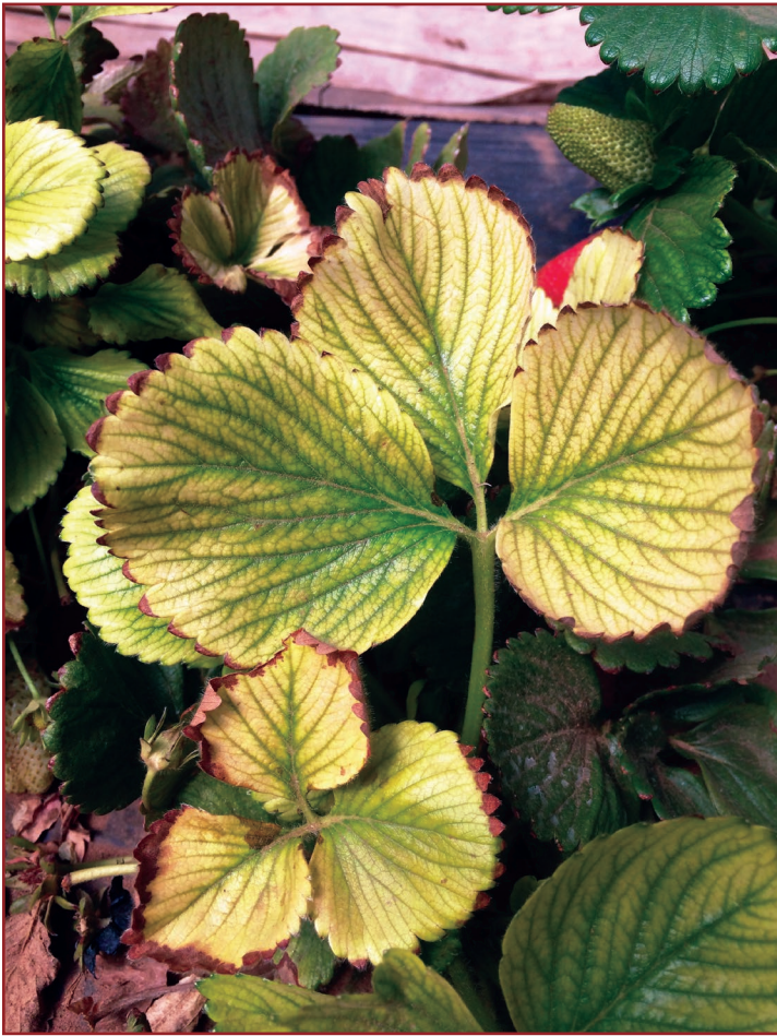
Figure 10: High pH soils may influence nutrient uptake resulting in a deficiency or toxicity. These leaves suggest iron deficiency.

Alkaline soils (pH 7.1 to 8.5) may indicate that the soil contains free calcium carbonate. Such soils require the addition of elemental sulfur or sulfuric acid to lower the pH. It can take large quantities of these materials depending on the level of calcium carbonate in the soil. They also can take 2 to 10 years to completely change the pH of soil. It is typically very hard to lower the pH in such soils, so strawberries may experience iron deficiency. Applying iron chelates to the soil or plant's leaves can help to prevent chlorotic (yellow) leaves (Fig. 10).