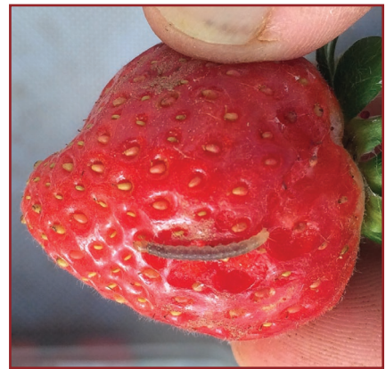
Figure 14: Lepidopteran pest feeding on a strawberry. Heavy infestations can cause heavy yield losses and require producers to take control measures.

Monitor for adults using pheromone traps. Monitor leaves for chewing damage, clusters of lepidopteran frass (small black pellets), or curled leaves. Open curled leaves and open webbing to search for larvae or insect frass.