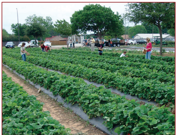
Figure 3: A pick-your-own operation.

With pick-your-own (PYO) operations, consumers come directly to the farm and harvest strawberries themselves (Fig. 3). These operations are feasible for crops like strawberries where it is easy to identify mature product. Varieties that mature at different times can be grown in separate fields to keep them from being picked too early. Consumers often prefer PYO operations because they like to select fresher, higher quality produce at lower prices. Many enjoy picking berries as a recreational activity or family outing.