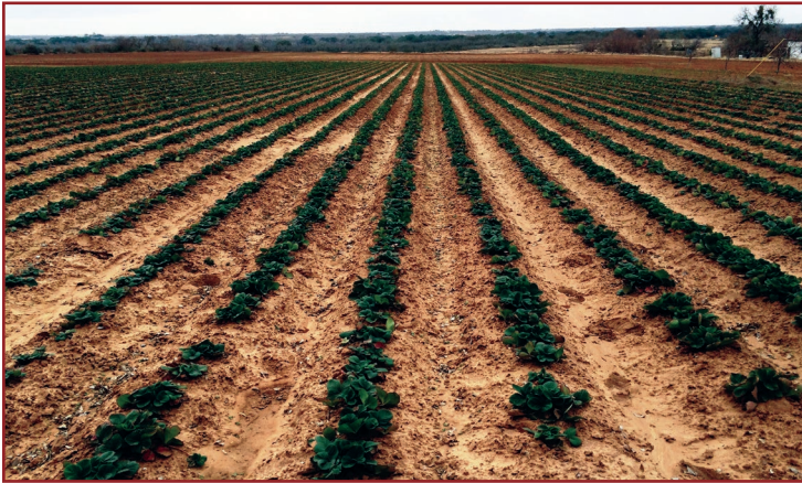
Figure 2: Typical strawberry field production in South-central Texas includes bare-rooted plants and furrow irrigation.

The average annual acreage in Texas from 1937 to 1946 was 1,360 acres. Smith and Wood counties in East Texas along with the coastal area below Houston and the Wintergarden region had the highest production. By 1958, Texas had just 600 acres under cultivation and represented less than one percent of the nation's strawberry production.