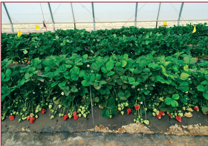
Figure 8: Short-day variety ‘Festival’ laden with berries in early April in Lubbock.

Long-day or everbearing varieties initiate flowers when day length is 12 hours, but struggle to flower consistently at temperatures above 90°F. These conditions are common in Texas during the summer months so everbearing varieties are generally not suited for open-field production. They are