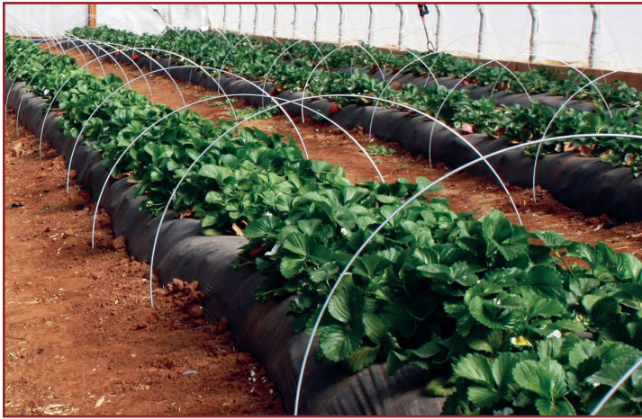
Figure 4: Raised beds with drip irrigation and plastic mulch are an important method in annual strawberry production.

be firm and uniform, and plastic mulch should be laid tightly over the bed to keep it from tearing during high winds (Fig. 4). Loose plastic can damage plants, and it takes time and effort to replace it. If investing in new or used equipment, be prepared to spend $5,000 to $10,000 or more.