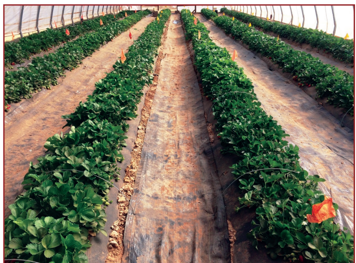
Figure 5: High tunnels are a popular technology for growing strawberries. They can improve yield and quality and extend the growing season.

Other popular systems include growing strawberries in greenhouses using hydroponic gutters or hydrostackers, or in the soil inside high tunnels. High tunnel strawberry production is similar to open field plasticulture, but the crop is protected with a plastic covered frame. Texas A&M AgriLife Extension Specialists have shown high tunnel production to be successful in Texas (Fig. 5).