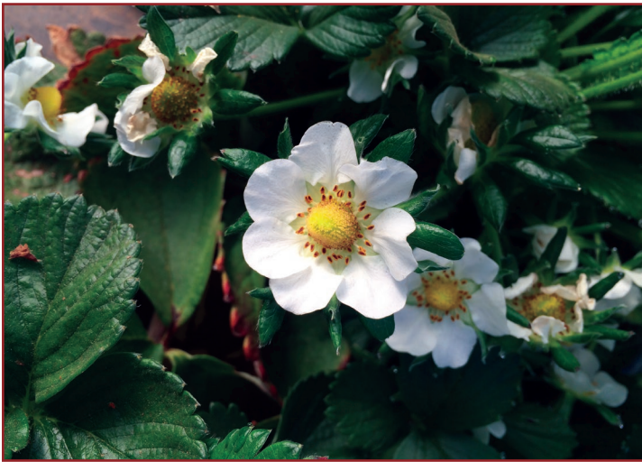
Figure 7: The strawberry flower has male and female parts and is generally self-pollinating. Wind and bees can improve pollination.

Although the fruit resembles a conical berry, the fruit is more correctly identified as an accessory fruit or pseudo fruit, formed from an enlarged flower receptacle embedded with the many tiny ovaries or achenes. Achenes resemble tiny seeds on the outside of the berry. New varieties of strawberries come from controlled pollination and planting selected seeds, whereas genetically identical plants arise from the runners off the mother plant.