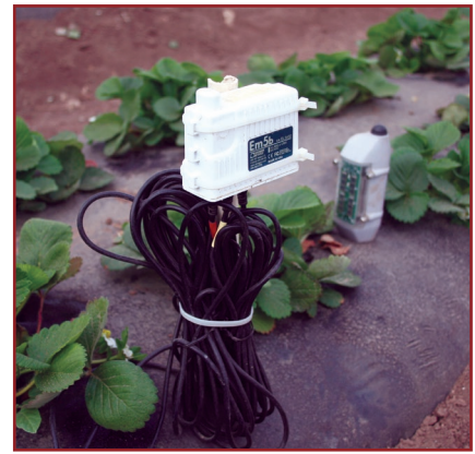
Figure 12: Monitoring soils for appropriate moisture levels will increase water use efficiency and reduce potential root diseases.

Regardless of method, efficient irrigation in strawberries is critical to high-quality yields. Soil moisture levels should be monitored regularly to ensure the strawberry crop receives adequate and timely moisture.