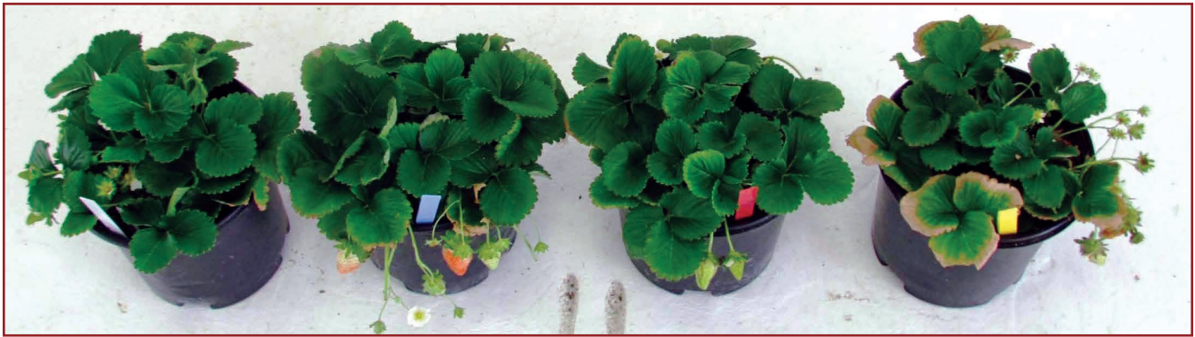
Figure 11: Increasing salinity levels (from left to right) show increasing symptoms of leaf yellowing and marginal burning.

Overall salinity is the concentration of total dissolved solids (TDS) in water. In farming, overall salinity is commonly estimated by the electrical conductivity (EC) of the irrigation water or a soil sample and is directly related to the concentration of salts.