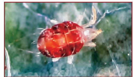
Figure 16: Carmine spider mites reproduce quickly and can infest strawberries throughout their entire growing cycle. High tunnel strawberries may be susceptible to mites even during the winter months.