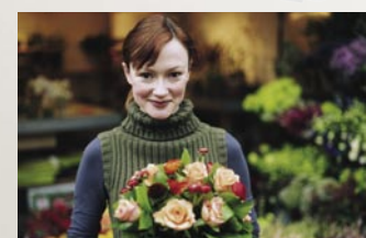
PIXMA MP750 and MP780 with photo black for heightened contrast