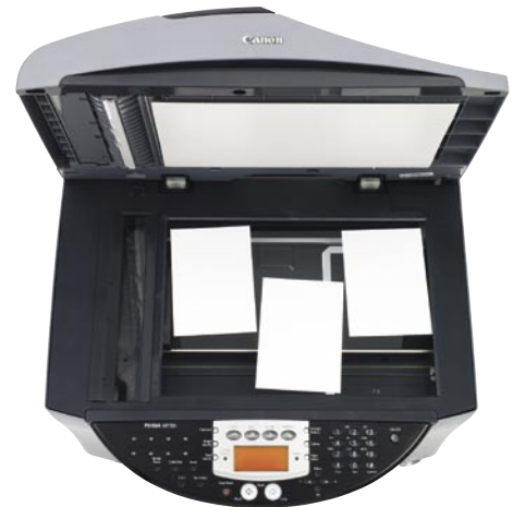
Multi-photo mode 7