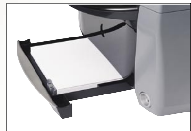
Front cassette paper feeding