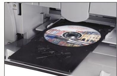
Prints directly on CD-R and DVD-R media