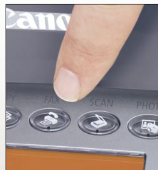
Up to 3 seconds per page faxing 9