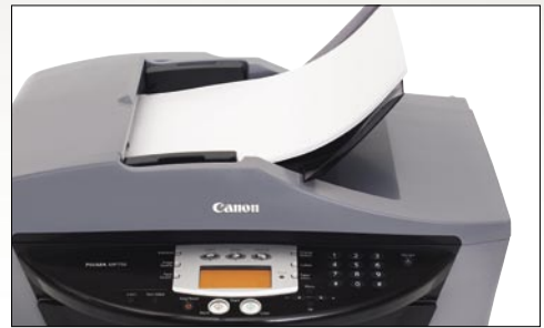
Automatic Document Feeder: holds up to 35 sheets