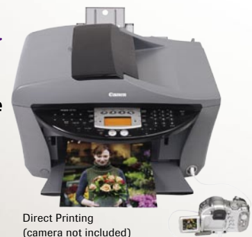
Direct Printing (camera not included)