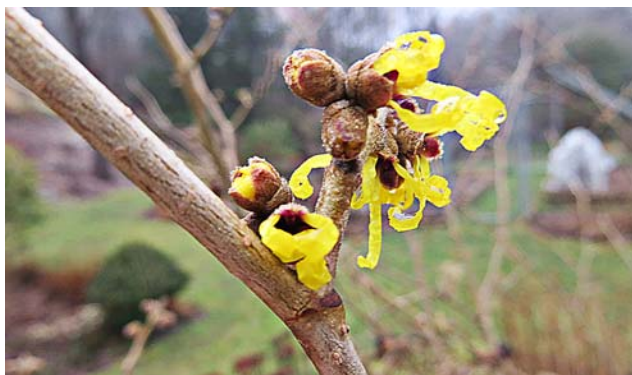
Hamamelis 'Pallida' on Jan 17 2014.