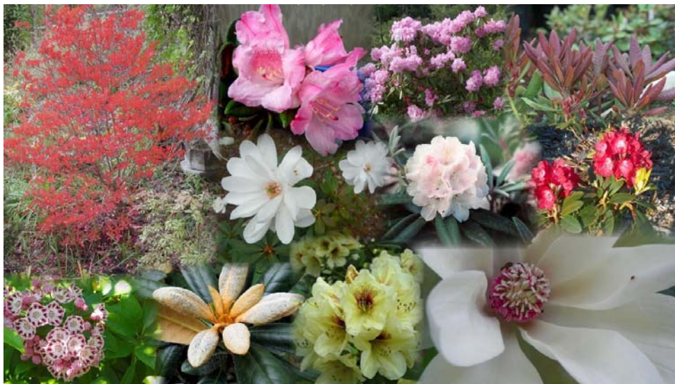
Some of the plants on offer in the ARHS 2014 Seed Exchange and Sale.

The seed list and order form are posted on the Willow Garden website http://www.willowgarden.net/ with links to images and information to help in your decision-making. Look for periodic updates on seed lot availability. Deadline for members-only orders is Feb 28, 2014. Then it's open to all until the sale closes on April 30. Shipping and handling is now $3.00. In view of upcoming changes at Canada Post, this may need a further change.