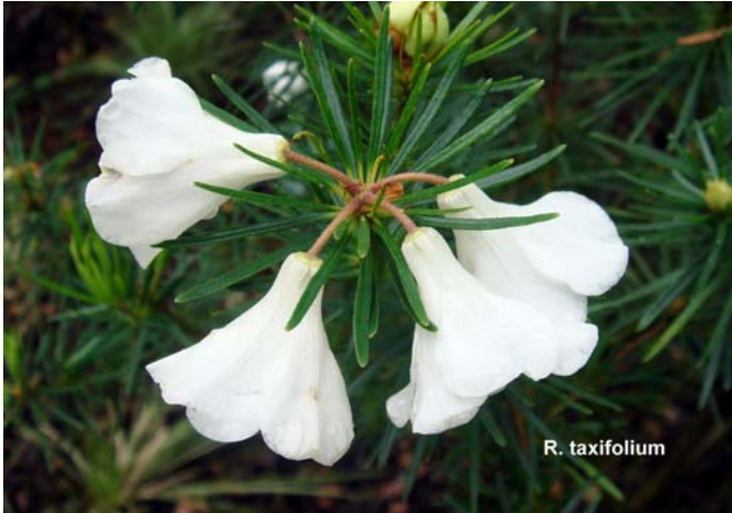
R. taxifolium , (vireya) in the Rutherford Conservatory.