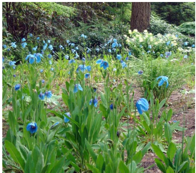
This is our meadow of Himalayan Blue Poppies at the Rhododendron Species Foundation and Botanical Garden in Federal Way, Washington.

R. boothii R. griffithianum R. hodgsonii aff. R. macabeum (alpine form) R. titapuriense R. forrestii R. mallotum R. edgeworthii R. seingkuense R. asterochnum R. huianum R. ochraceum Podocarpus wangii R. guihainianum R. dachengense Nothotsuga longibracteata R. glanduliferum R. yuefengense R. platypodum R. faithiae R. brevicaudatum R. mariesii R. excellens R. sinofalconeri Lonicera crassifolia Enkianthus deflexus Menziesia 'Plum Drops'