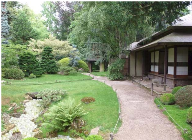
In the 'Japanese village' section of the Albert Kahn Museum garden.