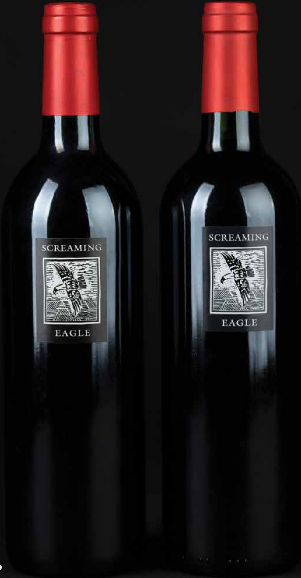
Lots 544 & 549