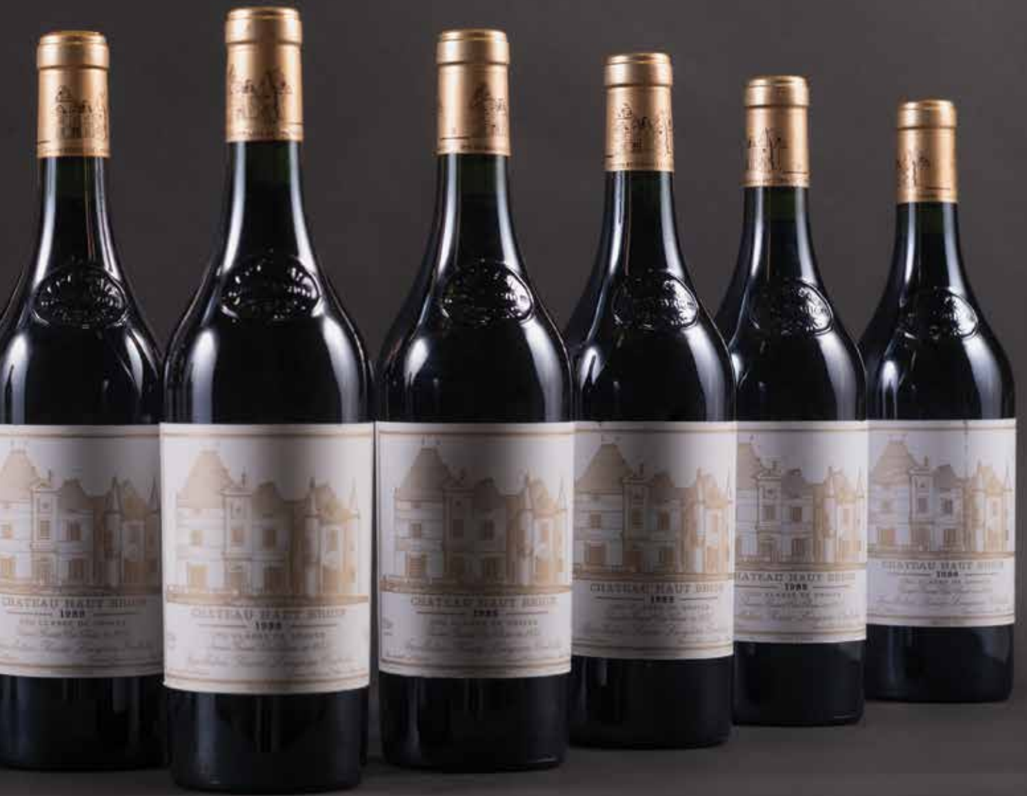
Lots 453 & 456