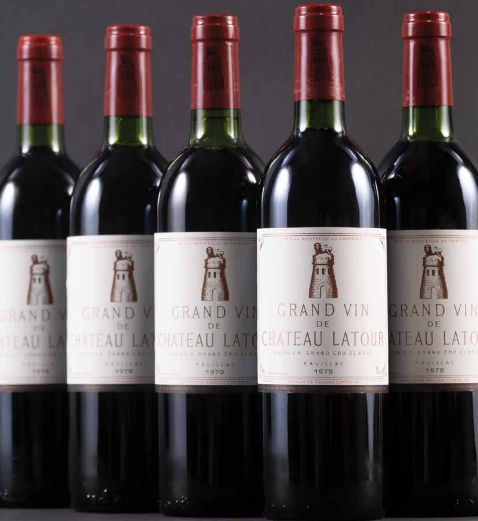
Lots 107 & 108