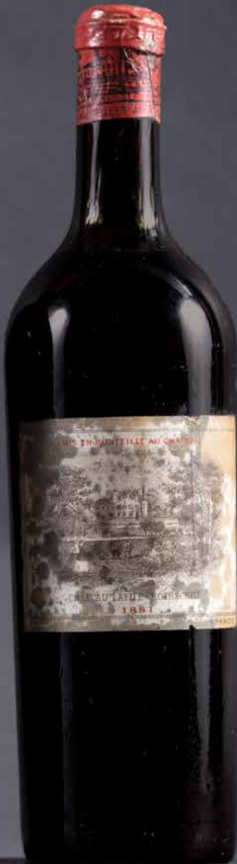
Lots 390 & 391