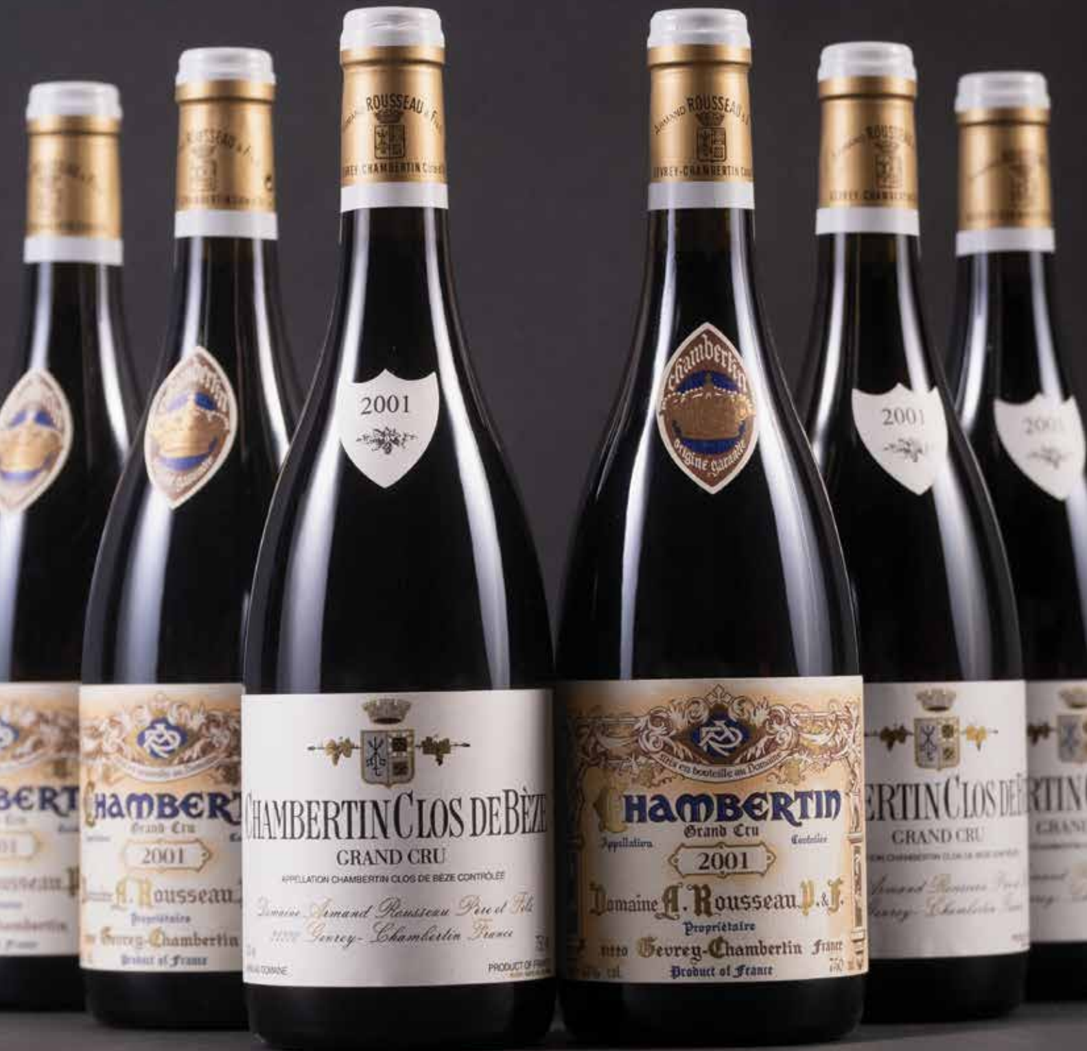
Lots 480 & 481