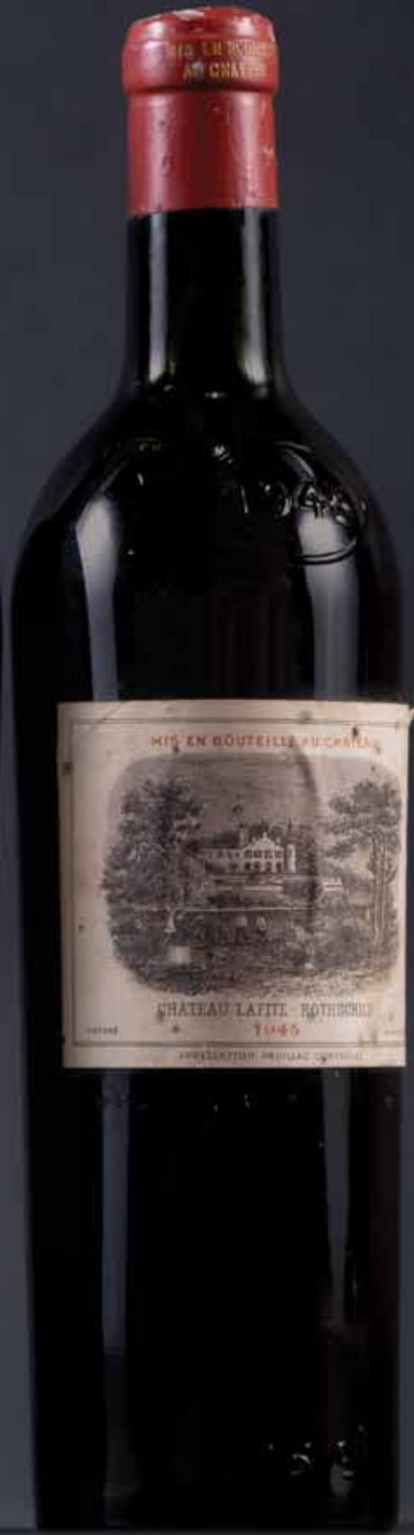
Lots 409 & 423