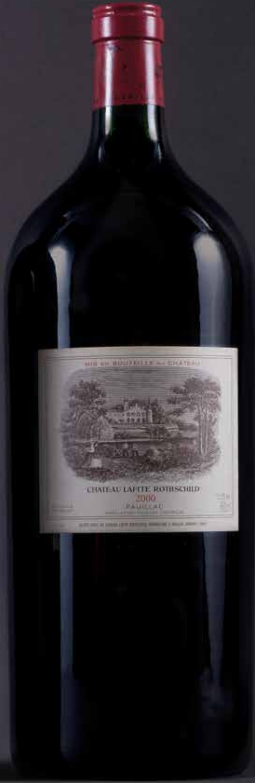
Lots 436 & 439