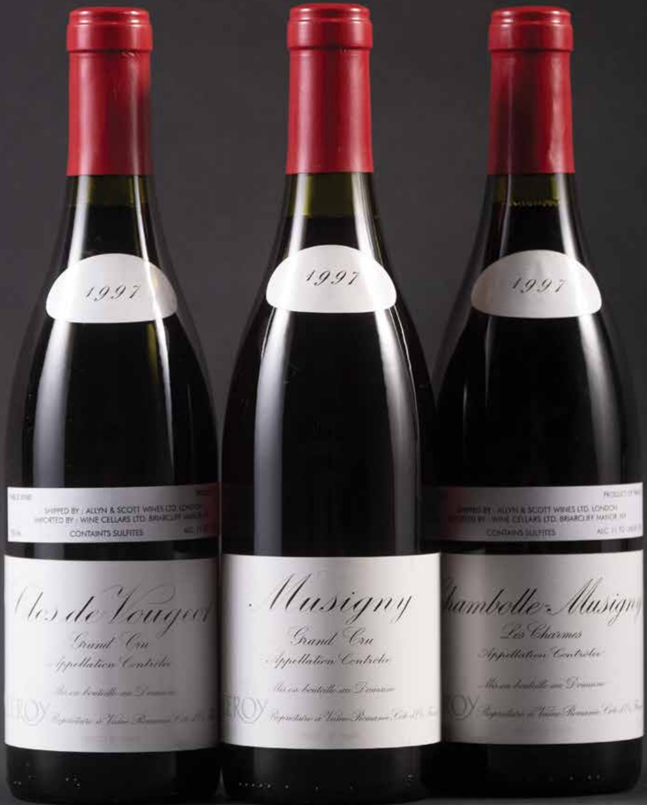
Lots 38, 42 & 43