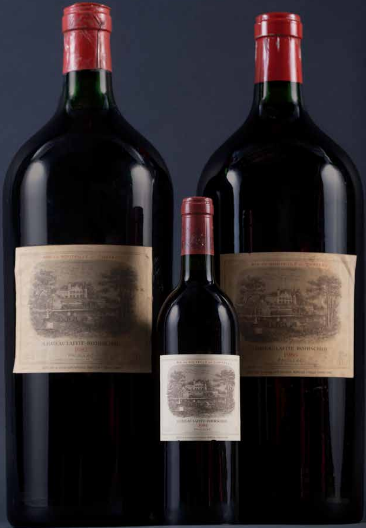
Lots 381, 433 & 435