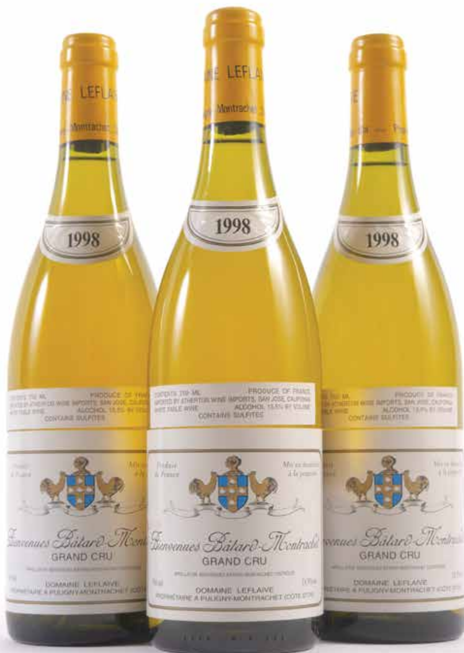
Lots 220 & 221