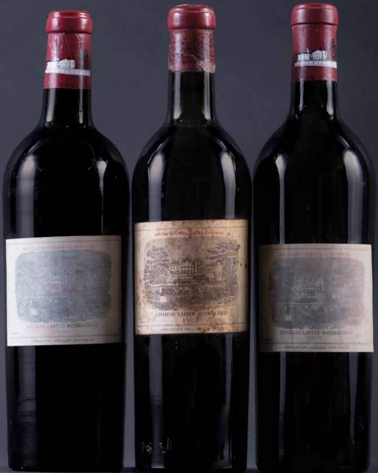
Lots 394, 396 & 399