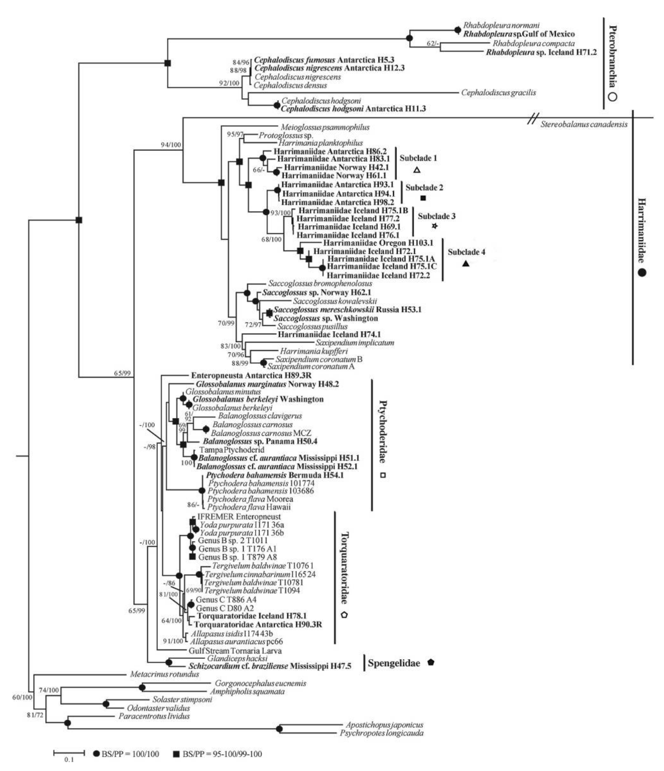
Figure 3. Combined nuclear 18S rDNA and mitochondrial 16S rDNA phylogeny. Maximum likelihood tree is shown with bootstrap values (BS) and Bayesian posterior probabilities (PP) indicated at the nodes. BS/PP values of 100/100 are indicated by filled circles, and BS/PP values of 95–100/99–100 are indicated by filled squares. BS/PP values <60/<0.80 are not shown. Maximum likelihood and Bayesian branching patterns were identical.