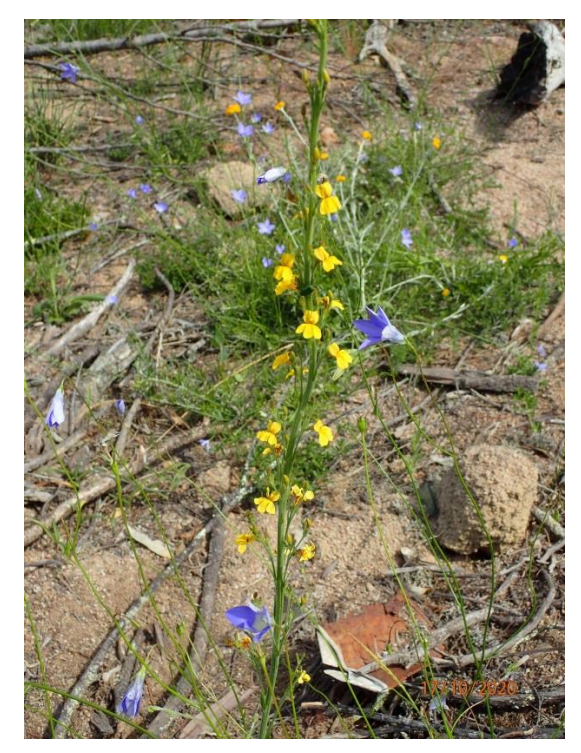
Murdannia graminea (L) and Goodenia bellidifolia (R)