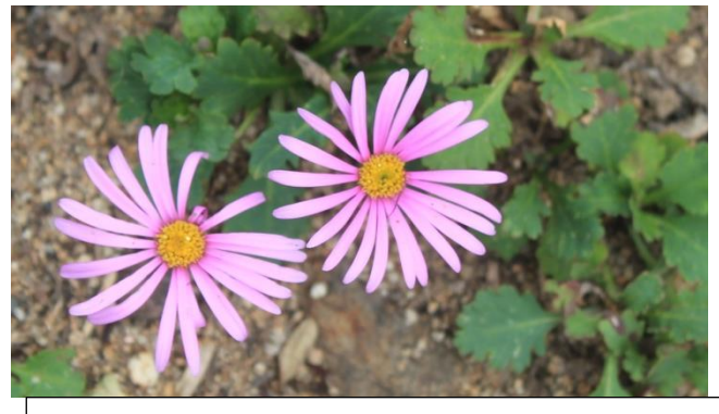
Above: Brachyscome formosa (Pilliga Posy) and L: Hovea lanceolata