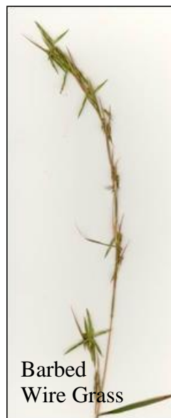
Barbed Wire Grass