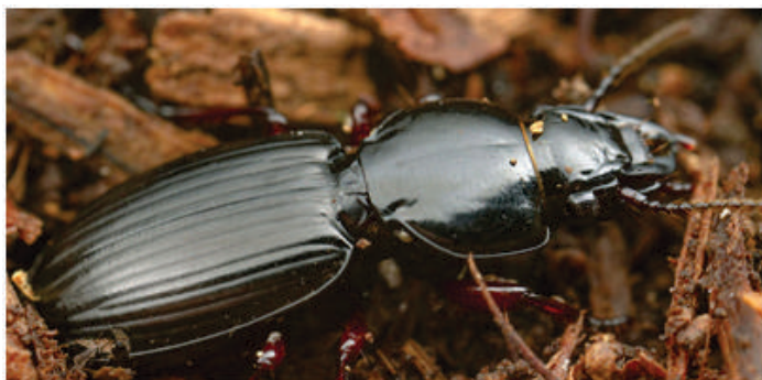
The predatory beetle Eurylychnus blagrovei . Nick Porch.