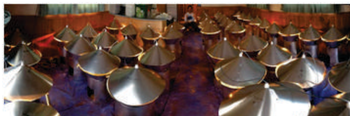
We used Tullgren funnels to sort leaf litter from its inhabitants. Heloise Gibb.

Back in the lab, we ran the samples through Tullgren funnels, which sort leaves from creatures, then counted the macroinvertebrates. We excluded the tiny springtails and mites, which are hugely abundant mesoinvertebrates. We found every hectare of unburnt rainforest had 2.5 million litter macroinvertebrates, while severely burnt forests had a quarter as many.