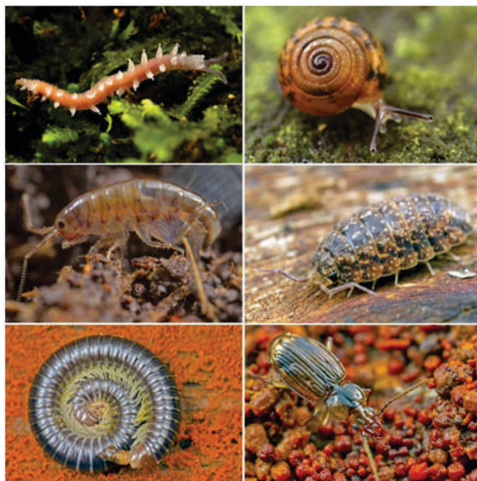
Common macroinvertebrates of these rainforests include velvet worms, snails, slaters, beetles, millipedes and land hoppers (clockwise from left) Nick Porch.

The fires incinerated much of the leaf litter and its inhabitants. To find out the toll on these creatures, a year after the fires we set out to collect leaf litter samples from 52 temperate rainforest sites ranging from Buchan in East Gippsland, Victoria, to Nowra in New South Wales, across the lands of the Kurnai, Bidawal and Yuin people. Then we compared sites subject to medium and high severity fires with those that had escaped the fire.