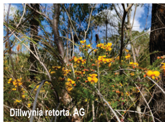
Dillwynia retorta.