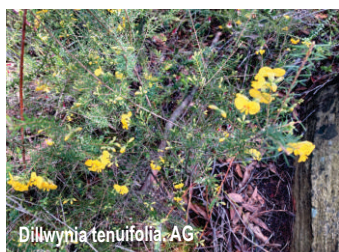
Dillwynia tenuifolia. AG

There was much discussion about the difference between Leucopogon microphyllus which only bears a few flowers at the end of its branchlets and Epacris microphylla which has flowers that extend along the upper branches between crowded sharp pointed leaves. The Epacris microphylla were very conspicuous throughout the walk and putting on a stunning show.