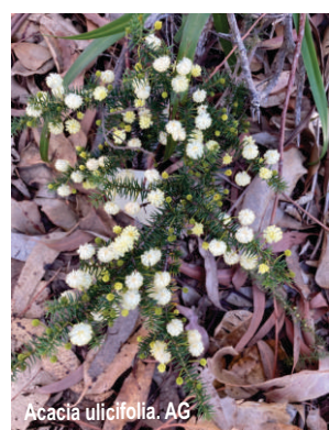
Acacia ulicifolia. AG

After our walk we enjoyed a very convivial lunch at Bubala in Allambie Heights.