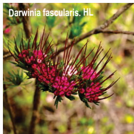
Darwinia fascicularis. HL

fascicularis , Boronia ledifolia , Dillwynia retorta and Dillwynia tenuifolia were all spotted early in the walk.