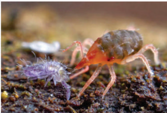
Springtails and mites are by far the most abundant invertebrates in leaf litter, with thousands in an average square metre. On the right is a predatory snout mite (Bdellidae) feeding on a purple springtail (Collembola). Nick Porch.

transplants to move vital invertebrates from healthy forests to new ones. These critters are a vital way nutrients cycle through our forests by breaking down leaves and other organic matter. Globally, they're directly responsible for converting about 40% of all leaf litter into soil. By turning over leaves or shredding them into pieces, they make it possible for microbes to help decompose organic matter. Without this work, leaf litter would begin to pile up, setting the scene for more fires.