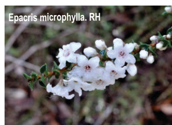
Epacris microphylla. RH

We paused at the rock platform for a group photo and to enjoy the view over Manly Dam and out to the ocean. As we moved around the rock platform and started to wend our way back, other plants identified were Woolsia pungens , Leptospermum squamulosum , Zieria laevigatum , Banksias ericifolia , serrata and oblongifolia , Grevilleas speciosa and buxifolia , Dampiera stricta , Eucalyptus paniculata , Corymbia gummifera , Bossiaea scolopendria , Acacias terminalis , ulicifolia and longifolia , Pultenaea stipularis and Lambertia formosa .