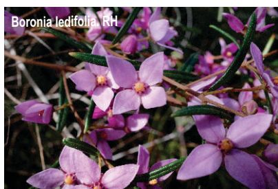
Boronia ledifolia. RH