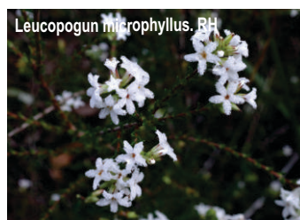
Leucopogon microphyllus. RH

There was much discussion about the difference between Leucopogon microphyllus which only bears a few flowers at the end of its branchlets and Epacris microphylla which has flowers that extend along the upper branches between crowded sharp pointed leaves. The Epacris microphylla were very conspicuous throughout the walk and putting on a stunning show.