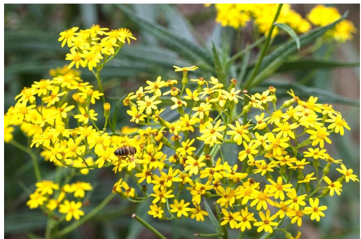
Cheery bright yellow flowers of Senecio linearifolia , captured by Daniel at Joan Lynch's garden