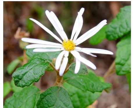
Olearia tomentosa flower, and below setting seed

On past visits there have been more flowers on display along the tracks but our group still managed to find many, small flowering plants and shrubs. There were Olearia tomentosa (a large form). These were plants along the track that were not so abundant before the fire passed through This prompted much discussion about how the seed came to be there and what were the conditions that the burning provided to enable this mass seeding.