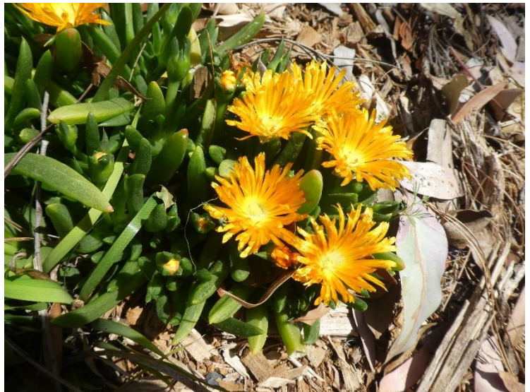
Orange flowered Carpobrotus, purchased from Mt. Annan plant shop in 2019.