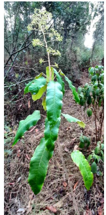
Astrotricha latifolia Mary Harrison

Polyscias sambucifolia Elderberry Panax, Ornamental Ash, Elderberry Ash can be a shrubby understorey plant or a small tree to 5m., and grows commonly on disturbed sites in wet or dry sclerophyll forest