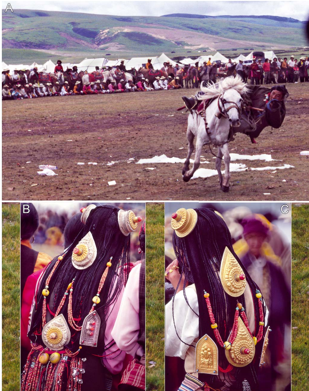
Fig. 14: Tibetan horse festival near Litang in 2000. A) Tibetan horseman trying to reach the white Khatas (tibetan ceremonial scarves which symbolize purity and good fortune) while riding his Tibetan pony. B), C) Tibetan women (most probably from the counties Nyarong or Litang) wearing their typical jewelry (golden and silver hair pieces, coral necklaces with amber and turquoise).