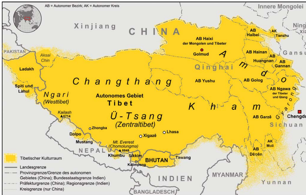
Fig. 1: Greater Tibetan region.

Qionglai Shan and the Min Shan (note: “shan” and “ling” means “mountain(s)” in Chinese). All of these are mainly north-south trending mountain chains separated by deep gorges formed by the famous rivers Irrawaddy, Salween, Mekong and Yangtze (Cháng Jiāng), and – in the very east – by the Nyag Chu (Yalong Jiang) and the Dadu He (the latter two are tributaries of the river Yangtze).