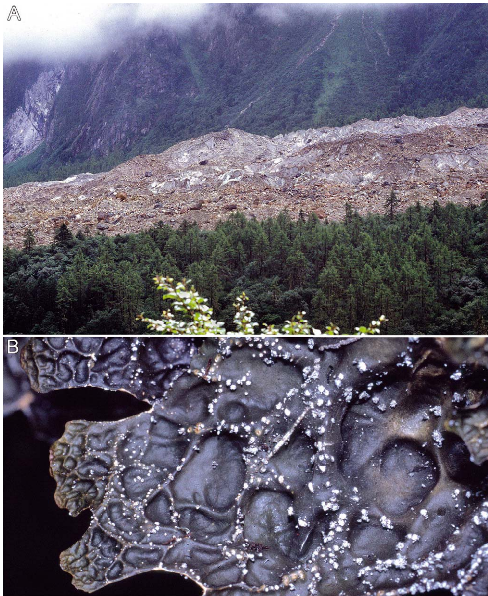
Fig. 6: A) Main glacier of the north side of the Gyala Peri (7,294 m, just north of the Great Bend of the Yarlung Tsangpo River) at about 3,700 m (c. 29°54'10"N, 94°52'40"E), at that time (in 1994) still advancing. B) Lobaria isidiosa/pseudopulmonaria lineage (wet, pictured in the field), a typical lichen of the forests along the glacier.