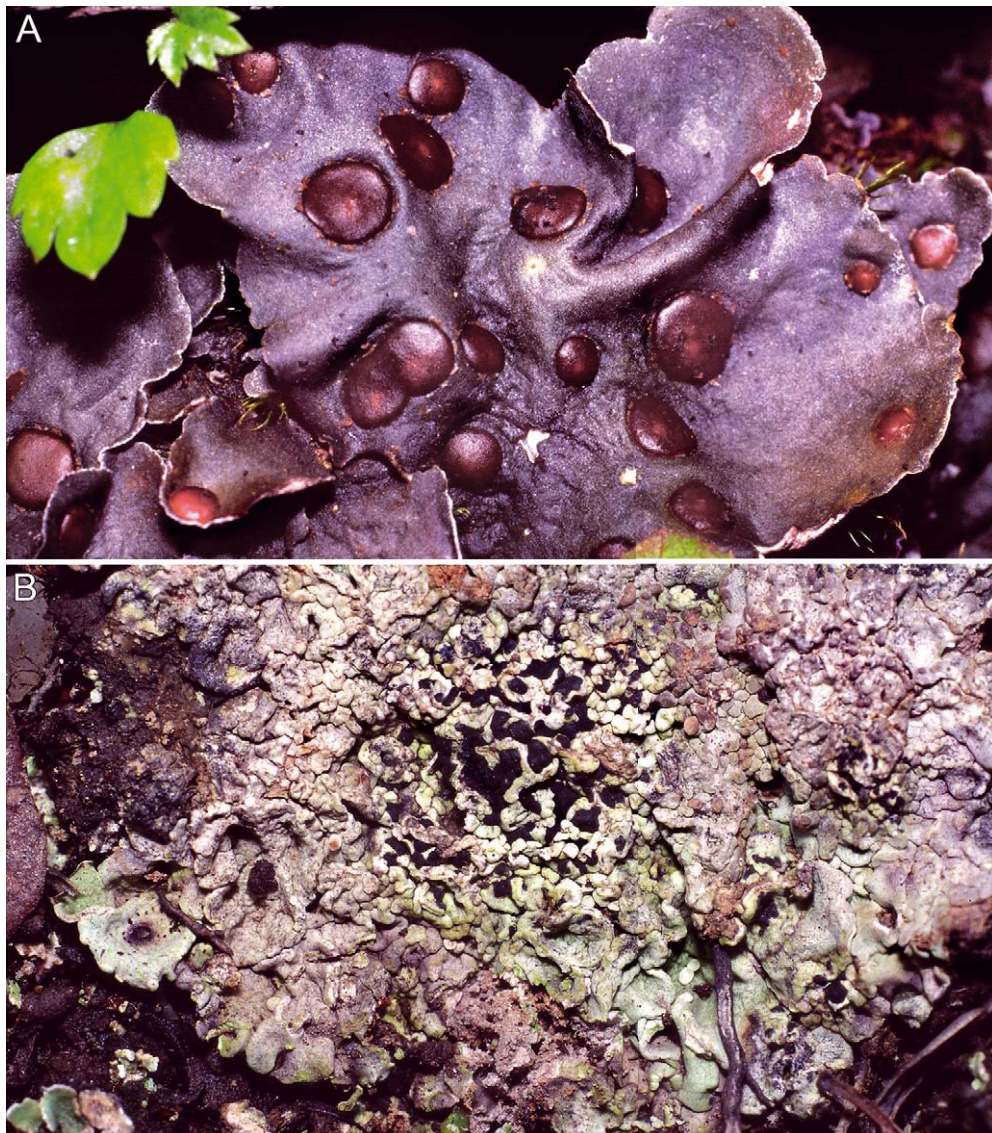
Fig. 10: Tibetan lichens (pictures taken in the field). A) Solorina simensis , similar to S. saccata , but differing by a cyanobacterial photobiont and thus bluish-brown when wet (c. 29°52'40"N, 102°20'15"E, in 2000). B) Epilichen scruposus , parasitic on Baeomyces cf. placophyllus (c. 30°18'00"N, 99°33'10"E, in 2000).