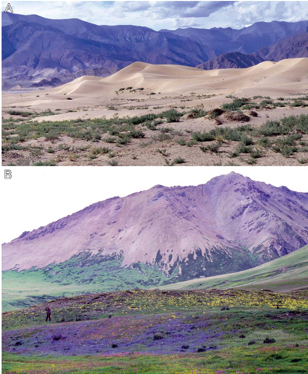
Fig. 7: A) Sand dunes in the Tsangpo valley in 1994. B) Mountain range near Litang (in 2000) with taxa of the vascular plant genera Microula (blue) and Pedicularis (yellow and reddish).