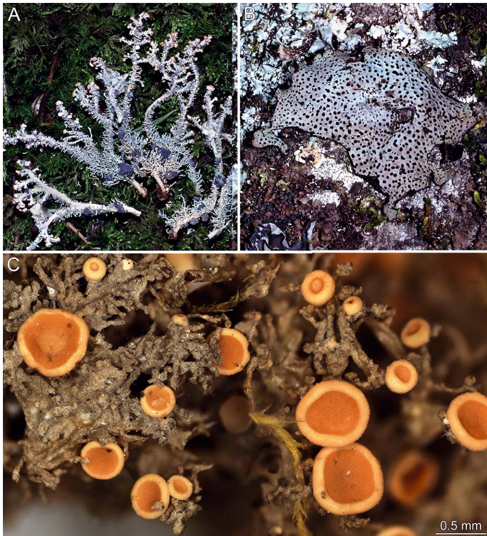
Fig. 8: Tibetan lichens (pictures taken in the field). A) Stereocaulon cf. massartianum (c. 28°57'40"N, 93°13'50"E, in 1994). B) Umbilicaria yunnana , the only epiphytic Umbilicaria (c. 30°00'30"N, 94°58'35"E, in 1994). C) Dimerella isidiata (c. 30°00'55"N, 101°51'32"E, in 2000)