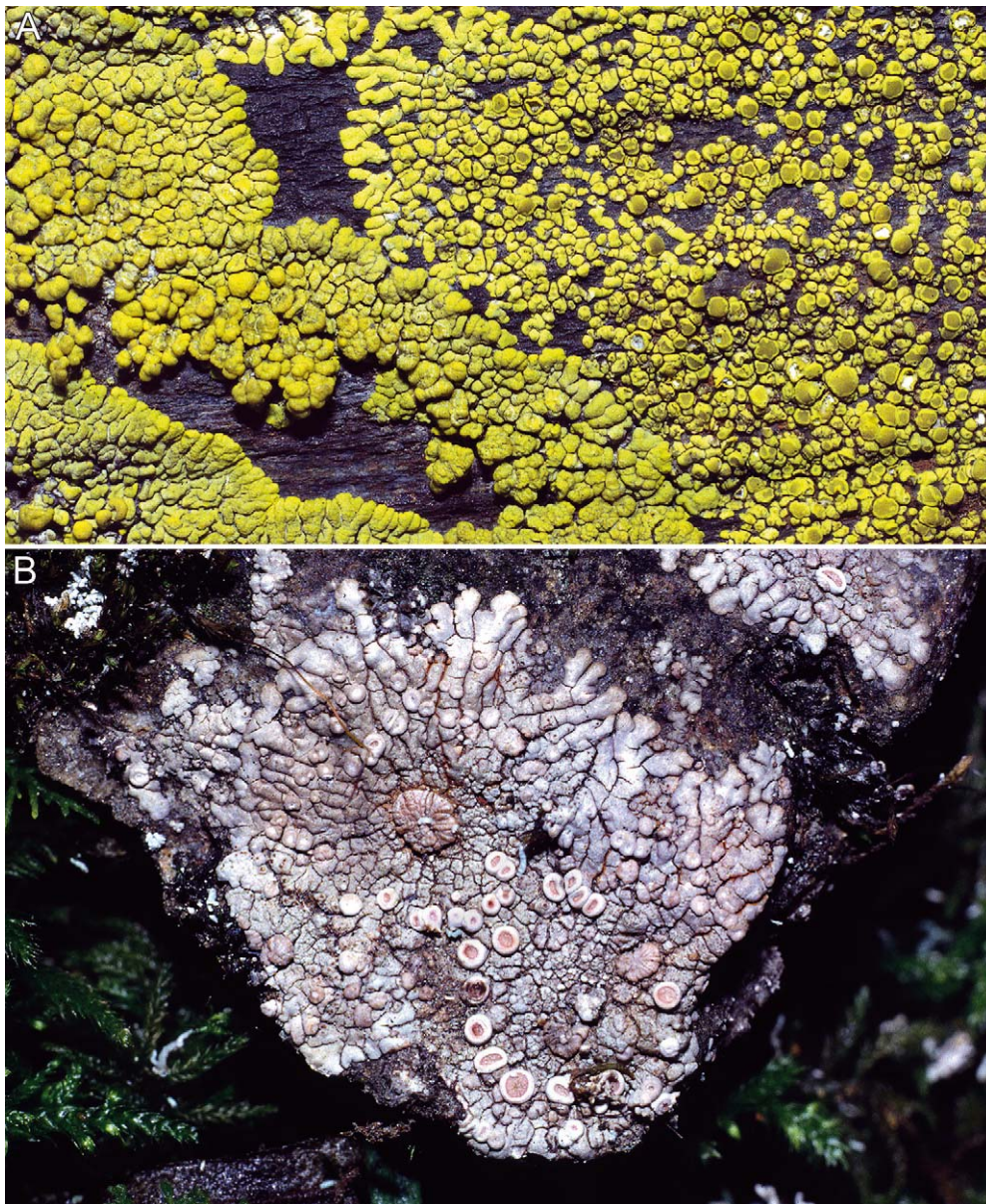
Fig. 9: Tibetan lichens (pictures taken in the field). A ) A mixture of Pleopsidium cf. flavum/discurrens (right) with flat, “marginate” apothecia and Lecanora somervellii (left), with strongly convex apothecia (c. 28°18’N, 90°57’E, in 1994). B ) Esorediate taxon of the genus Placopsis with apothecia and one big central cephalodium (smaller cephalodia are partly from some neighbouring thalli; c. 28°57’40’’N, 93°13’50’’E, in 1994).