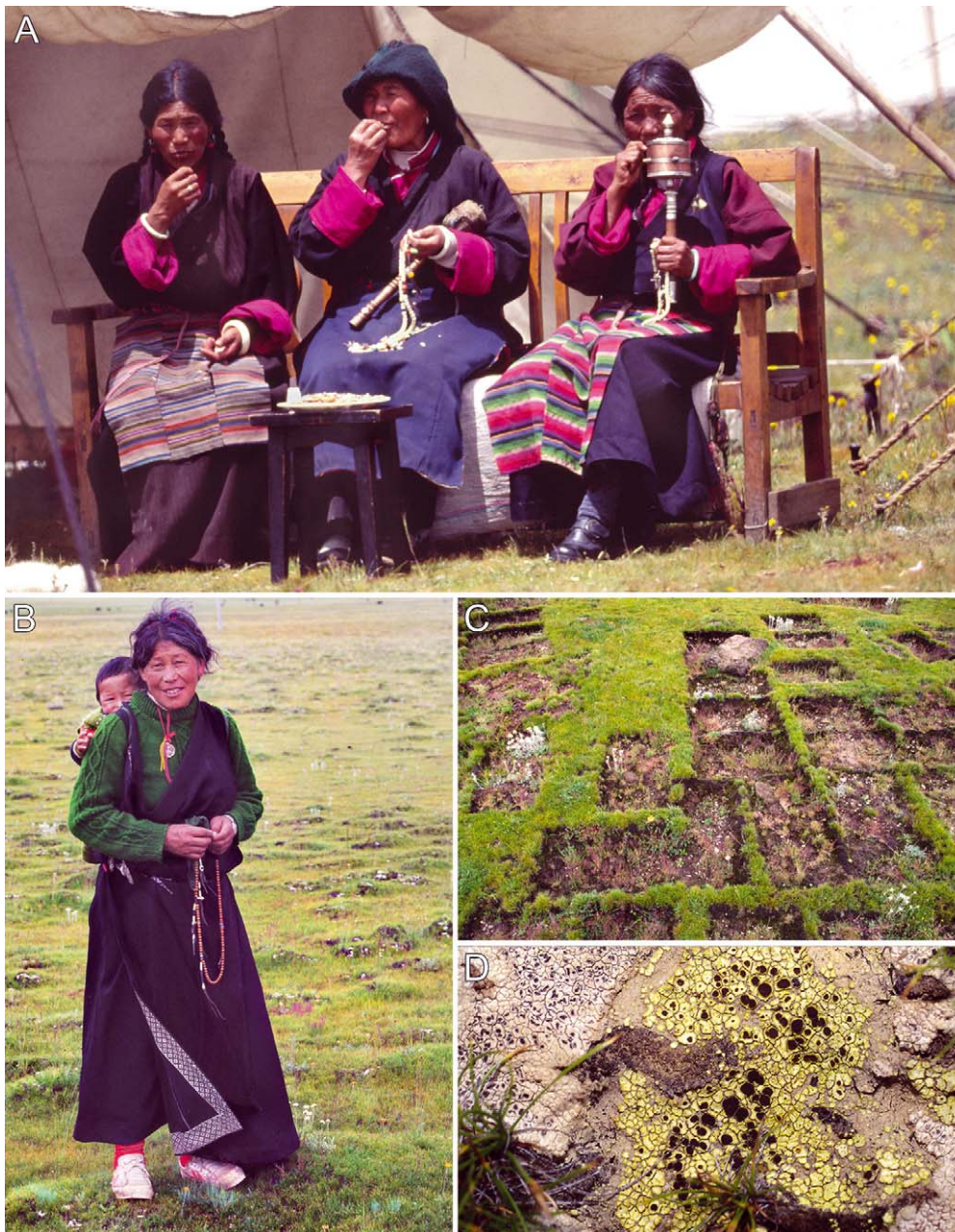
Fig. 15: A), B) Tibetan women, pictured near Litang (August 2000), using typical Buddhist prayer beads (malas, or “Tibetan rosary”) and Tibetan prayer wheels (or Mani-Chos-“Khor”). C), D) Rectangular cavities in the soil (near Litang), which are caused by the cutting out of sods, are quickly colonised by several higher plants ( Antennaria , Gentiana , Leontopodium , Microula , etc.) and crustose lichens, e.g. the pictured yellow Acarospora schleicheri (parasitic on white thalli of Diploschistes muscorum ).