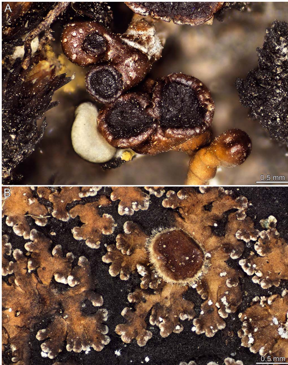
Fig. 13: Tibetan lichens (photos taken from herbarium specimens). A) Bryonora stipitata (c. 29°34'15"N, 100°18'55"E, in 2000), described by Josef POELT. The specimen shows the typical white pseudocyphellae on the thallus and on the margins of the apothecia (partly with deposit of sand grains). B) Fuscopannaria poeltii (29°03'N, 93°59'E, in 1994) described by Per Magnus JØRGENSEN in honour of Josef POELT. The specimen (determined by JØRGENSEN) is characterized by its typical white rimmed lobe tips (which are embedded in the black cottony prothallus) and the hairy base of the apothecial margin.