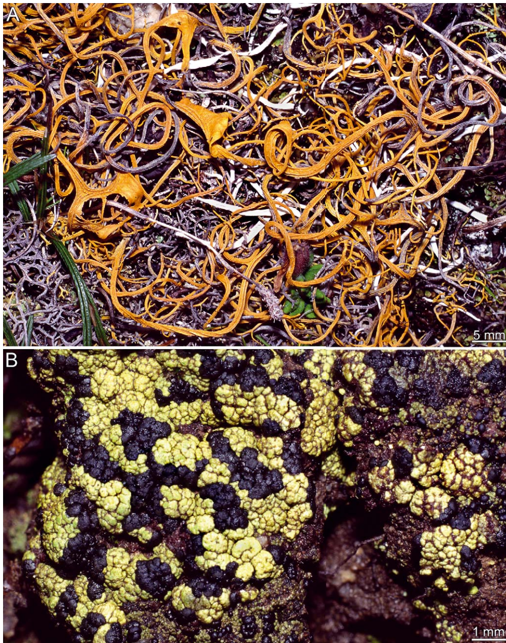
Fig. 11: Tibetan lichens (pictures taken in the field). A) Lethariella flexuosa (c. 29°34'15"N, 100°18'55"E, in 2000), showing partly flattened branches with a typically ridged surface (intermixed with the white Thamnolia vermicularis ). B) Arthrorhaphis alpina var. jungens (c. 29°34'15"N, 100°18'55"E, in 2000) always growing on compact soil.