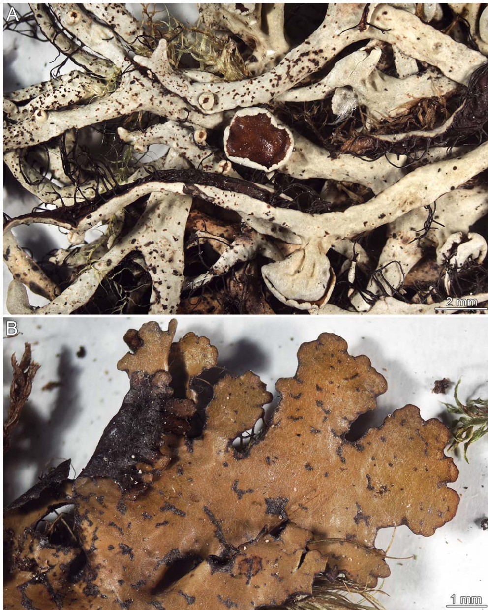
Fig. 12: Tibetan lichens (photographs from herbarium specimens. A ) Everniastrum cirrhatum , with apothecia (c. 29°34'35"N, 101°59'56"E, in 2000). B ) Emodanelia masonii (originally described by ESSLINGER and POELT as Parmelia masonii , in honour of the famous American lichenologist Mason HALE), chemotype with three fatty acids only (c. 29°03'N, 93°57'E, in 1994).