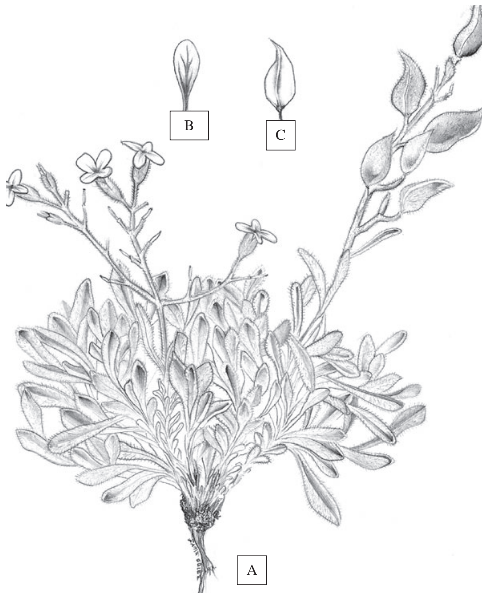
Figure 1. Physoptychis purpurascens Çelik & Akpulat.