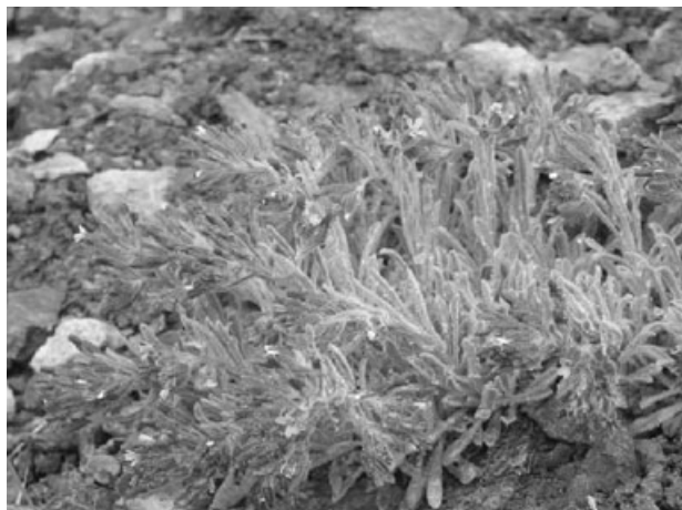
Figure 2. Physoptychis purpurascens Çelik & Akpulat.

Euphorbia denticulata Lam., Salvia multicaulis Vahl., Atrahaxis grandiflora Willd., Ziziphora capitata L., Polygonum luzuloides Jaub. & Spach, Ranunculus arvensis L., and Haplophyllum telephoides Boiss.