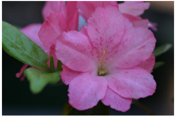
Fig. 10-'Shizu-no-mai'.