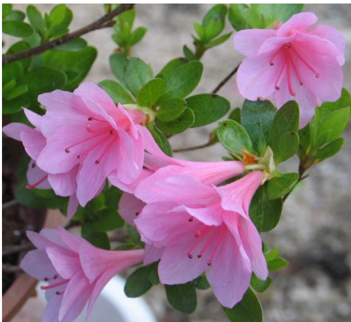
Fig. 7- 'Kirin' (syn. 'Coral Bells').