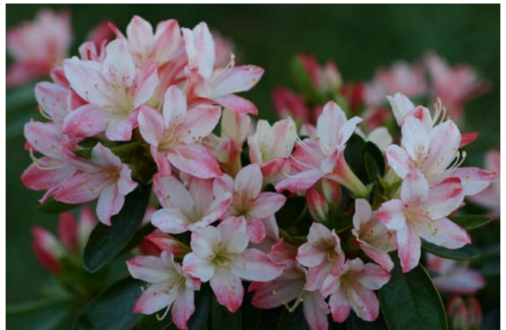
Fig. 12-'Wakaebisu'.