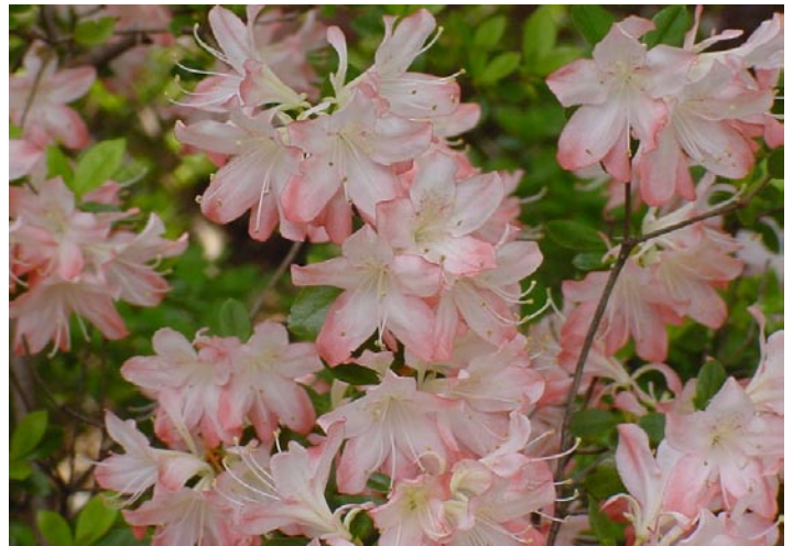
Fig. 6-'Kintaiyou'.