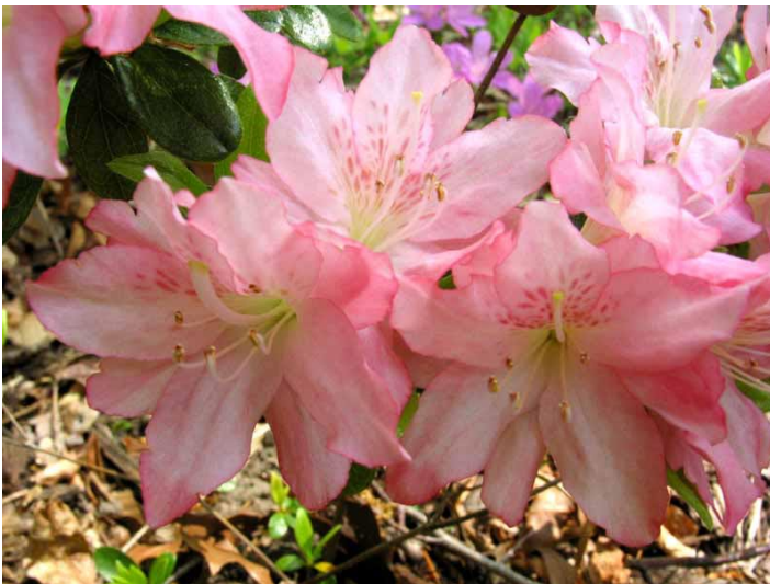
Fig. 2-Azuma Kagami (syn. 'Pink Pearl').