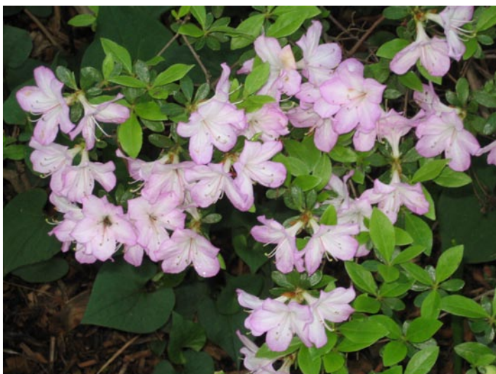
Fig. 9- 'Osaraku' (syn. 'Penelope').

ward were distorted Japanese words (e.g., “Geisha” became “Gaeshi” in his document).