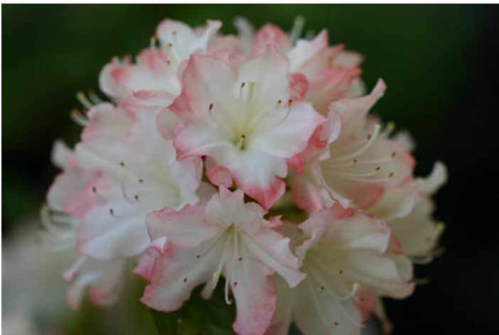
Fig. 3-'Fuji-no-asahi'.

that of R. stenopetalum and R. ripense and found that the stomatal shape these cultivars possess are from the latter species.