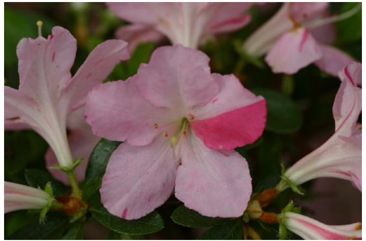
Fig. 4-'Fukuhiko'.