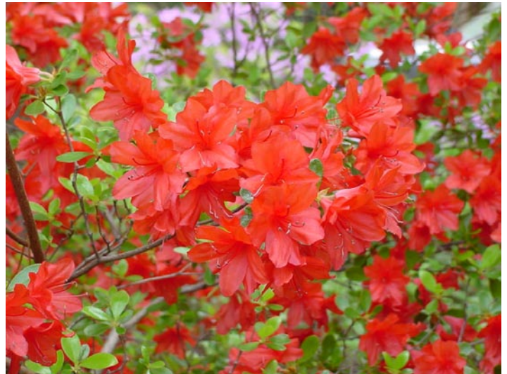
Fig. 5-'Ima Shojo' (syn. 'Christmas Cheer').