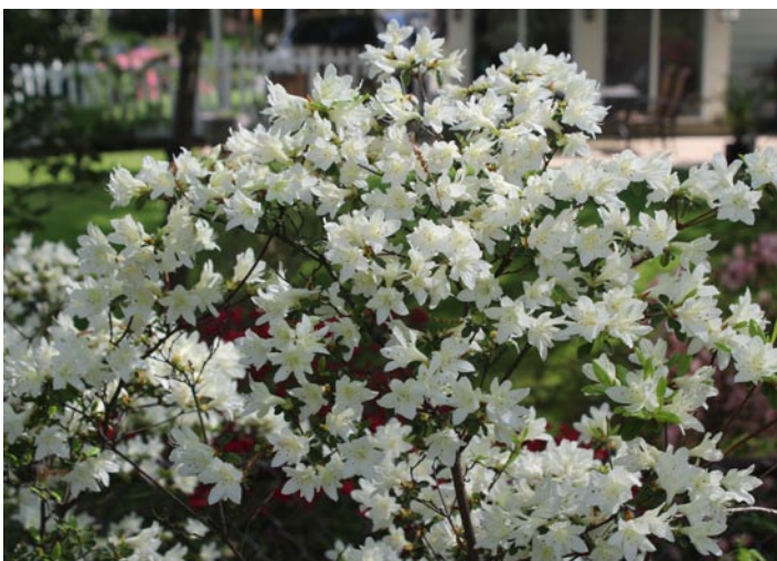
Fig. 8- 'Mizu-no-yamabuki'.