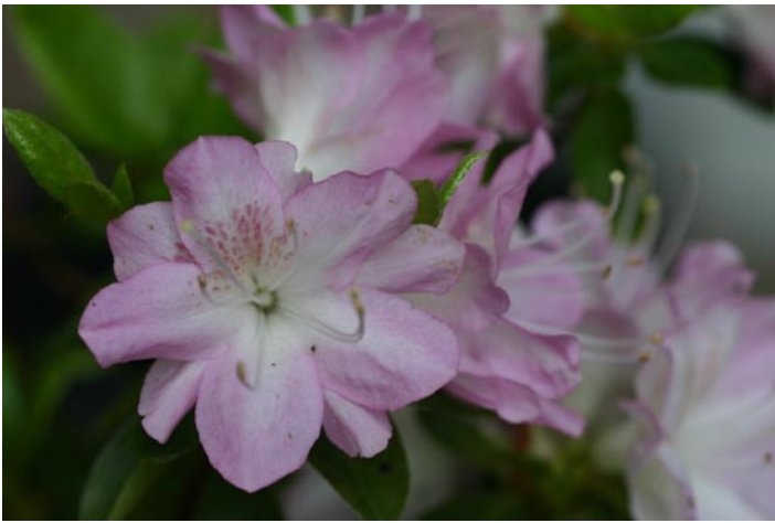
Fig. 1-'Aioi' (syn. 'Fairy Queen').