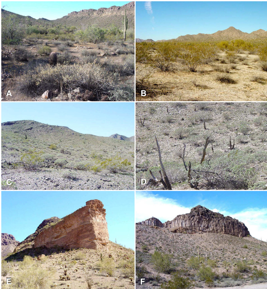
Vascular Flora of San Tan Mountains Figure 3. (A) Cobble clusters (rock pile fields) scattered along the ground are considered a typical feature of Hohokam agricultural sites - chollas, yuccas or agaves are thought to have been cultivated there; (B) The low alluvial fans south of Goldmine Mountain have areas dominated by Creosote Bush ( Larrea tridentata ) and Triangle-Leaf Bursage ( Ambrosia deltoidea ); (C) North-facing hillside slopes, burned in 1994, are now colonized almost exclusively by Brittlebush ( Encelia farinosa ); (D) Charred stumps of cacti, trees, and shrubs give an indication of pre-fire vegetation; (E-F) Dramatic, sheer walls of the Malpais Hills.