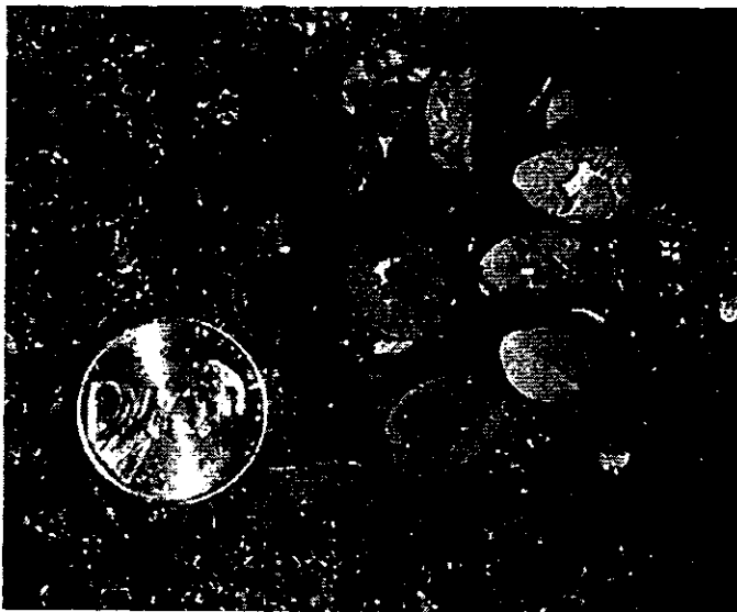
Salvinia molesta.

Another exotic species has invaded Arizona, causing alarm. The plant is a small rather attractive aquatic fern, Salvinia molesta , which has been sold in aquatic plant nurseries in Arizona and California. Unfortunately, this plant has characteristics that led the Guinness Book of World Records to label it as "world's most intransigent weed" for more than fifteen years. Water hyacinth now has that distinction, although many experts believe that salvinia is actually worse. Salvinia causes problems in Africa, India, Southeast Asia and in North America from Florida, to Texas, but has not yet been found in Sonora. It can withstand light frost. Mats have been seen floating in the lower Colorado River below the Palo Verde Irrigation District south of Parker. It seems likely that they came down the drain which carries water off the agricultural land. The 26-mile long drain is unlined and full of cattails, saltcedar, and other plants.