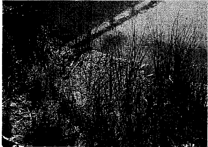
Salvinia among cattails on the Colorado River.

For more information look at the web site http://nas.er.usgs.gov/ferns/