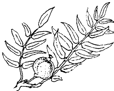
Arizona walnut leaves. Drawing by Patricia Oogjen