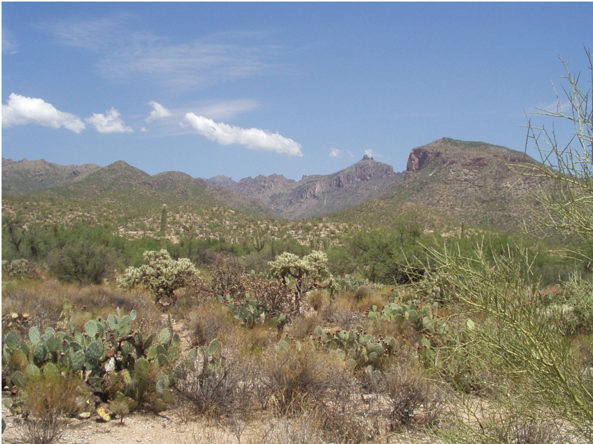
This photograph was taken looking northeast into the Santa Catalina Mountains. August 4, 2005

United States Department of Agriculture, Forest Service, General Technical Report RM-73