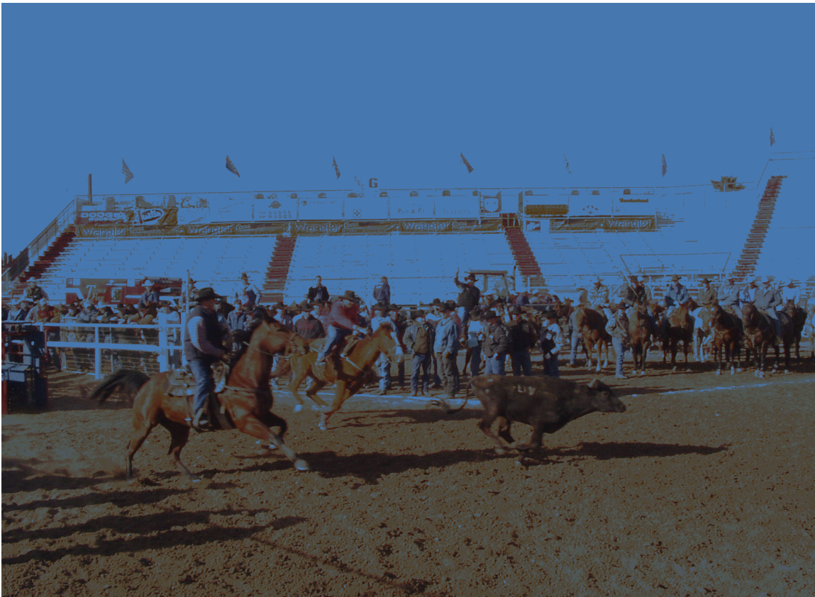
Cowboys line up for the early morning trials of the Slack Competition at the Tucson Rodeo.

Historic Mining Activities: A tungsten processing mill was operated in this township during World War II *ADS (August 30, 2006, Section A, Page 1).*