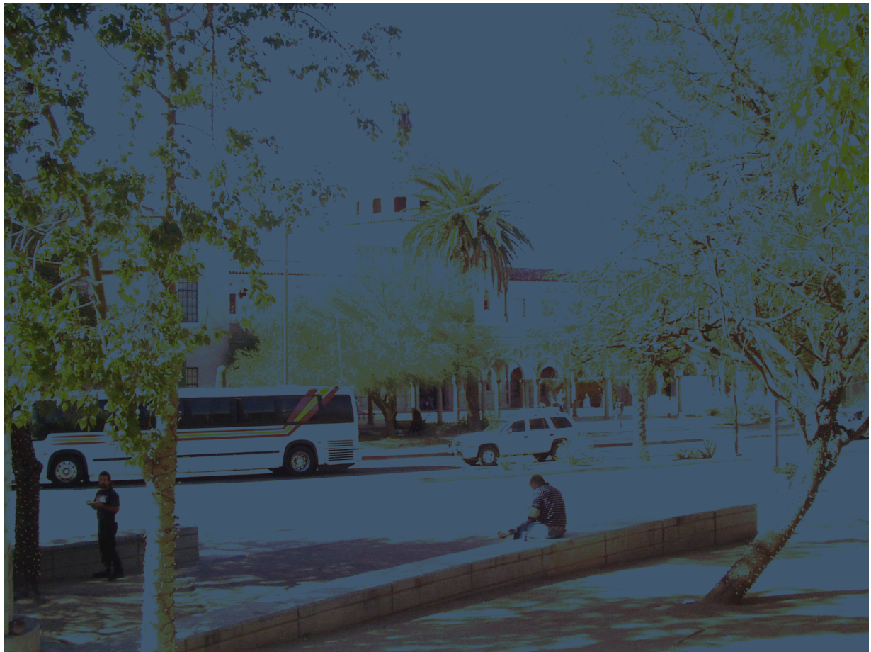
The Pima County Courthouse, Tucson, Arizona.

United States Department of Agriculture, Forest Service, General Technical Report RM-73