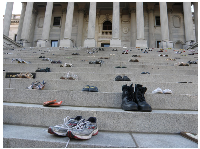
Shoes on the State House steps were a visual reminder of the thousands of people awaiting services.