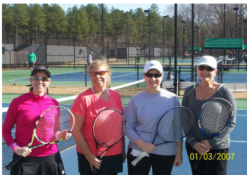
Smiling faces and camaraderie were the name of the game at the “LUV” for Babcock Tournament.