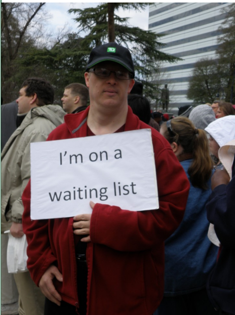
Bringing a face to the names of people on the waiting lists.