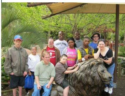
WOW! Fun at Riverbanks Zoo!

Participants in the WOW (Welcome on Weekends) program are having a great time going on outings in and around Columbia. In the past few months, they have been to the State Museum, Main Street Market, Riverfront Park and Riverbanks Zoo just to name a few.