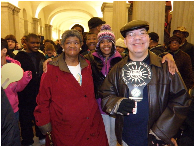
Members of BETA Group proudly displayed their signs.