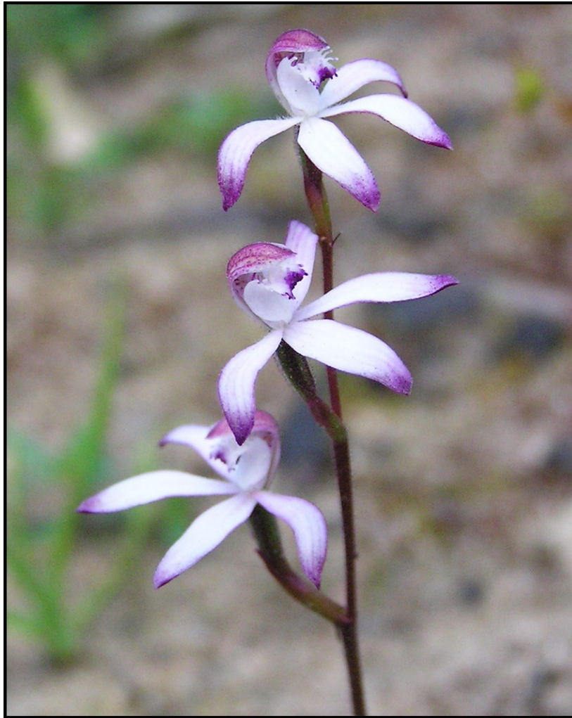
Clarke's Caladenia ( Caladenia clarkiae)