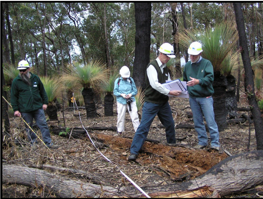
A demonstration of field monitoring in Plot 1 by DSE staff