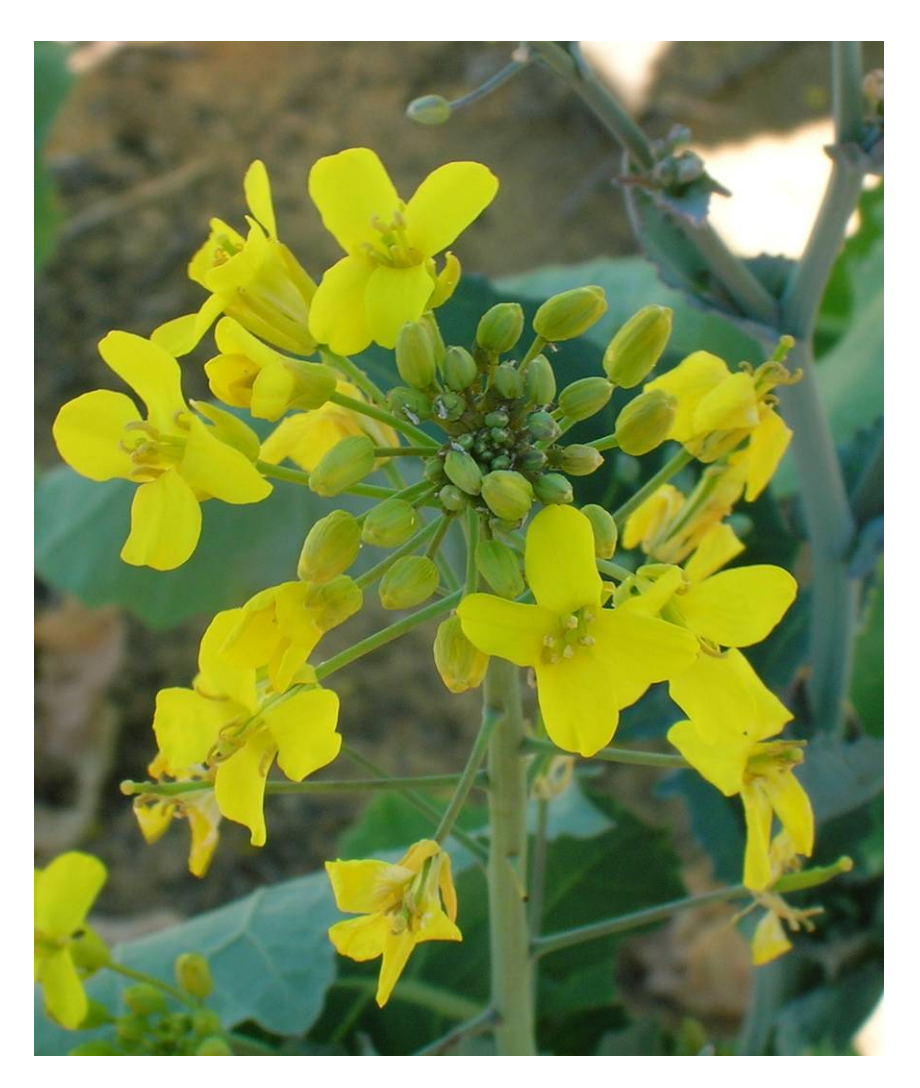
Figure 3. Flowering raceme of canola ( B. napus ). Sept 2007

and/or be insect pollinated (OECD 1997) and whose pollen can also become airborne and potentially travel at least several kilometres downwind (Treu & Emberlin 2000).