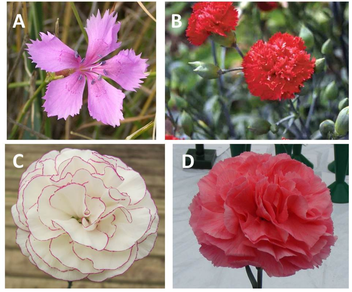
Figure 1: The main kinds of carnations. A: wild D. caryophyllus from Turkey, B: annual carnation, C: border carnation, D: perpetual flowering carnation<sup>1</sup>.

Carnations are generally diploid (2n = 30) plants (Carolin 1957). Tetraploid forms (4n = 60) have also been identified. Triploid carnations were produced for commercial purposes, but the resulting plants were mostly aneuploid (Brooks 1960). The majority of available cultivars in Australia and Europe are diploid (Galbally & Galbally 1997).