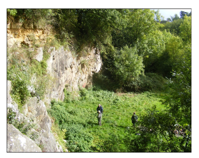
The overgrown de la Beche site needs clearance

After the success of the morning at Red Lane Abbotsbury on Sunday 18th September reported elsewhere in this issue of the newsletter (as well as the work at Tedbury Camp mentioned above) it is obvious that all it needs is a small group of volunteers to make a real difference. Wessex OUGS will be at Vallis Vale in February 2012, so if anyone has not visited the site perhaps you should try and sign up for that trip. Before then I hope a conservation session can be arranged.