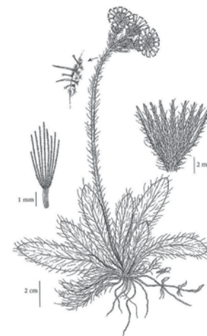
Yellow Hawkweeds © Illustrated Flora of BC

Similar Non-Native Species: In British Columbia, there are 13 different species of introduced hawkweeds, however it is easy to distinguish Hieracium aurantiacum from other Hieracium species as it produces orange flowers instead of yellow flowers.