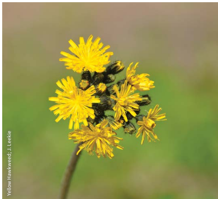
Yellow Hawkweed; J. Leekie

Application of pesticides on Crown land must be carried out following a confirmed Pest Management Plan ( Integrated Pest Management Act ) and under the supervision of a certified pesticide applicator. www.env.gov.bc.ca/epd/ipmp/