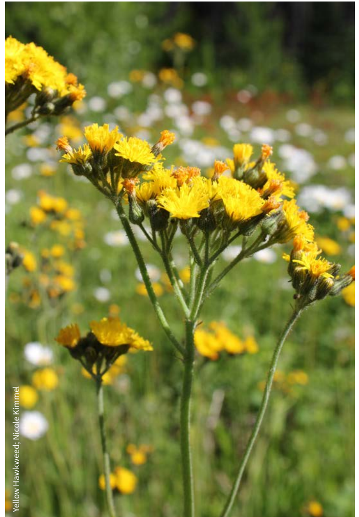
Yellow Hawkweed; Nicole Kimmel