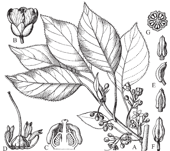
Fig. 4. Actinidiaceae. Clematoclethra lasioclada . A Flowering twig. B Flower. C Androecium and gynoecium of young flower, longitudinal section. D Androecium and gynoecium at anthesis, note inversion of anthers. E Young anthers. F Mature anther. G Ovary in cross section. (Gilg and Werdermann 1925)