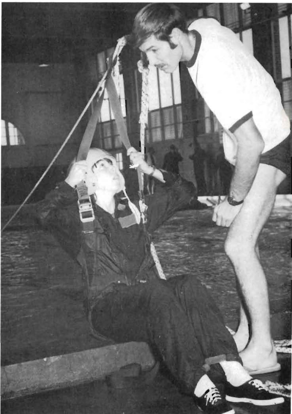
Glamorous? Not by a long shot. 7