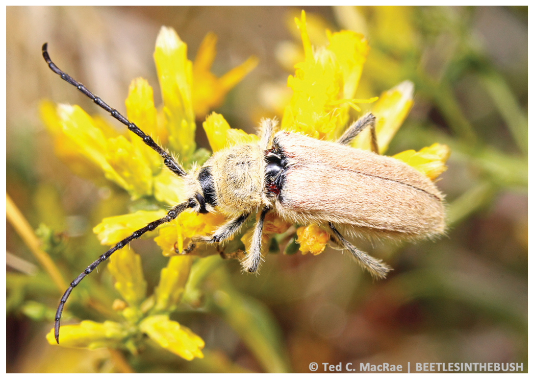
Fig. 1. Crossidius hirtipes allgewahri LeConte.