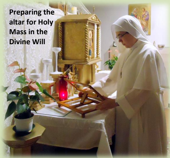
Preparing the altar for Holy Mass in the Divine Will