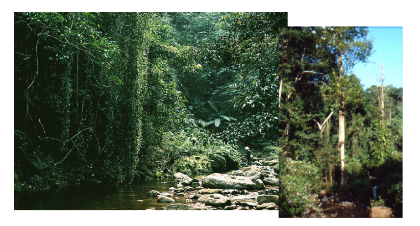
Fig. (4). Camptotheca yunnanensis occurs naturally in tropical Xishuangbanna in Yunnan, China.