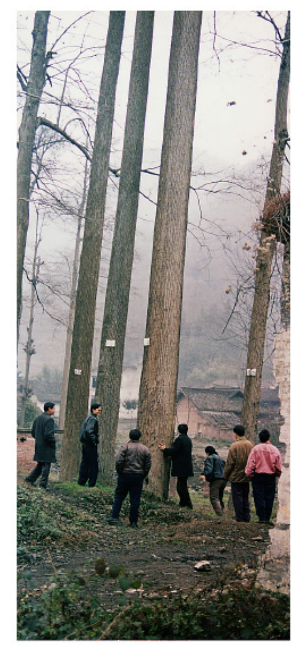
Fig. (2). Camptotheca acuminata trees planted in 1877 in Pengzhou, Sichuan, China.

According to Daming Wang, the Director of Yunnan Research Institute of Forestry (pers. comm. 1995), there are an estimated 2 million mature cultivated C. acuminata in Yunnan Province. From these trees the annual fruit production reaches 1,000,000 kg (dry weight). Adaptable to many soil types, some of these trees were found growing even in the limestone mountains of the region. Most of these cultivated trees originated from the seeds collected in Sichuan in the 1960s and 1970s. However, the remainder originated from native seed sources that are actually C. yunnanensis.