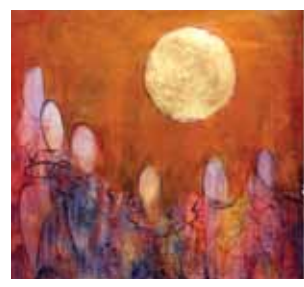
March 15-April 19 Art Exhibition: Treasures from our Collection. Over the past decade, the college has developed an extensive collection of artwork by regional and nationally known artists. This exhibition brings many of these works of art together for the first time. Reception: March 15, 6 p.m., Freyberger Gallery.