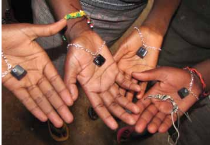
Youth from the CYEC display some of the jewelry that they created from