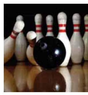
March 9 Alumni Bowling with the Nittany Lion, Cost: $5, under age 12, FREE. 7–9 p.m., Heister Lanes.