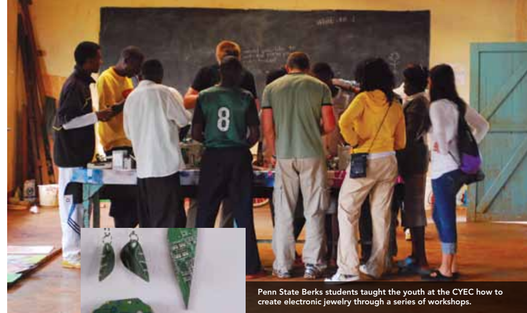
Penn State Berks students taught the youth at the CYEC how to create electronic jewelry through a series of workshops.