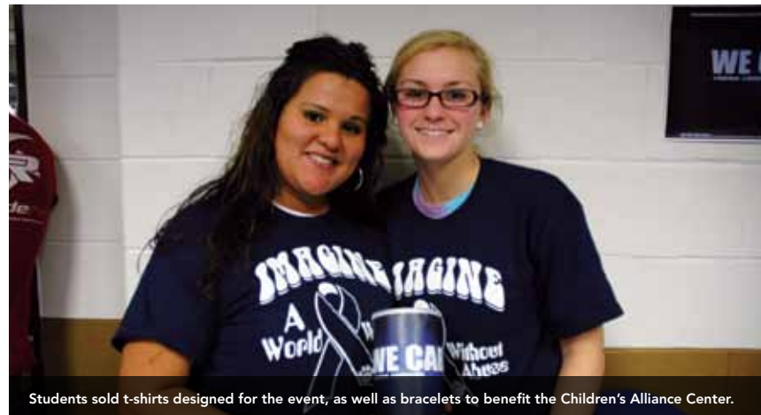
Students sold t-shirts designed for the event, as well as bracelets to benefit the Children's Alliance Center.

Hundreds of students gathered to raise awareness of child abuse during the Penn State Berks student fundraiser to benefit the Children's Alliance Center of Berks County on Wednesday, December 7, 2011, from 1:00-2:30 p.m. in the Perkins Student Center. The theme of the event was "We Care," and students demonstrated that to be true by turning out in force for the event and purchasing t-shirts and bracelets to benefit the Children's Alliance Center.