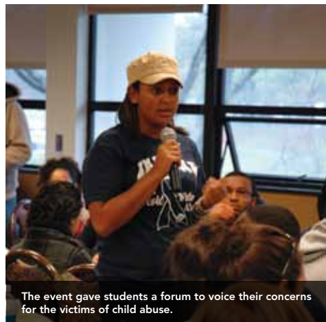
The event gave students a forum to voice their concerns for the victims of child abuse.