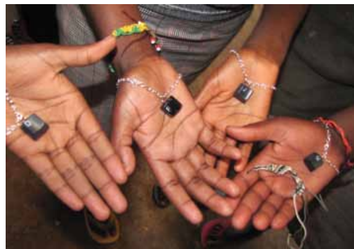
Youth from the CYEC display some of the jewelry that they created from electronic waste.