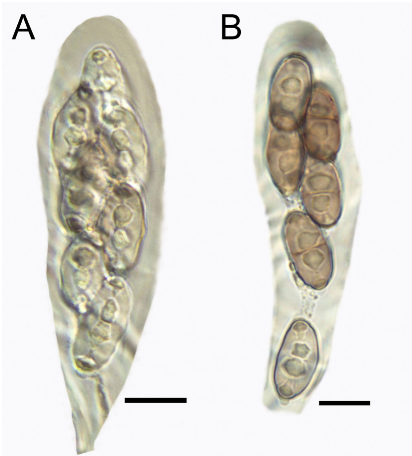
Fig. 2. Lithothelium bermudense (holotype, BM000921379).

A. Clavate ascus with young ascospores. B. Ascus with mature ascospores. Scale bars = 10 \mu m.