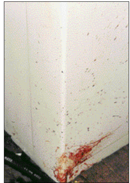
IMPACT SPATTER results when a blood source is broken up at a point (a blow to an exposed wound, for example) and the blood is forced out into the surrounding area as small circular and elliptical stains that radiate from a central point. Using mathematical analysis of stains in the pattern, bloodstain-pattern experts can define the area of origin in three-dimensional space.

Bevel noted that of all the media, video is especially prone to error, perhaps