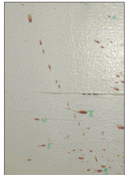
CAST-OFF PATTERNS result when an object becomes bloodied and is then put into motion. Droplets detach due to inertia throughout the movement (a swing, for example). This results in linear and curvilinear orientations. In the above photograph, the pattern moving right to left is impact spatter. The pattern moving up and down is a cast-off pattern.