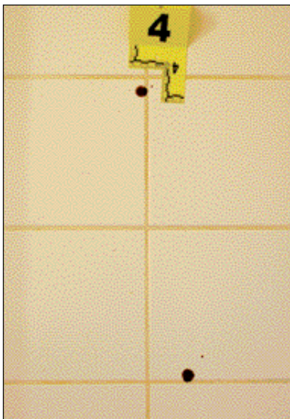
PASSIVE STAINS result when gravity is the primary force of break-up. The resulting stain sizes are much larger than those found in typical impact spatter and cast-off patterns. In this photo, the blood drops are almost circular in nature.

Proper documentation is needed to accurately work with other investigators... and proper documentation is needed when it is time to make a convincing presentation to a jury in a courtroom.