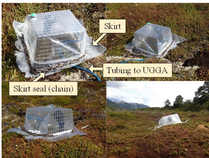
Figure S1: Photographs of the skirt-chamber under different configurations.