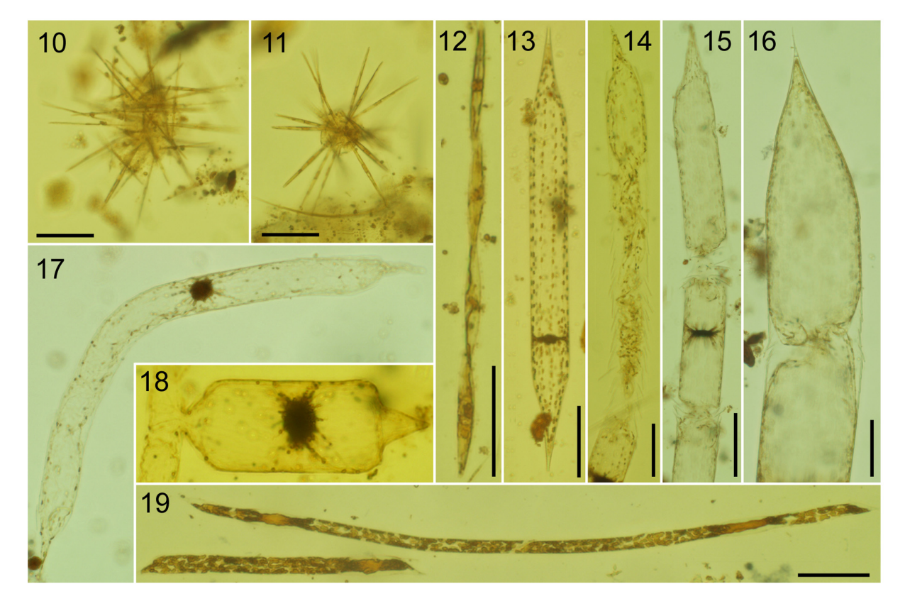
Fig. 10–19. Photomicrographs of microphytoplankton in the SE Pacific. ( 10–11 ) Clusters of Pseudo-nitzschia delicatissima , 20 m and 30 m depth. ( 12 ) Pseudo-nitzschia cf. subpacifica , 5 m depth. ( 13 ) "Normal" cell of Rhizosolenia bergonii , 60 m depth. ( 14 ) R. bergonii with fragmented frustule, 20 m depth. ( 10–14 ) 8°23′ S; 141°14′ W. ( 15 ) R. bergonii with fragmented frustule, 30 m depth. ( 16 ) Rhizosolenia acuminata , 5 m depth. ( 14–16 ) 9° S, 136°51′ W; 30 and 5 m depth. ( 17 ) Curved cells of R. bergonii (13°32′ S, 132°07′ W, 5 m depth). ( 18 ) Auxospore of R. bergonii , 33°21′ S, 78°06′ W, 5 m depth. ( 19 ) Highly pigmented cells of Rhizosolenia sp. (17°13′ S, 127°58′ W, 210 m depth). Scale bar=50 \mu m.

the phytoplankton biomass. Other common centric diatoms were Chaetoceros peruvianus (200 cells 1^{-1} near surface), Chaetoceros atlanticus var. neapolitanus , Planktoniella sol , Bacteriastrum cf. elongatum and Asteromphalus heptactis .