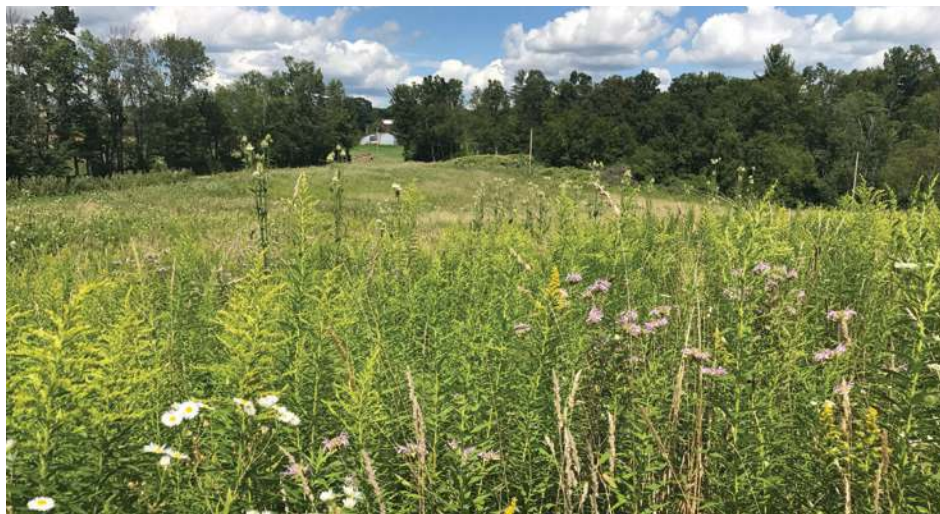
Photo below: One of Jennifer's meadows, located northwest of Scranton, Pennsylvania.

"I'm really inspired by the Preserve," says Kozlansky. "Ultimately, we'd like to do something at our farm to create a place where people can learn about native plants, too."