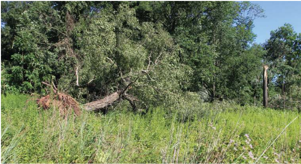
The area of Penn's Woods, at the intersection of Aquetong Road and River Road, was destroyed by a microburst in 2016.