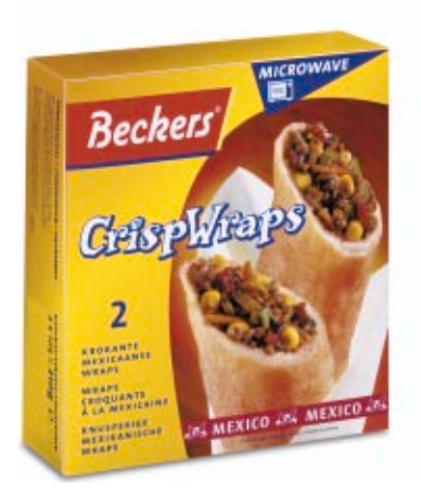
Beckers is the key brand of the Convenience Food Group