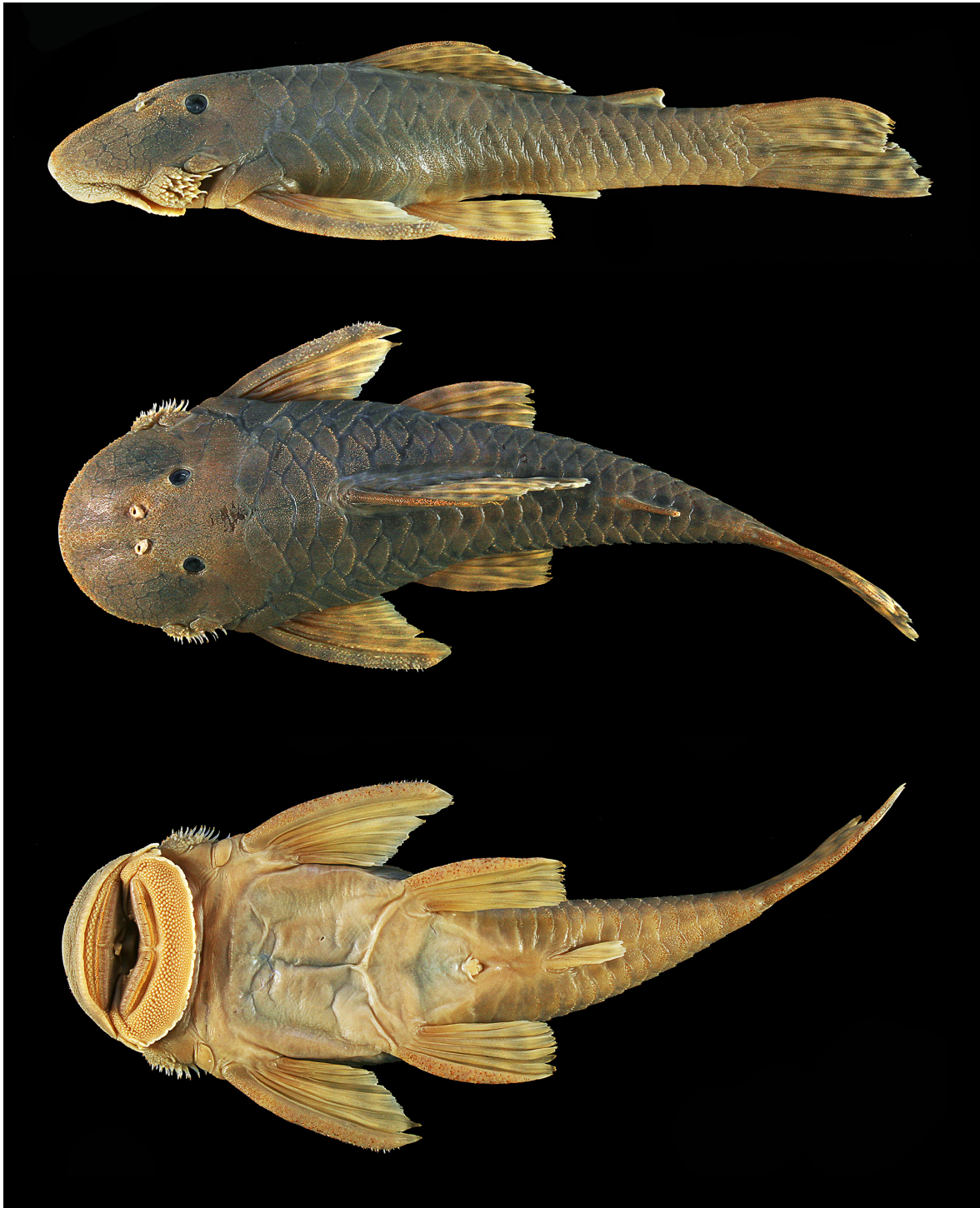
FIGURE 1. Cordylancistrus pijao , CZUT-IC 1292, holotype, 114.8 mm SL.

the dorsal and lateral sections of head and body light brown or beige with rounded or elongated dark (black) blotches, sometimes faded or barely visible, without a definite pattern while C. nephelion has the dorsal and lateral sections of the head and body blackish to greenish brown with numerous white irregular spots and C. perijae has the dorsal surface of head and body uniformly brown. It is distinguished from Andeancistrus platycephalus by the absence of spiny keels on the lateral plates of the body ( vs. lateral plates with spiny keels); from A. eschwartzae by the snout covered with bony plates, except at the tip ( vs. snout completely covered with plates), by a longer posterior body region, narrower body, and shorter dentary (postdorsal length 34.6%–39.8% SL vs. 31.3%–34.9% SL; cleithral width 30.3%–37.7% SL vs. 37.4%–40.8% SL, dentary length 8.4%–10.2% SL vs. 11.6%–12.8% SL; see Table 2); from Transancistrus santarosensis and T. aequinoctiale by the snout covered with bony plates, except at the tip ( vs. lateral edges and partial dorsal region of the snout naked).