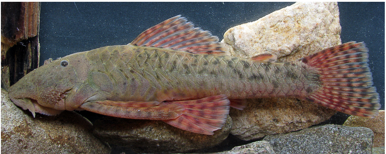
FIGURE 2. Cordylancistrus pijao . Live specimen

Geographical distribution. The localities where the specimens of Co. pijao were captured include: Cuinde Blanco River, a tributary of the Cunday River, which in turn drains to the Prado River, and the Gualí and Cucuana rivers, which drain to the Saldaña River. All localities are within the Magdalena River basin. The first location is on the western slope of the Eastern Cordillera of Colombia and the last two localities are on the eastern slope of the Cordillera Central (Figure 3).