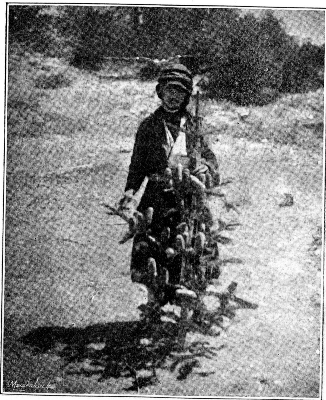
TOP OF ABIES CILICIA, SHOWING CONES.

From 5,000 to 6,500 feet grows the cedar of Lebanon. From 3,500 to 8,800 feet the sturdy Juniperus excelsa , the Lizzâb of the Arabs, defies alike the rigor of the elements and the stupid vandalism of man. It is safe to say that there is not a single perfect tree of this species in the whole of northern Lebanon and Anti-Lebanon, perhaps nowhere in Syria. Instead of cutting down a tree and splitting it up for fuel or charcoal, the