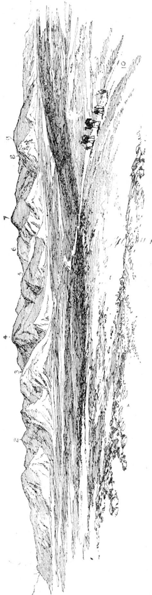
PROFILE OF THE HALAIM.

have rolled down from the mountain. On the opposite sunny slope, two