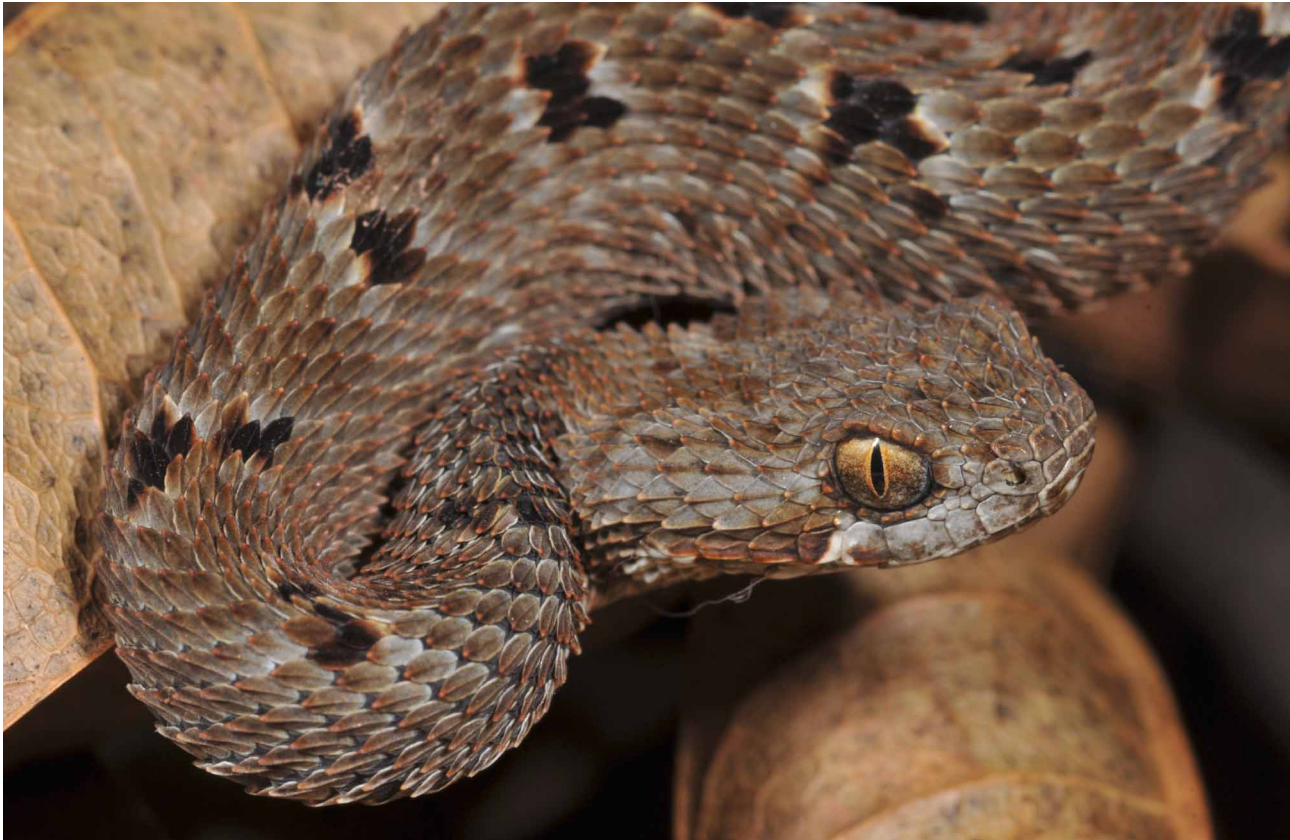
FIGURE 7. Right lateral view of head and forebody Atheris mabuensis n. sp. (PEM R17904, Mount Namuli): note reduction of gold tipped scales on head and body.

overview of the genus. The southern limit of the genus in the east is reached by A. rungweensis , recorded from northern Malawi (Misuku Forest; Loveridge, 1953) and adjacent Zambia (Broadley, 1998). In the west, A. squamigera has been recorded from northern Angola (Laurent, 1964), with a southern record provisionally assigned to the species photographed from Cangandala-Calandula (Pedro vas Pinto, pers. comm. January 2009).