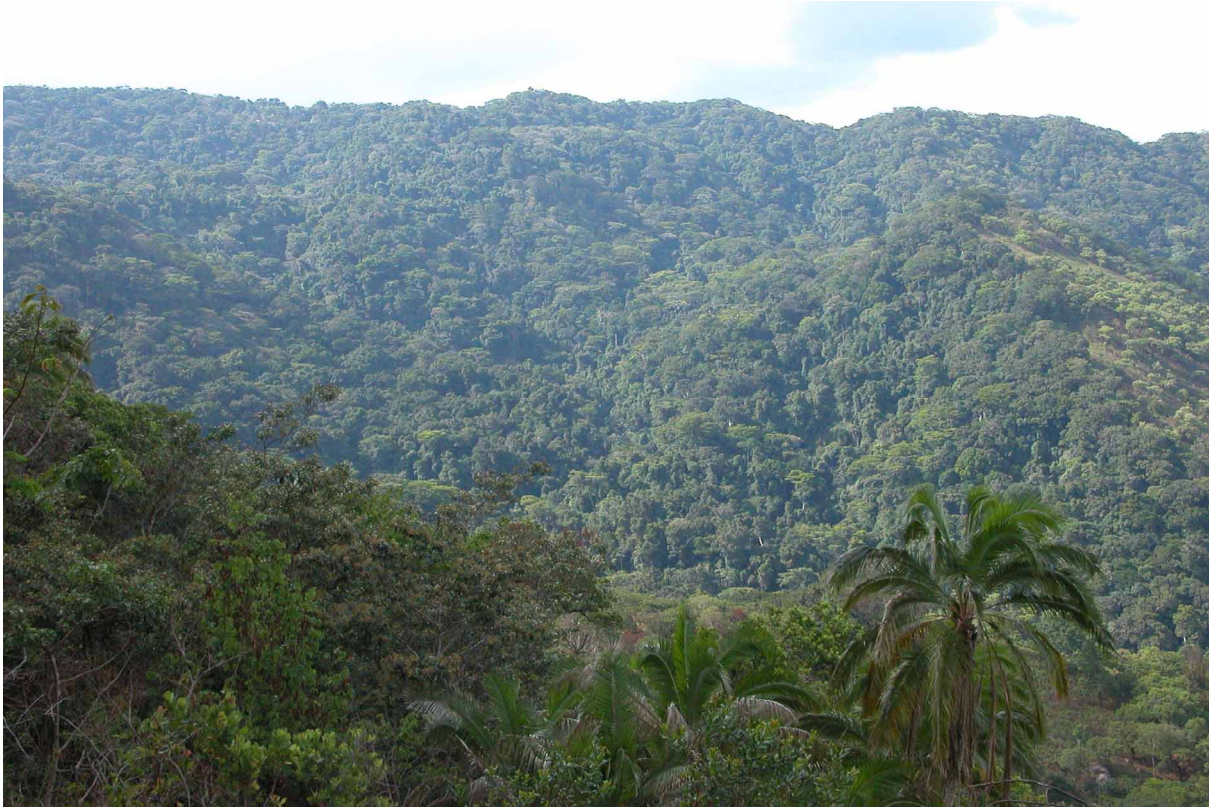
FIGURE 8. General view of closed-canopy, mid-altitude forest habitat on Mount Mabue, northern Mozambique. The central valley includes the main camp from whose surroundings the type series of Atheris mabuensis were collected.