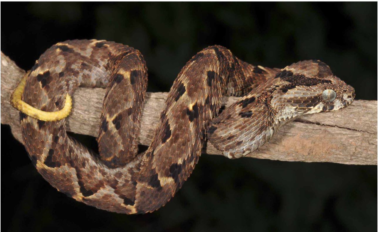
FIGURE 6. Atheris mabuensis n. sp. (PEM R17910): Top - small juvenile (<150mm TL) photographed in situ on capture (25 January 2006, Julian Bayliss); note drab colouration imparting camouflage in habitat among leaf litter on forest floor. Bottom - same specimen (photographed 19 Nov 2008, after 34 months in captivity); note retention of juvenile colouration, particularly yellow tail tip, and development of gold tips to the keels on the head and forebody scales.