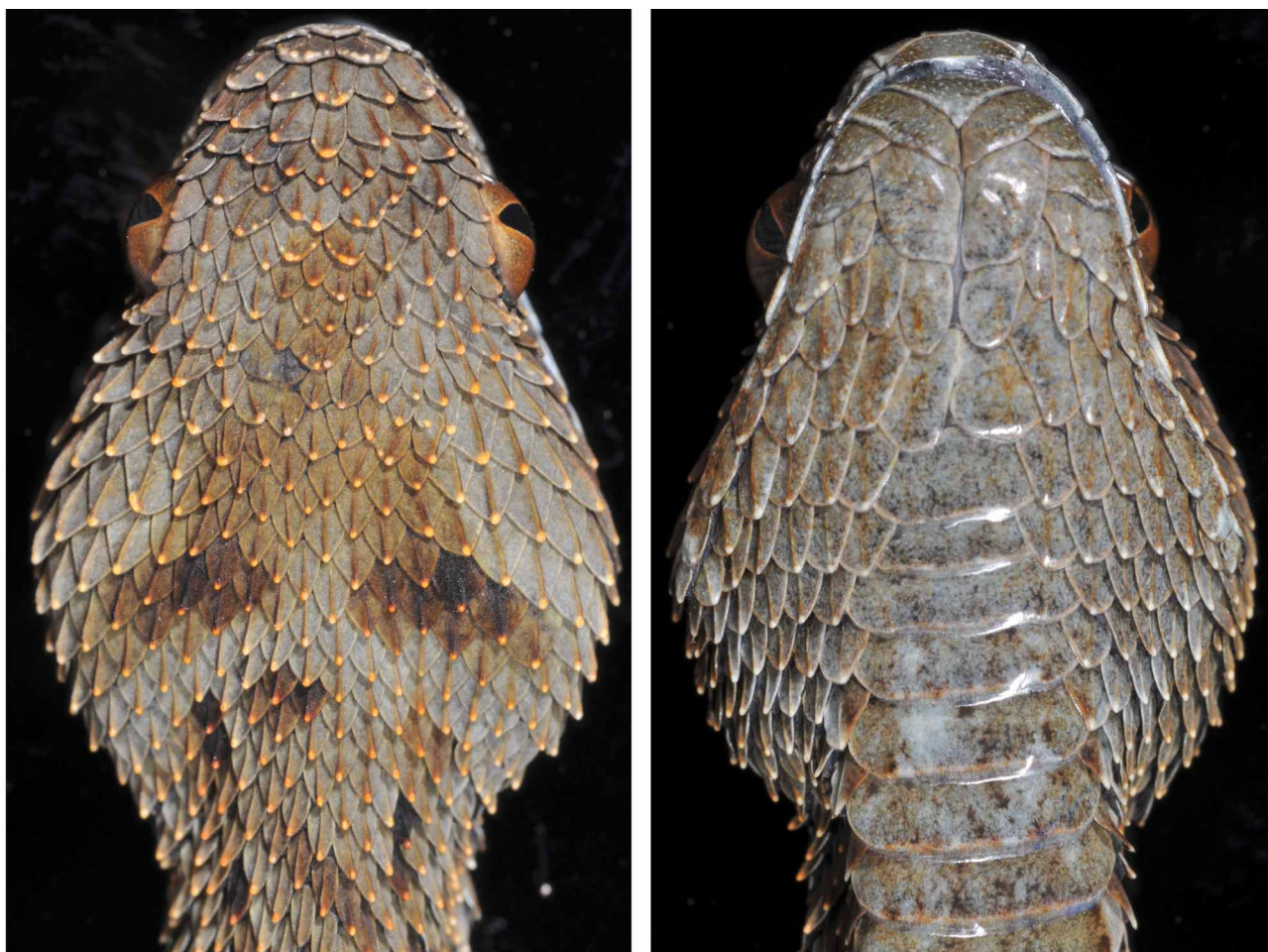
FIGURE 3. Dorsal (left) and ventral (right) views of the head of Atheris mabuensis n. sp. (Holotype PEM R17901, Mount Mabu) before fixation. Note the poorly-defined dark V-patch on crown of head

Hemipenis: Both hemipenes have only partially everted, despite the rector muscles having been cut through a small lateral incision in subcaudals 13–17; the basal portion of the hemipenis reveals a typically divided organ with a number of basal spines on the lateral surfaces, and indications of a distal calyculate zone (this needs confirmation on fully everted hemipenes).