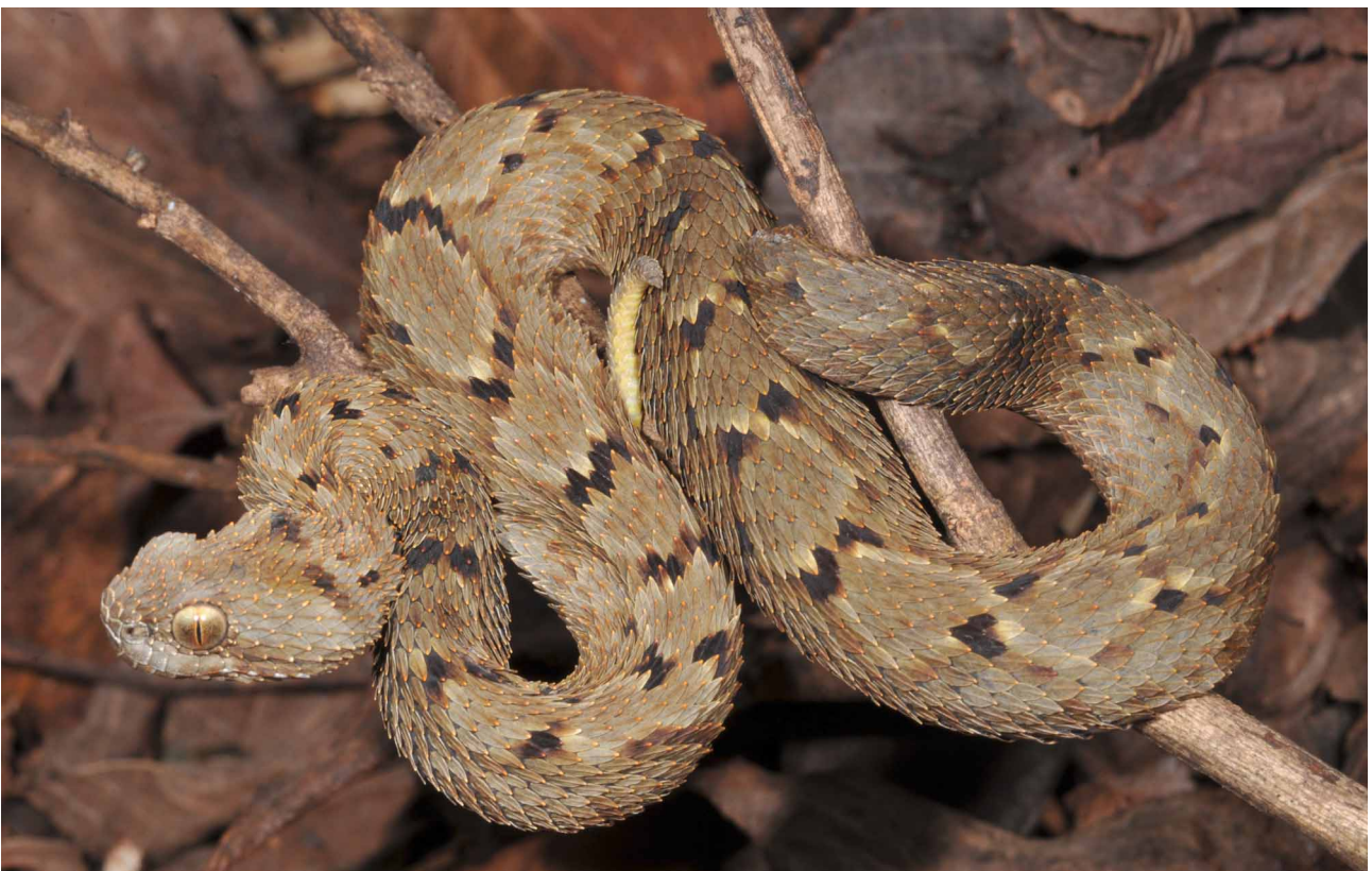
FIGURE 4. Atheris mabuensis n. sp. (Holotype PEM R17901, Mount Mabu) in life showing habitus and general colouration. Note: Retention of yellow tail tip in adult.

Distribution: Known only from the type locality, Mount Mabu, and adjacent Mount Namuli, both montane isolates in northern Mozambique.