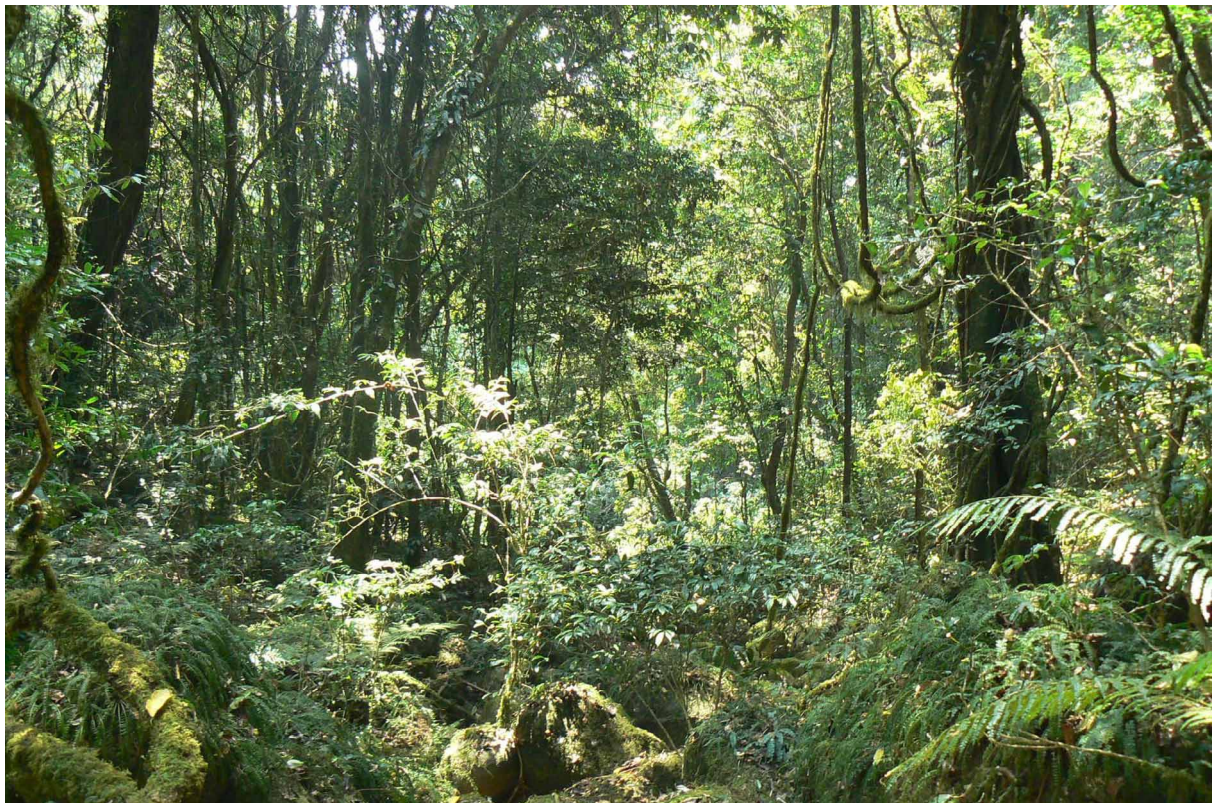
FIGURE 9. Closed-canopy forest habitat around the main camp, Mount Mabu, northern Mozambique. The type series of Atheris mabuensis was collected in leaf litter on the forest floor.