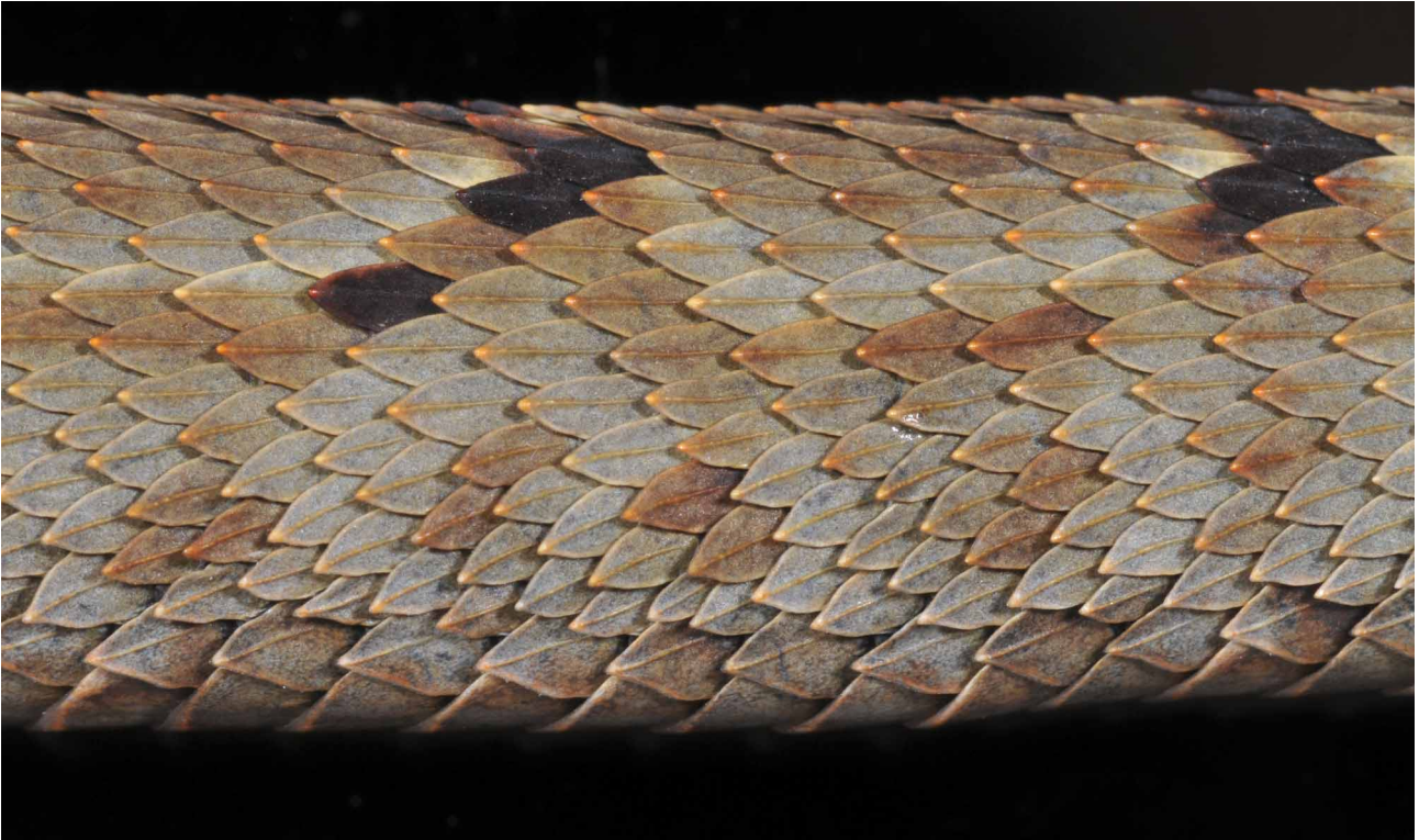
FIGURE 5. Midbody, right lateral view of Atheris mabuensis n. sp. (Holotype PEM R17901 Mount Mabu): note oblique orientation of lateral scale rows 1–5, and the progressive asymmetry in the shape and lack of serrated keels on these scales.

The species was locally common within the large tract of wet forest (>1000m) on Mount Mabu, and it was only observed within leaf litter on the forest floor (Fig. 6 top). Local hunters when interviewed confirmed this habitat preference, and also noted that the species remained small, growing to not much more than 35 cm in length. This observation was supported by the growth of the first specimen, which measured approximately 150 mm TL when first captured, and grew to only 367 mm TL after over three years in captivity despite regular feeding. Local hunters also noted that bites from the species were painful but not lethal. Caution is still advised because serious envenomation has followed bites from A. chlorechis (Rödel, 1999; Top et al. , 2006) and A. squamigera (Mebs et al. , 1998), and even a death from the latter (Lanoie and Branch, 1991).