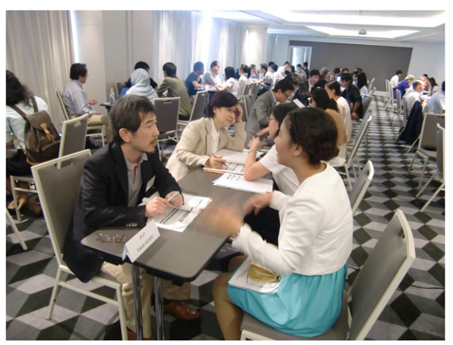
Figure 2. 36 ACBI Professors interviewing 36 Thai Students