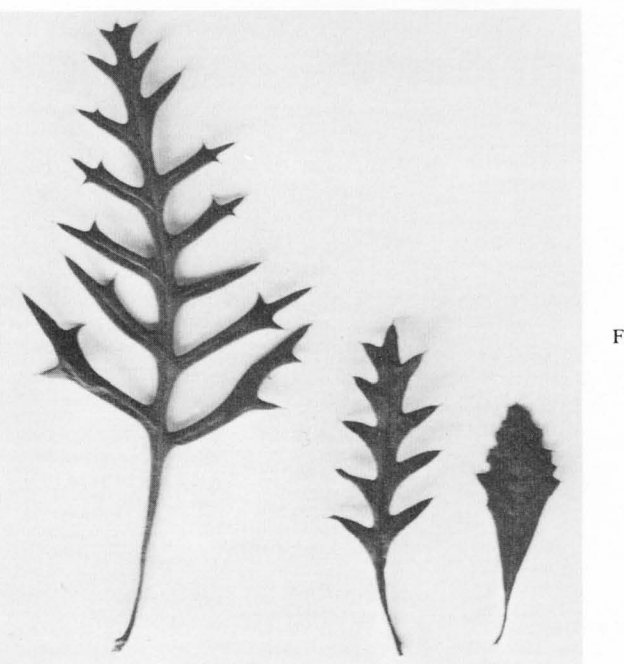
Fig. 3. Diverse leaf forms of Grevillea obtecta. Large leaf 18 cm long, cental leaf 9 cm, small leaf 6 cm.

Upper Loddon State Forest, 2.xi.1977, W.M. Molyneux & S.G. Forrester (CANB, K, MEL 665920, NSW); Glenluce Road, 5.3 km west of the junction with the Malmsbury—Daylesford Road, 28.x.1967, R.V. Smith 67/ 166 (AD, CANB, MEL 1527731); Wewak Road, c. 3.9 km by road SW. of Glenluce, 28.x.1967, R.V. Smith 67/177 (AD, CANB, K, MEL 1527729 and 730, MO, NSW, PERTH); Glenluce Road, c. 5 km SSW. of Glenluce, 1.xii.1976, R.V. Smith 76/48 (AD, CBG, MEL 1527732 and 733; PERTH).