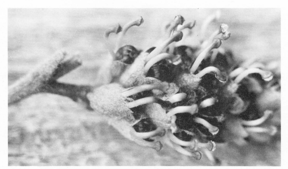
Fig. 1. Inflorescence of Grevillea obtecta, showing the villous floral bracts still firmly attached during flowering.