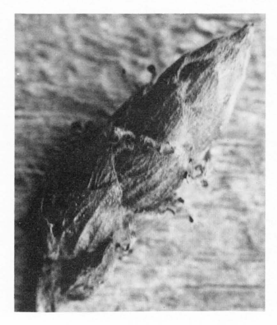
Fig. 2. Grevillea obtecta, aborted bud showing the ribbing and villous margins of the floral bracts.

Fig. 1. Inflorescence of Grevillea obtecta, showing the villous floral bracts still firmly attached during flowering.