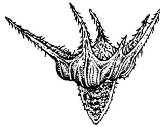
Fig. 2. Fruit of C. moorei , \times 6 (from holotype).