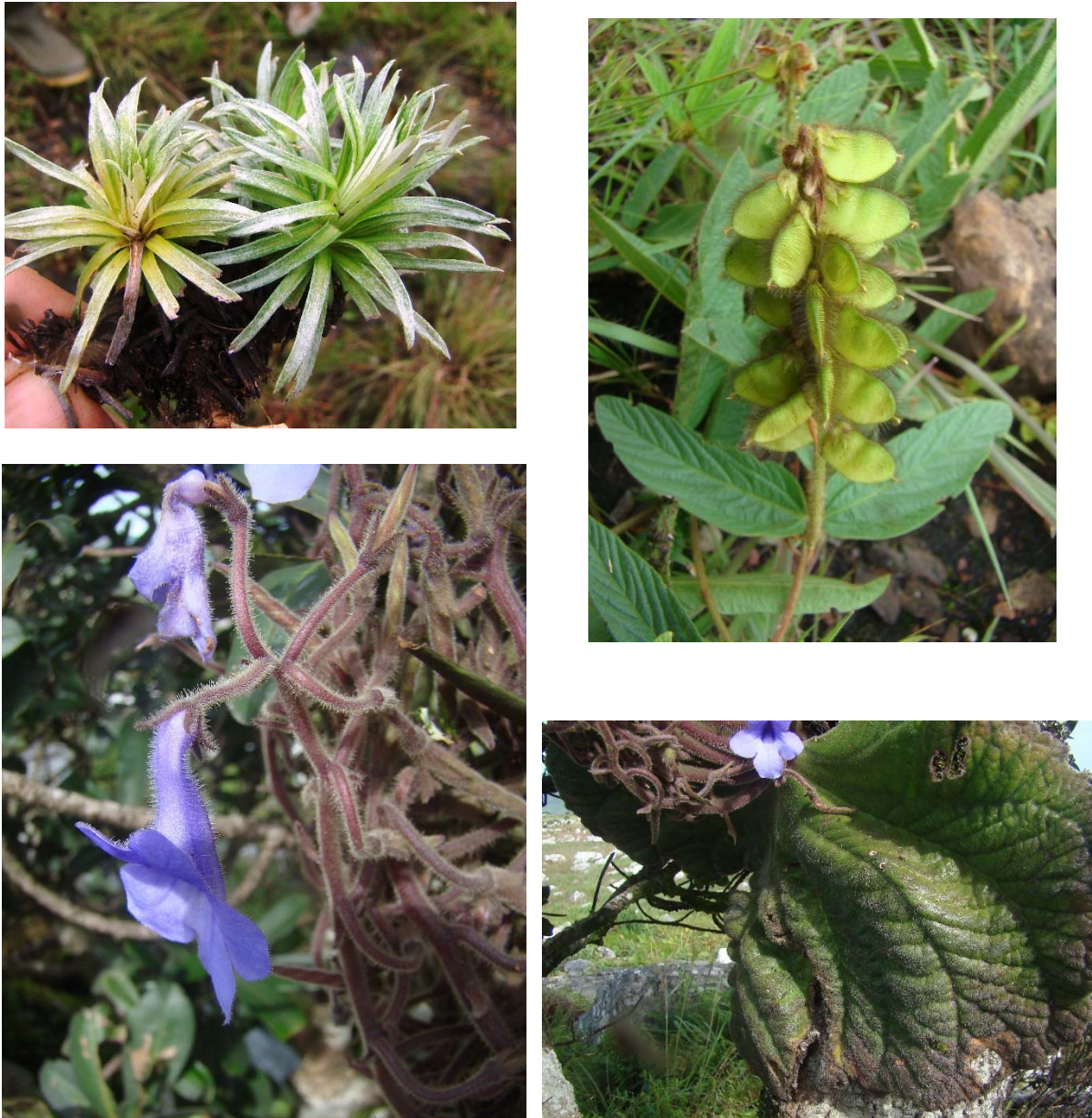
Figure 9. Further interesting species from the Mafinga Mountains [all LM]. Top L, Helichrysum tillandsiifolium ; top R, Eriosema lebrunii ; bottom, Streptocarpus sp. nov? from quartzite rock crevices at high altitude.