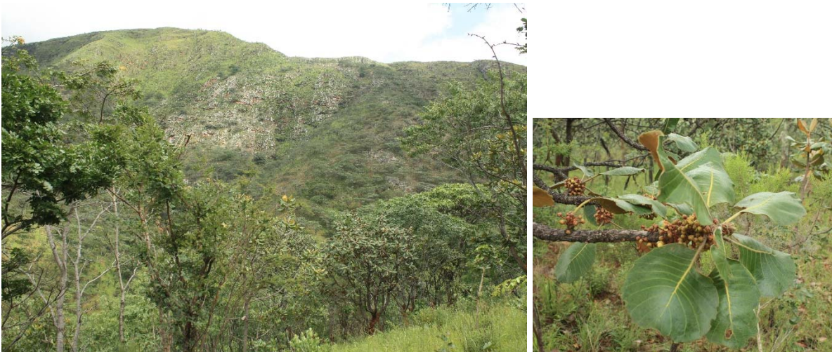
Figures 3 & 4. Miombo woodland, middle slopes of Mafingas [JT]; Uapaca robynsii [JT].

Submontane Forest: A typical 3-storey evergreen forest with canopy dominants at c.24 m, especially Parinari excelsa and Syzygium guineense subsp. afromontanum along streamsides, and Ficalhoa laurifolia , Macaranga capensis , Podocarpus milanjianus and Polyscias fulva . Smaller trees include Aphloia theiformis , Cassipourea malosana , Diospyros whyteana , Garcinia smeathmannii , G. volkensii , Olea capensis and Tricalysia pallens . Common shrubs include Chassalia cristata , Mellera nyassana , Mostuea brunonis , Peddiea fischeri and Psychotria succulenta . Climbers are Artabotrys stolzii , Landolphia buchananii , Opilia amentacea and Tiliacora funifera . The ground layer is bare or with a sparse cover of Acanthaceae or Oplismenus grass. In this area the forest is mostly secondary, occurring in gaps, the main trees being Bersama abyssinica , Neoboutonia melleri and the climbing fern Dicranopteris linearis .