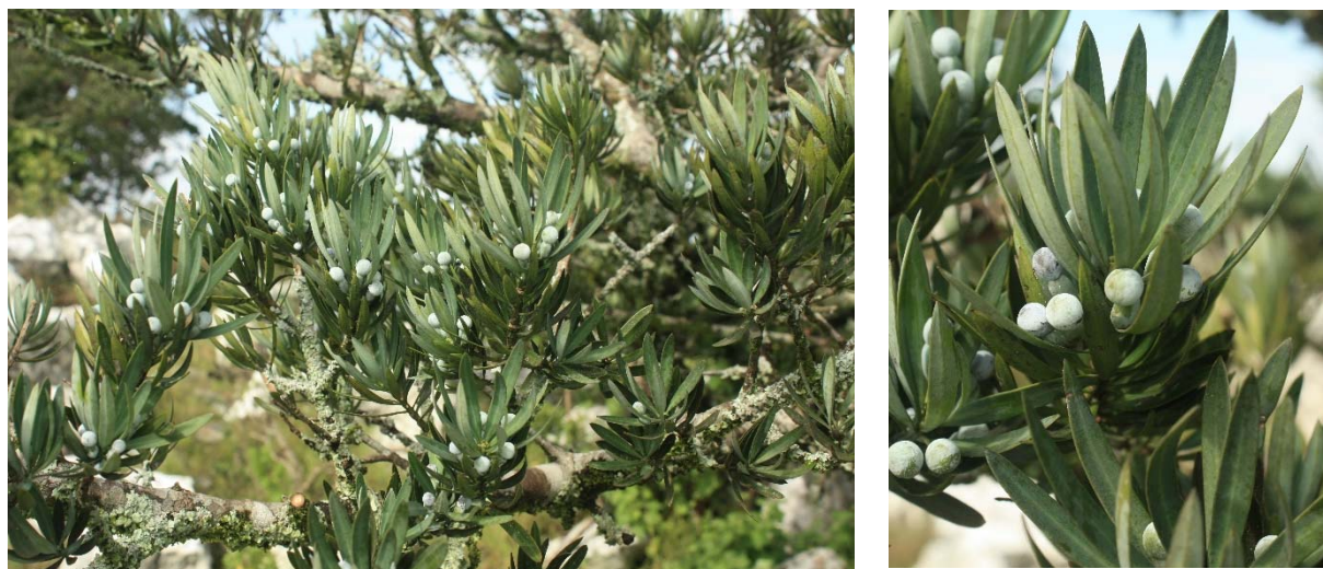
Figure 10. Podocarpus elongatus , tree and fruits, summit ridge of Mafingas [JT].

studies. Ecologically P. elongatus is a clearly separate entity from the forest P. milanjanus , although they do occur on the same mountains.