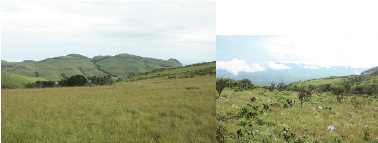
Figures 6 & 7. Upland grassland (L) and shallow quartzite outcrops on ridge.

We did not pass through any patches of evergreen or riparian forest (other than very thin fringes flanking the Insinza stream) on our ascent.