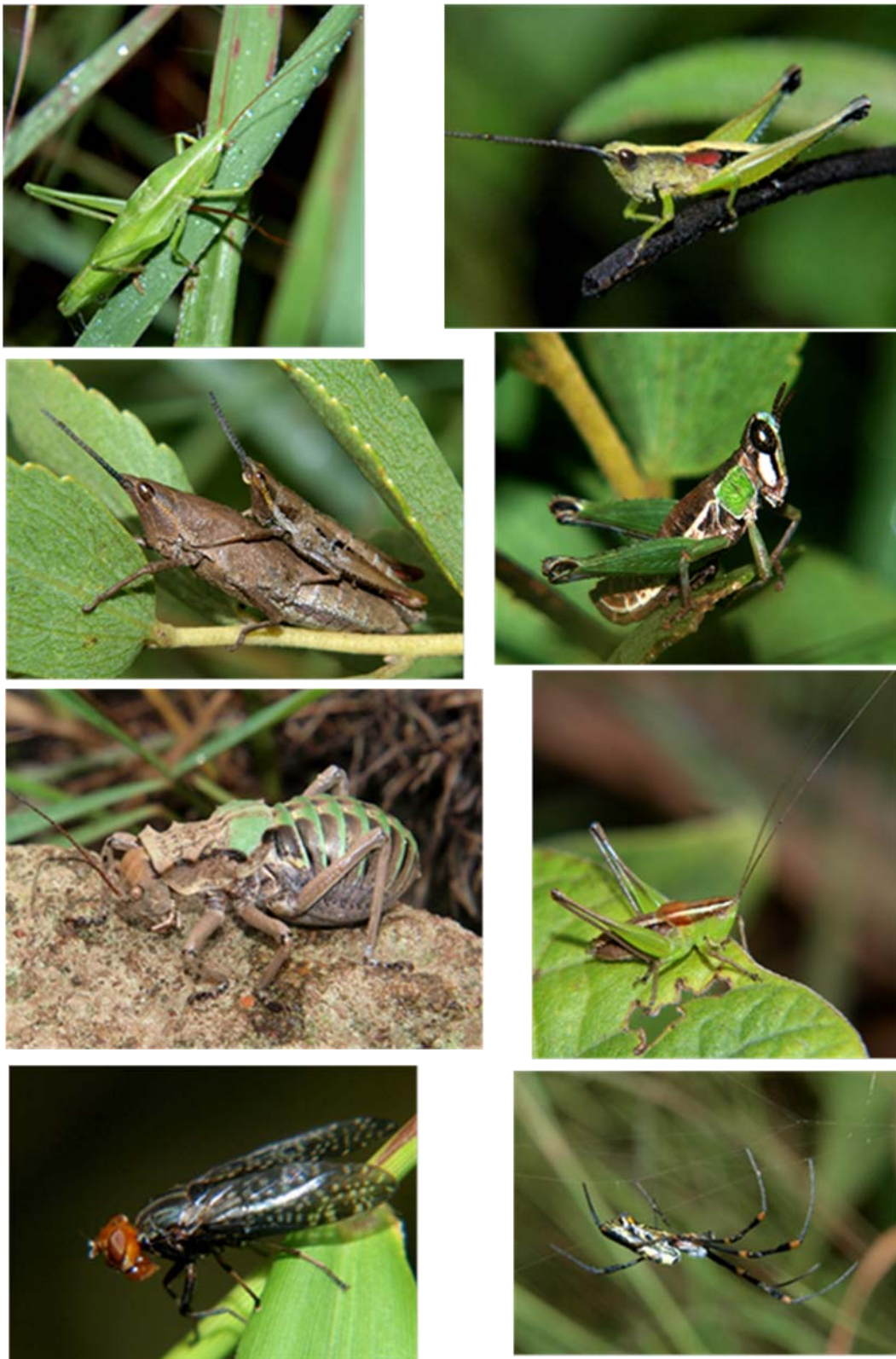
Figure 6. Orthoptera, Diptera and arachnids from the Mafinga uplands [all WN]. Top L, Ruspolia sp. nr. R. lemairii ; top R, Chokwea bredoi ; upper middle L, Stenoscepa obscura ; upper middle R, Lophothericles carinatus ; lower middle L, Enyaliopsis nyikae ; lower middle R, Chortoscirtes sp. male; bottom L, Peltacanthina mythoides ; bottom R, Nephila senegalensis nyikae .

Rhynchosia , which it continues to feed on in captivity. No foodplant was identified for the remaining species but other Enyaliopsis are typically omnivorous.