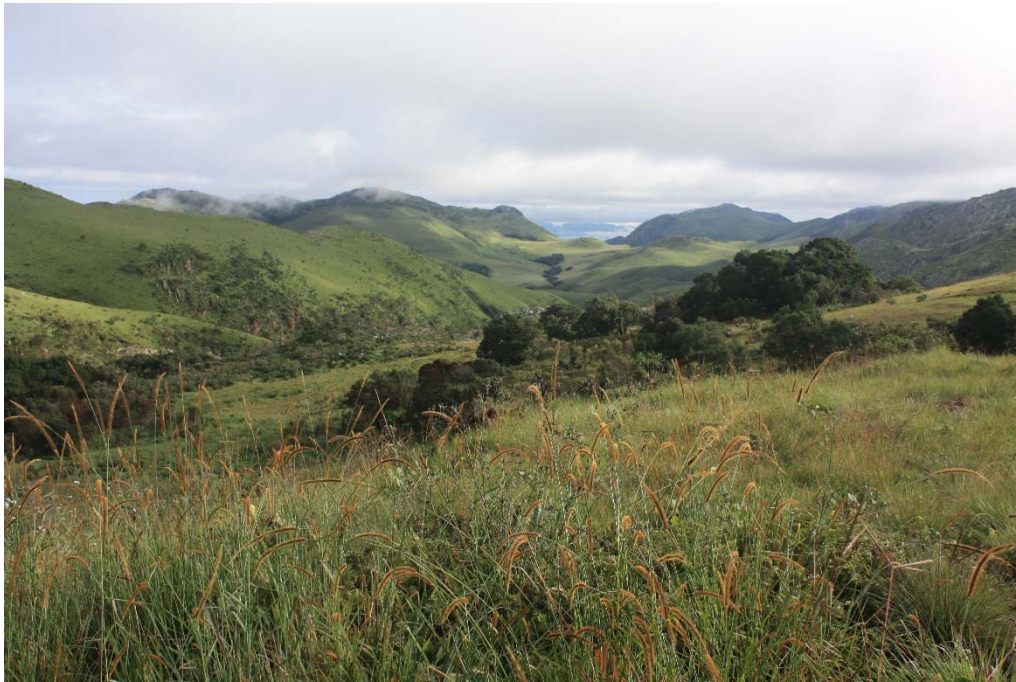
Figure 5. View north over Mafingas grasslands [JT].

Protea petiolaris , P. rupestris , Syzygium guineense subsp. macrocarpum and Uapaca kirkii , with the tree heather Erica pallidiflora and Uapaca robynsii on the upper slopes. Common shrubs include Haumaniastrum rupestre , Xerophyta equisetoides and Vernonia bellinghamii . Climbers are virtually absent.