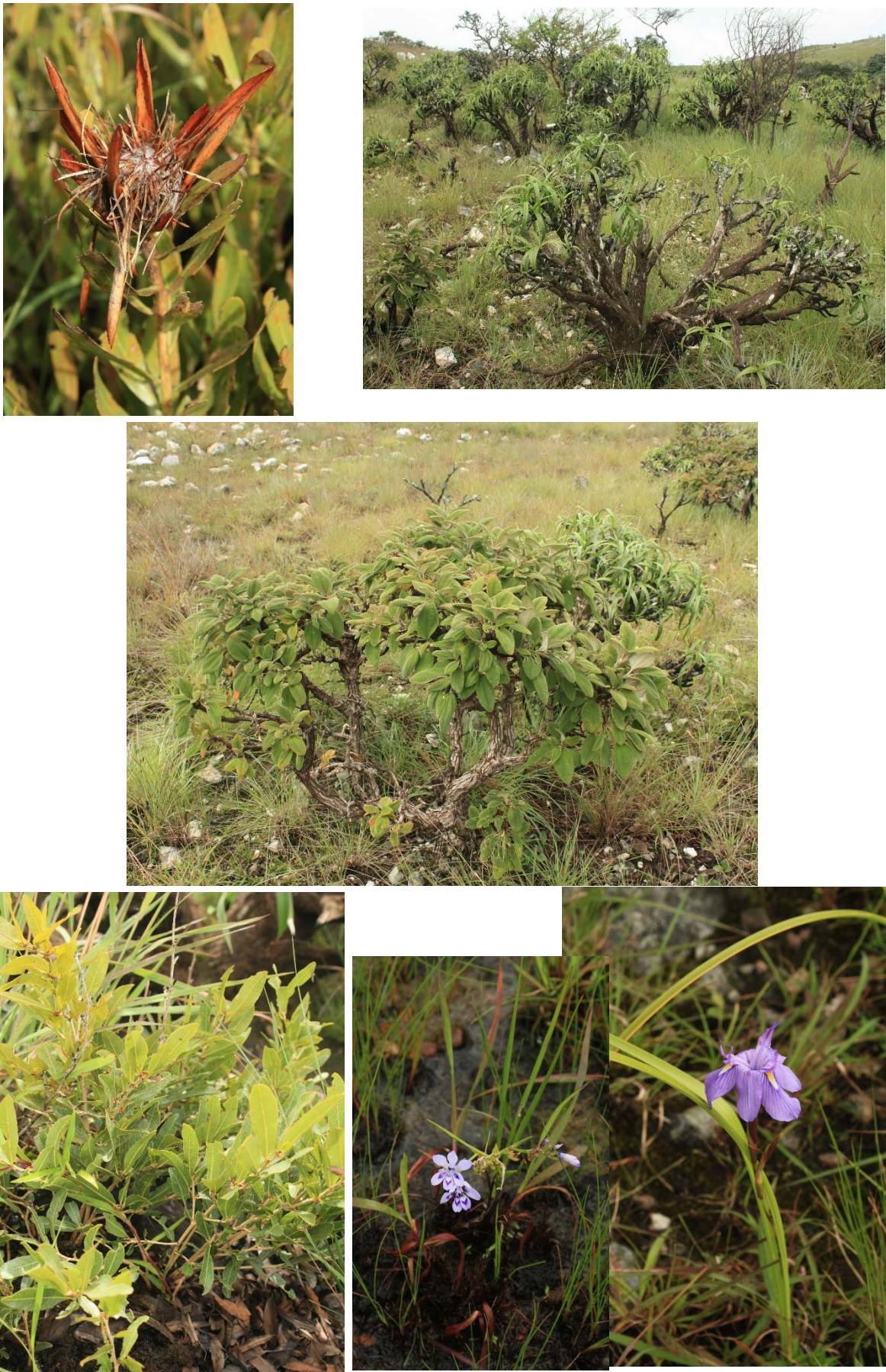
Figure 8. Interesting species from the Mafinga grasslands [all JT]. Top L, Protea kibarensis subsp. cuspidata ; top R, Xerophyta equisetoides or X. nutans ; middle, Dissotidendron lanatum (endemic); bottom L, Ochna cf. confusa ; middle, Lapeirousia erythrantha ; bottom R, Moraea schimperii .