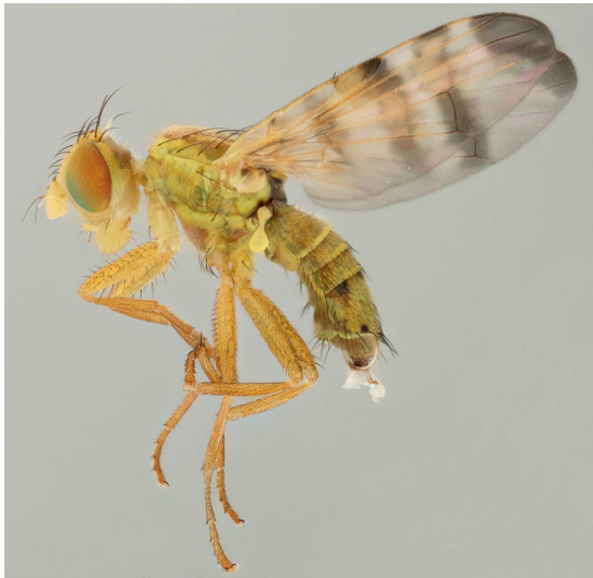
Male: lateral view