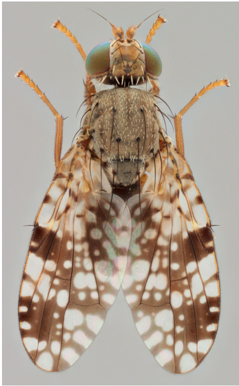
Male: dorsal view