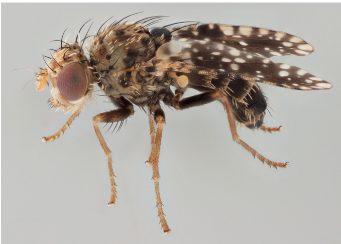
Male: lateral view