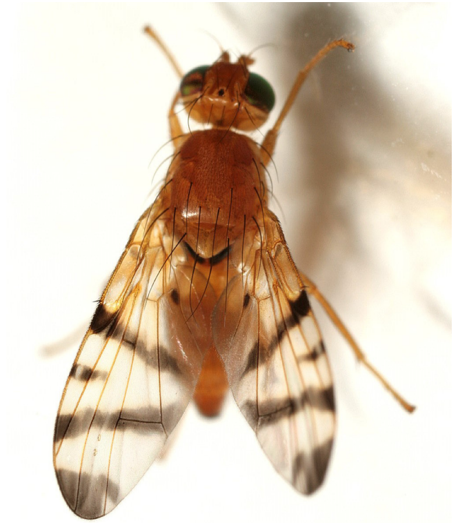
Female: dorsal view