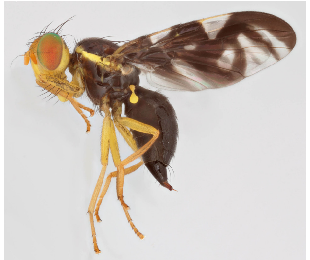
Female: lateral view