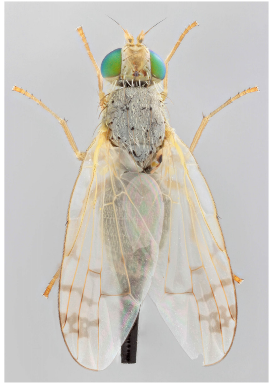
Female: dorsal view