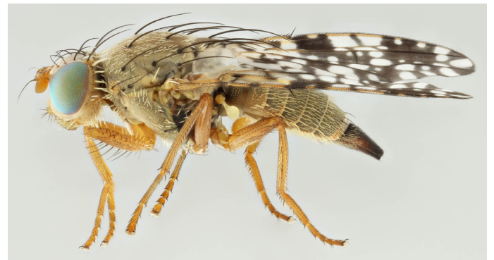
Female: lateral view