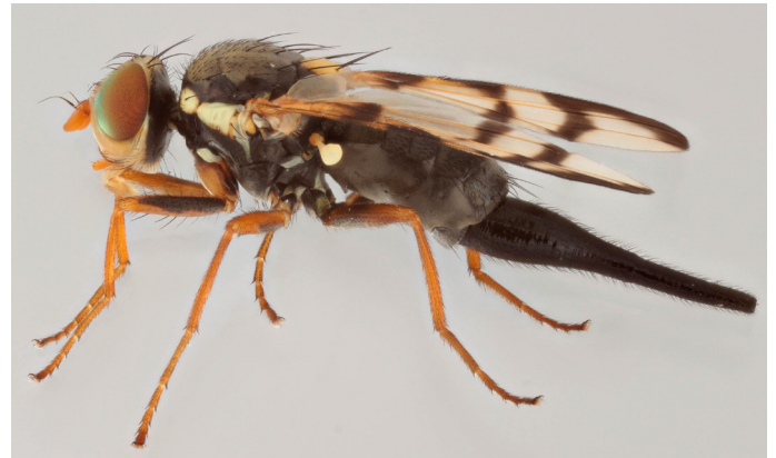
Female: lateral view