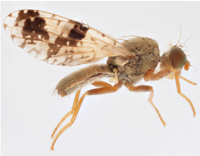
Male: lateral view