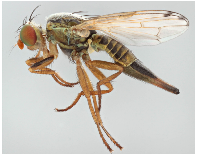
Female: lateral view