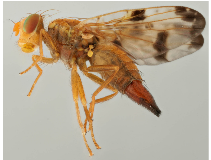
Female: lateral view