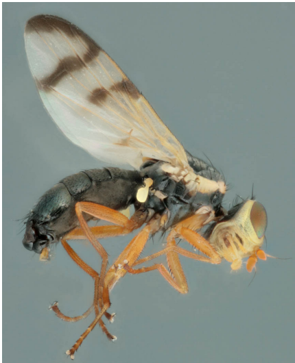
Male: lateral view