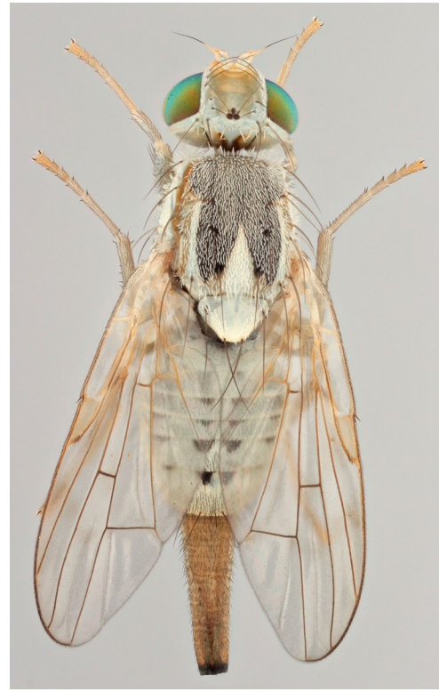
Female: dorsal view