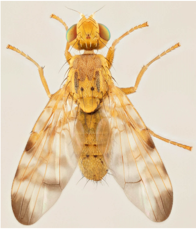
Male: dorsal view