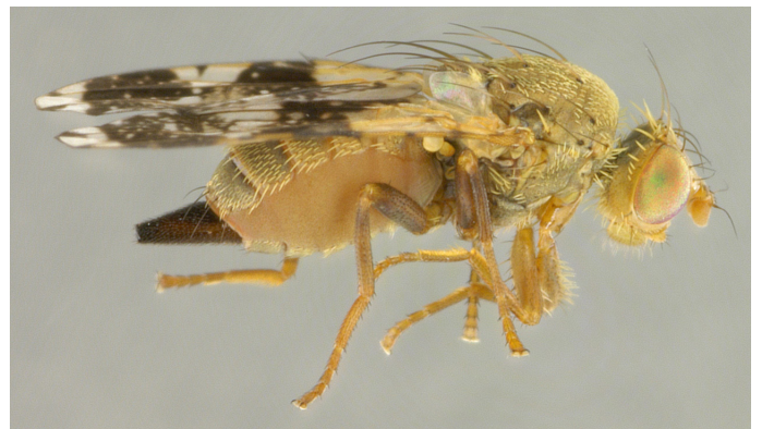
Female: lateral view