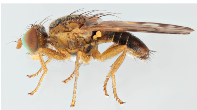
Male: lateral view