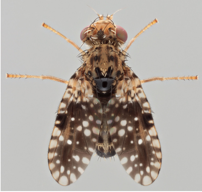
Male: dorsal view