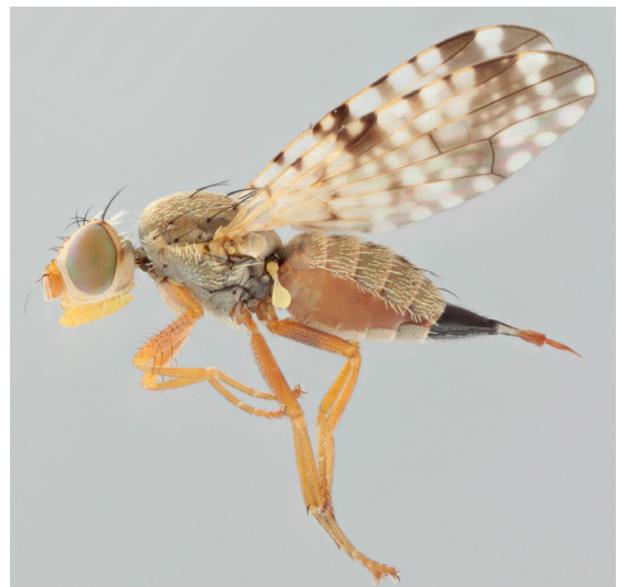
Female: lateral view