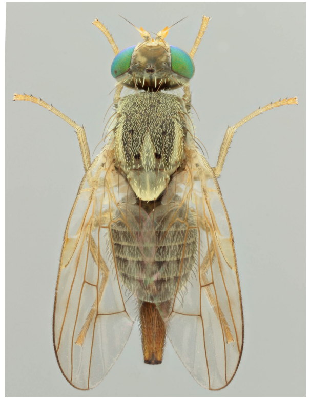
Female: dorsal view