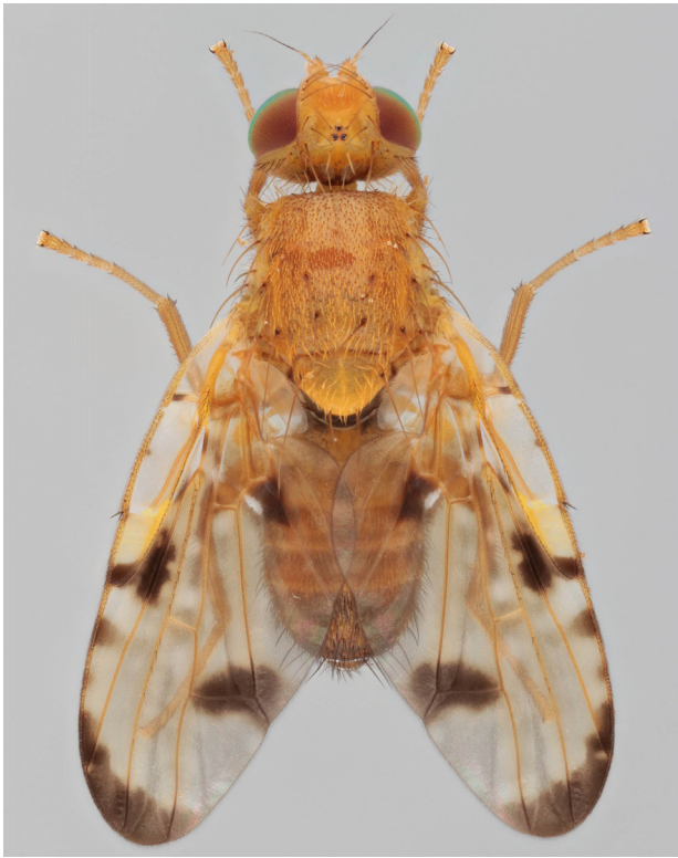
Male: dorsal view