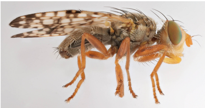
Male: lateral view