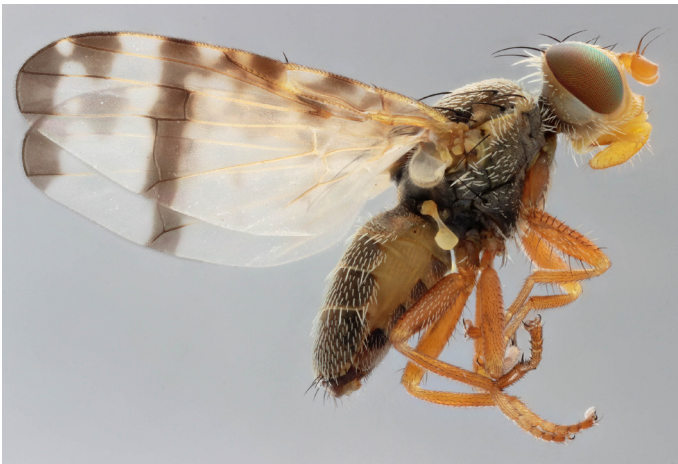
Male: lateral view