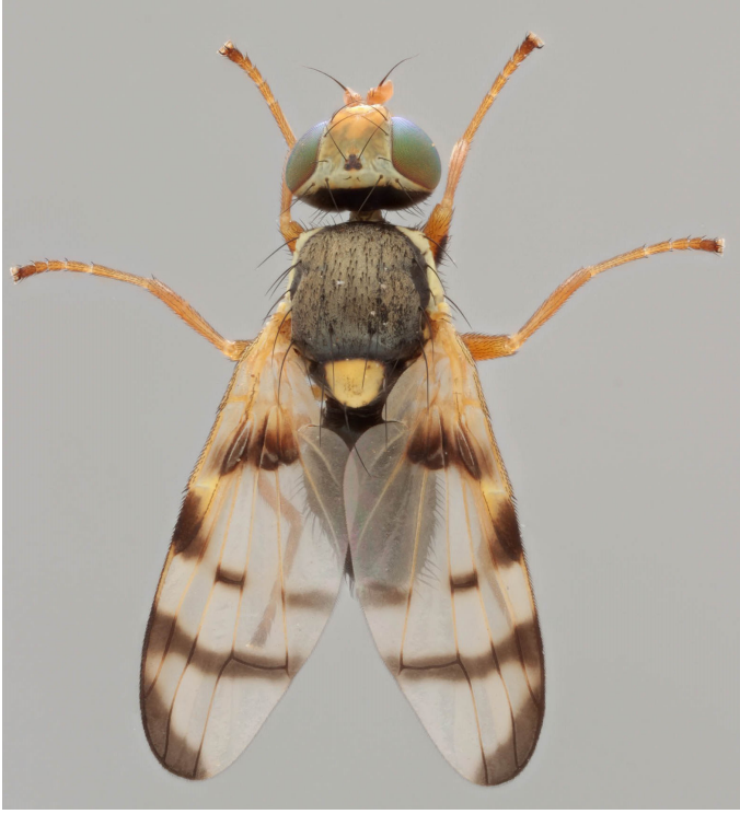
Male: dorsal view