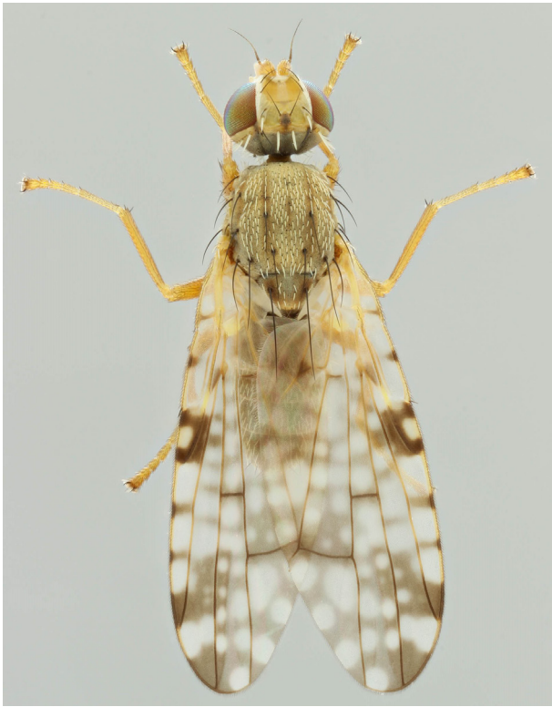
Male: dorsal view