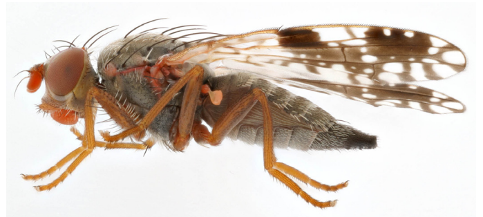
Female: lateral view