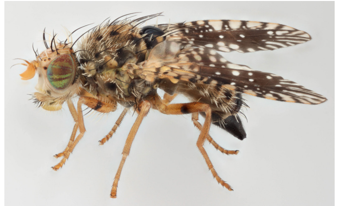
Female: lateral view