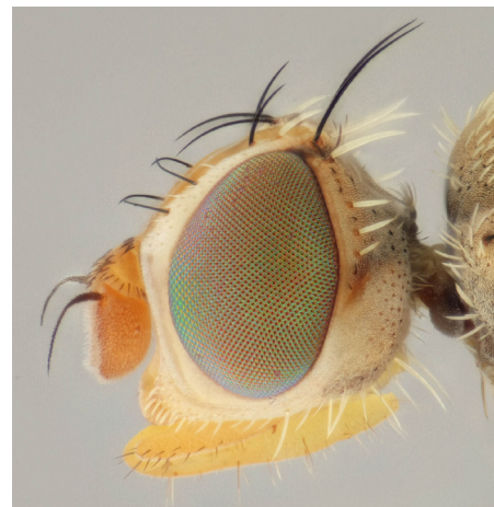
Female: head, lateral