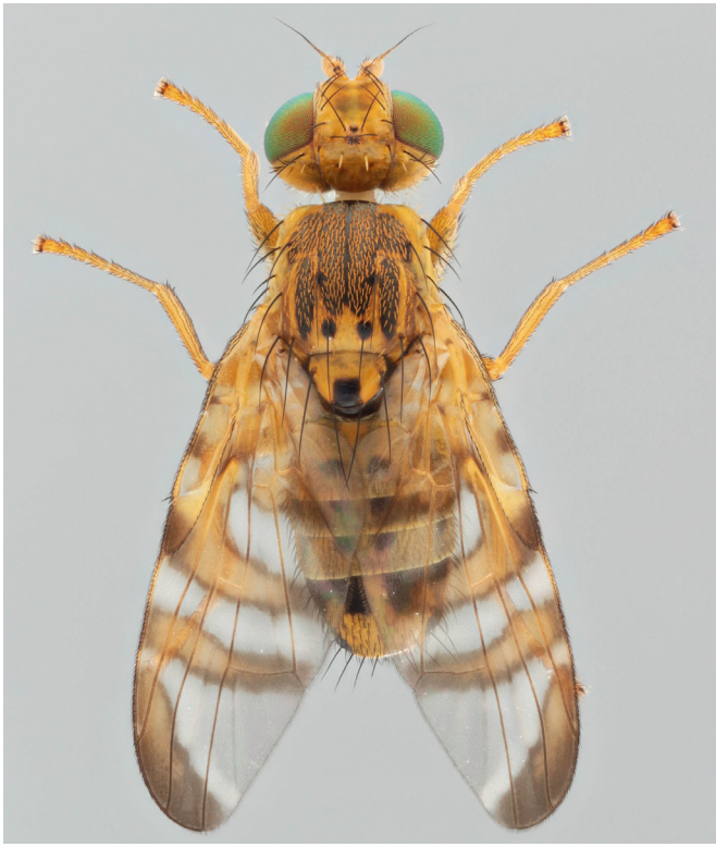
Male: dorsal view