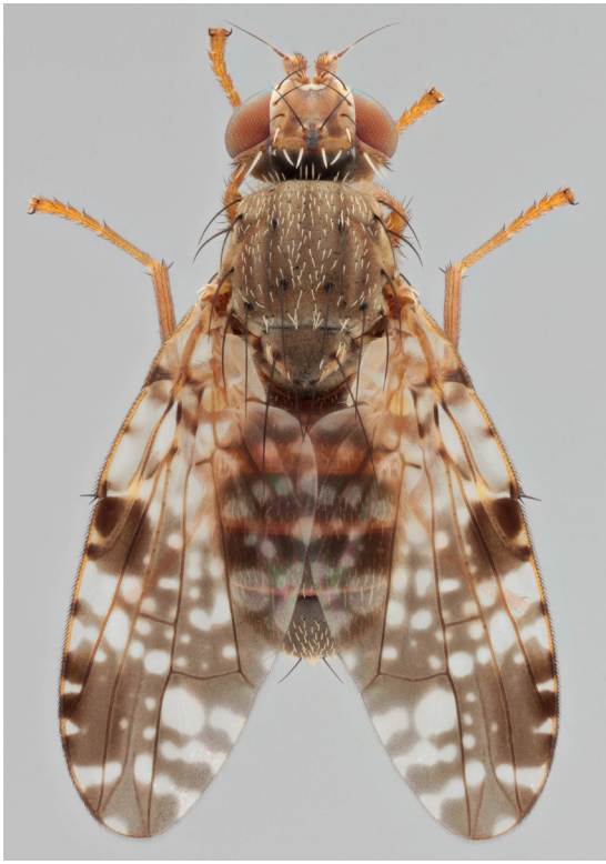
Male: dorsal view