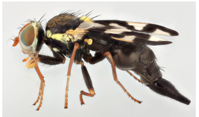
Female: lateral view