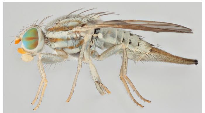
Female: lateral view