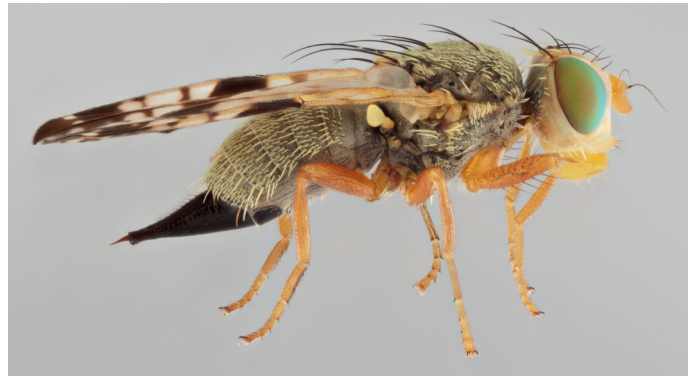
Female: lateral view