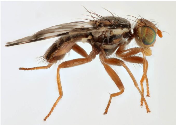
Male: lateral view