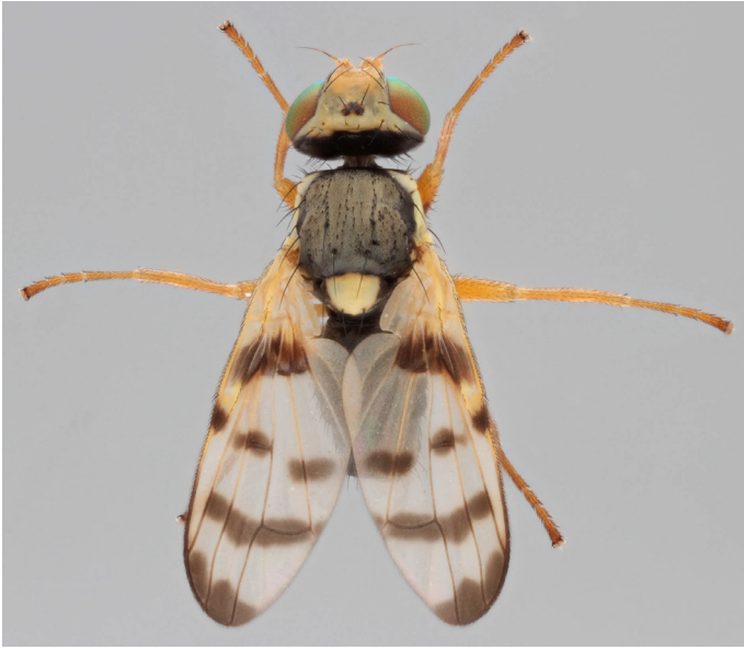
Male: dorsal view