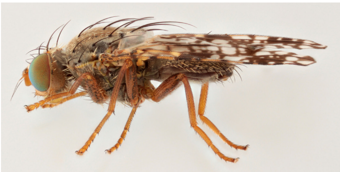
Male: lateral view