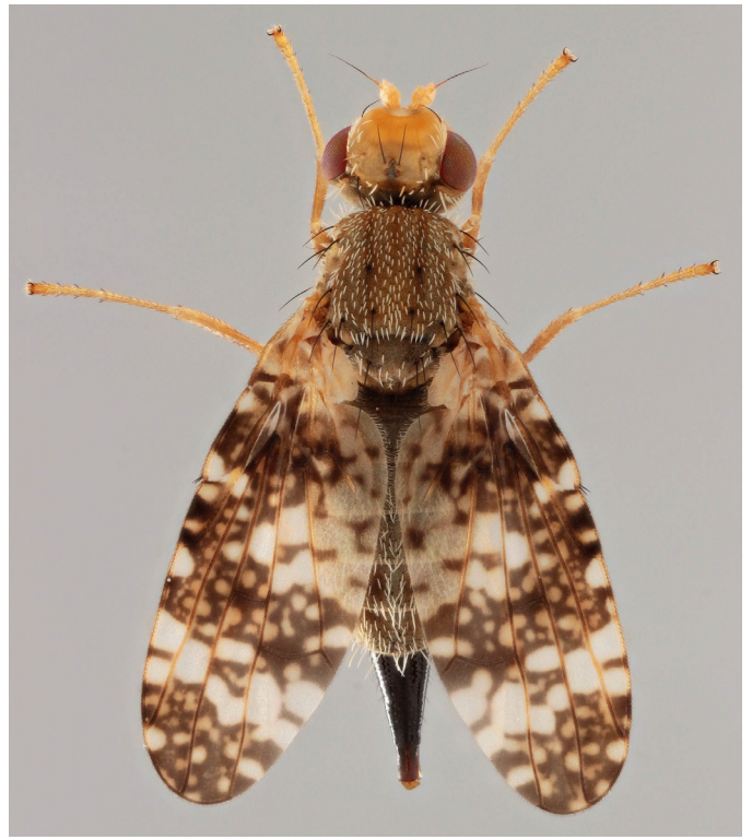
Female: dorsal view