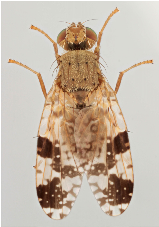
Male: dorsal view