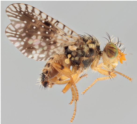
Male: lateral view