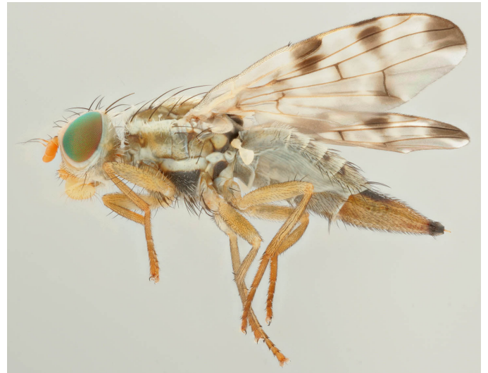
Female: lateral view