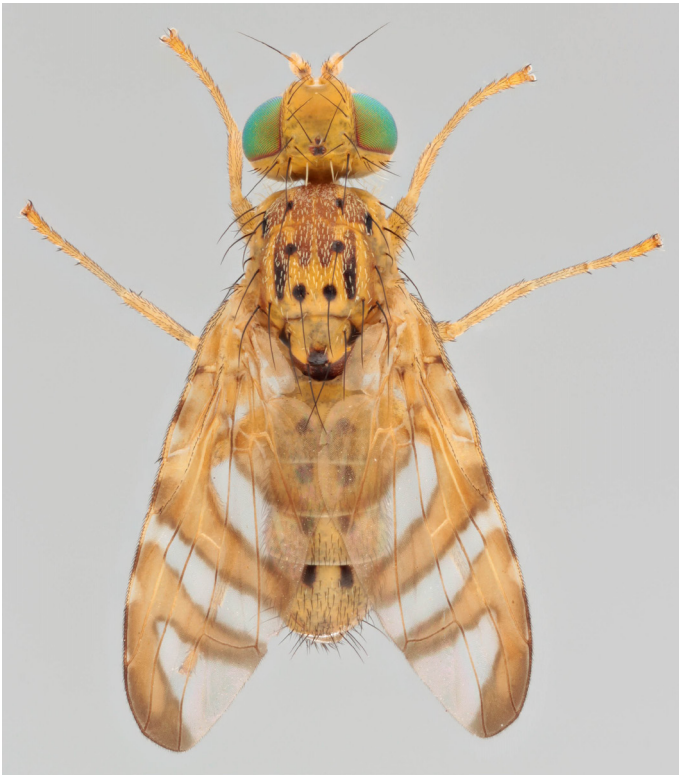
Male: dorsal view