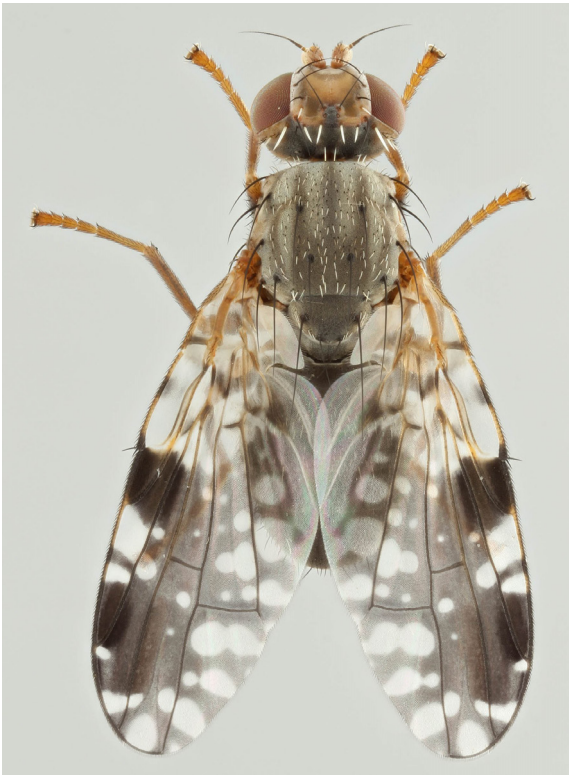
Male: dorsal view