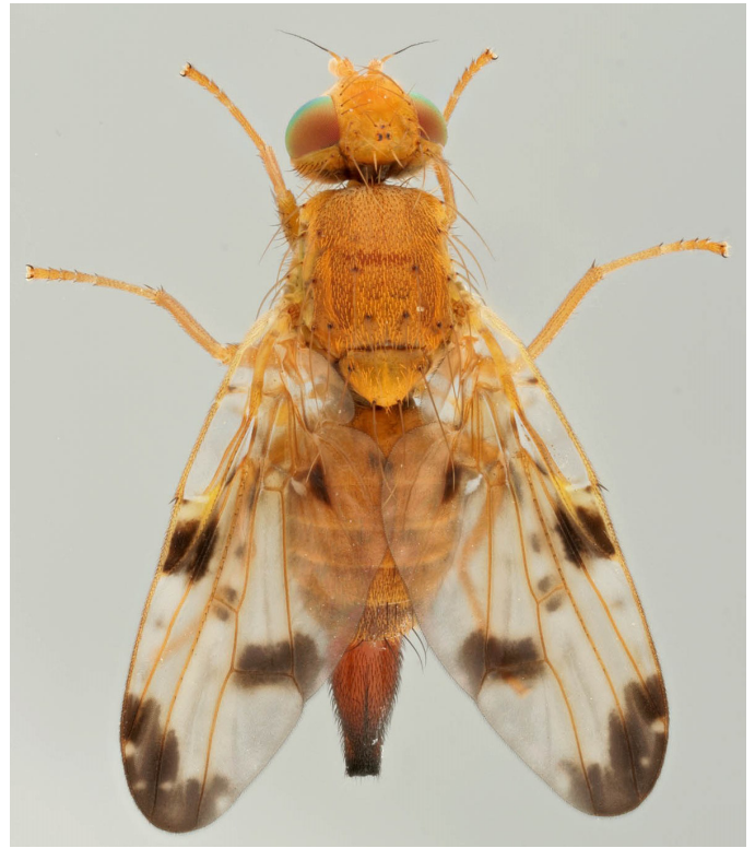
Female: dorsal view