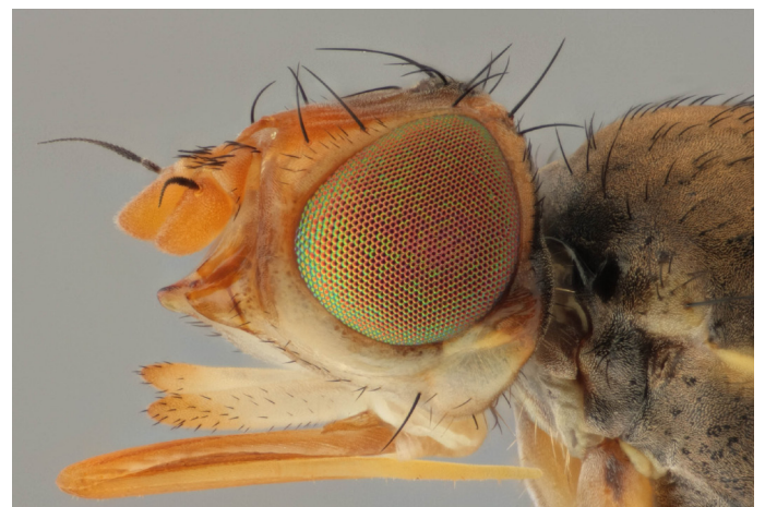
Head: lateral view