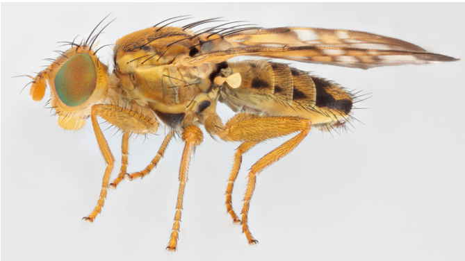
Male: lateral view