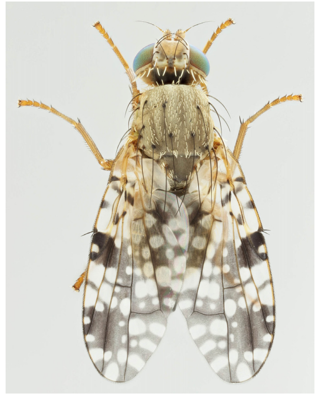
Female: dorsal view