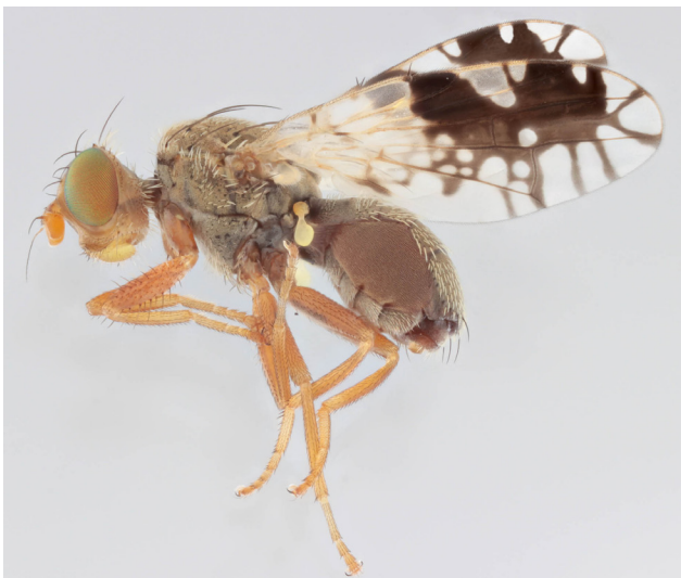
Male: lateral view