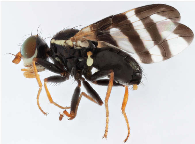
Male: lateral view