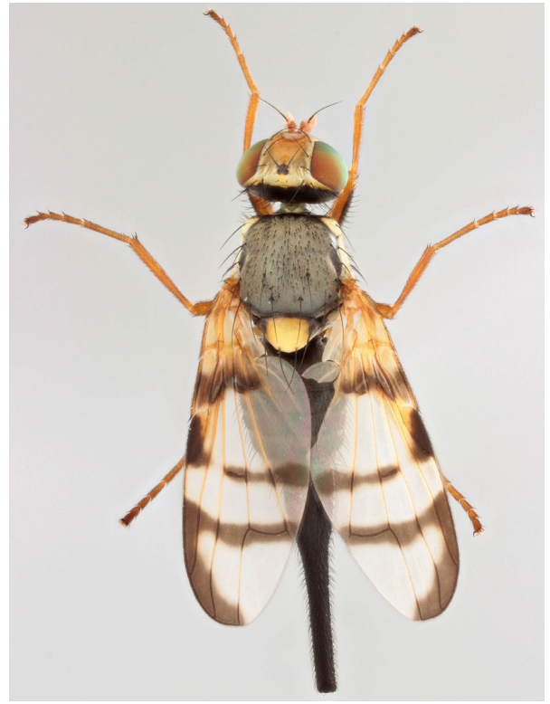
Female: dorsal view