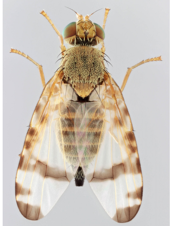
Female: dorsal view