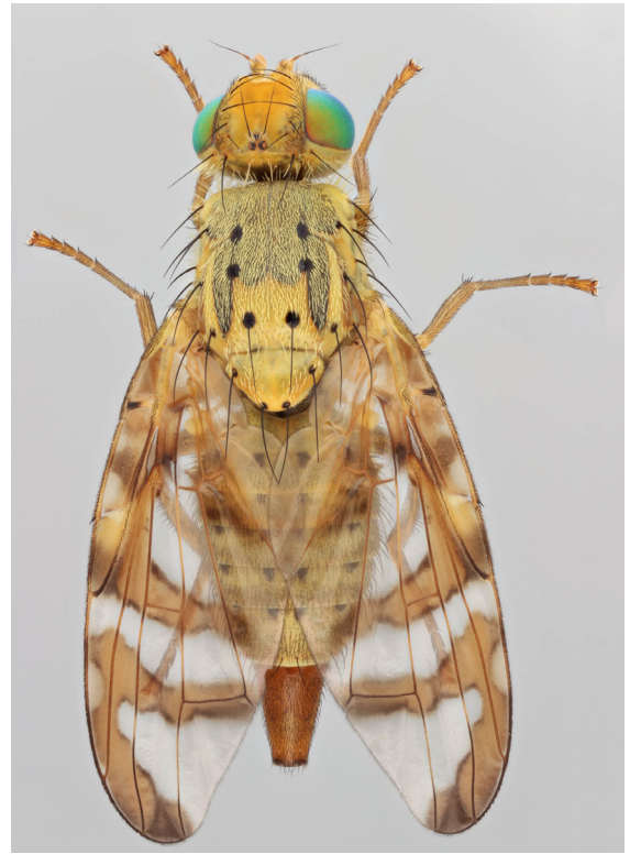
Female: dorsal view