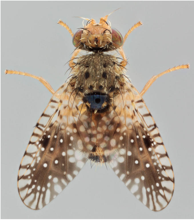
Male: dorsal view