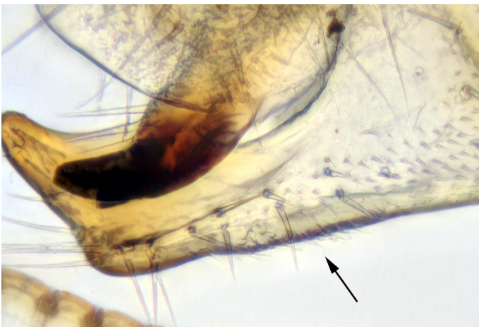
Male: setulae on apex of outer surstylus