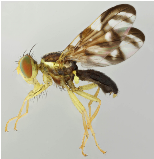
Male: lateral view