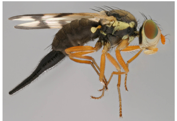
Female: lateral view