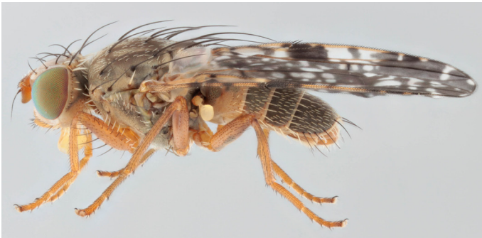
Male: lateral view