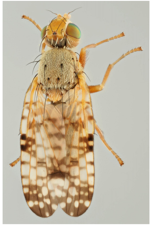
Female: dorsal view