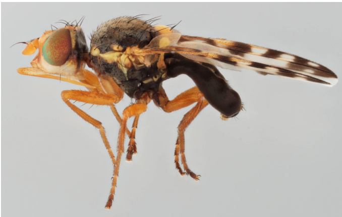
Male: lateral view