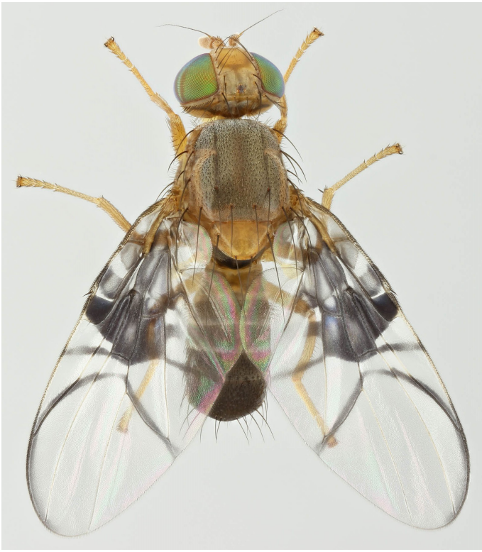
Male: dorsal view