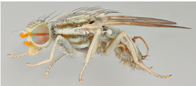
Male: lateral view