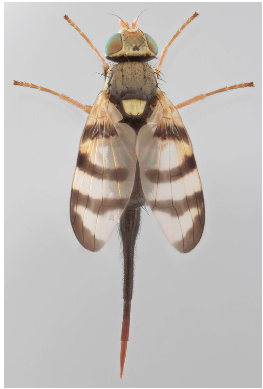
Female: dorsal view