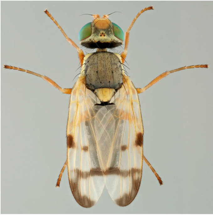
Male: dorsal view