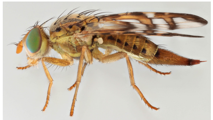
Female: lateral view