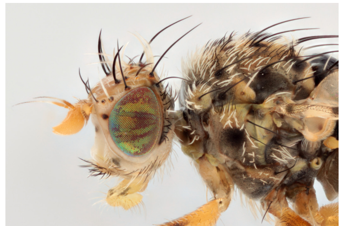
Female head and thorax: lateral view