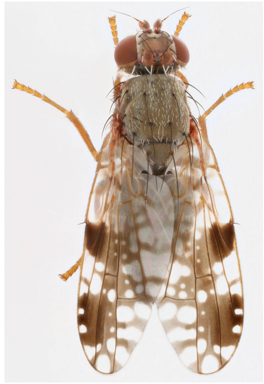
Female: dorsal view