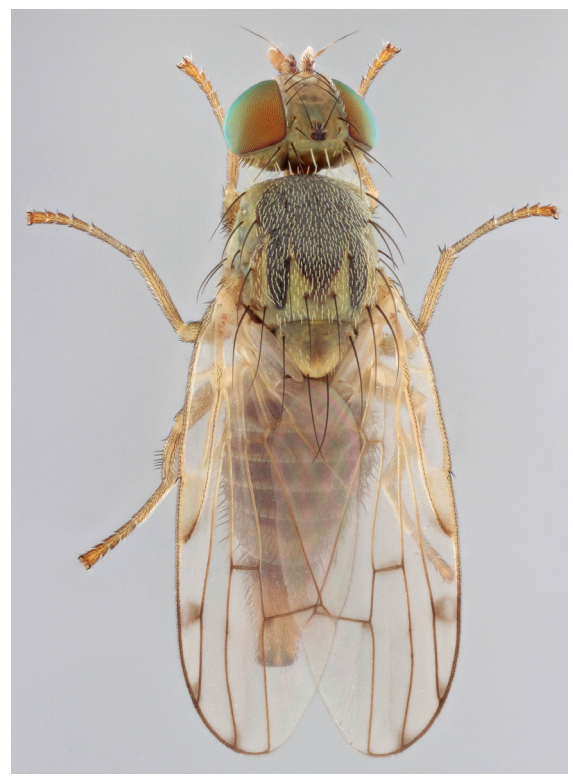
Female: dorsal view