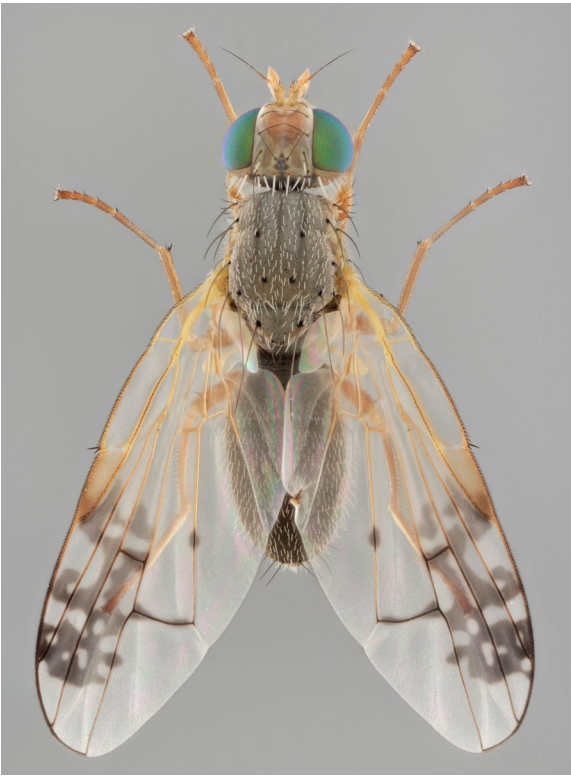
Male: dorsal view