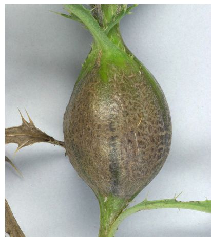
Gall on Creeping Thistle ( Cirsium arvense )