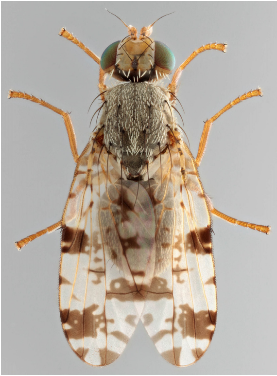
Male: dorsal view