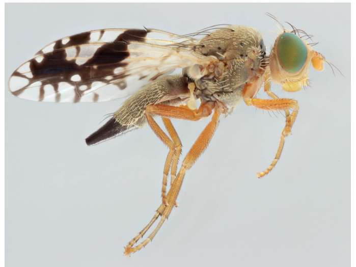
Female: lateral view