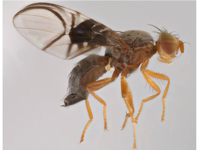
Female: lateral view