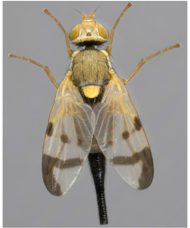
Female: dorsal view