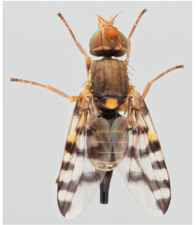
Female: dorsal view