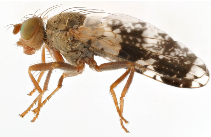
Male: lateral view