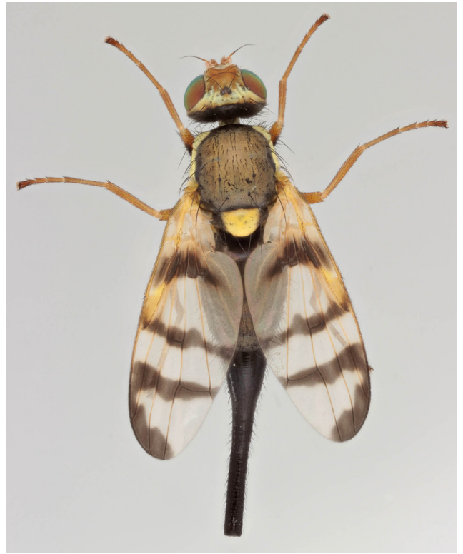
Female: dorsal view