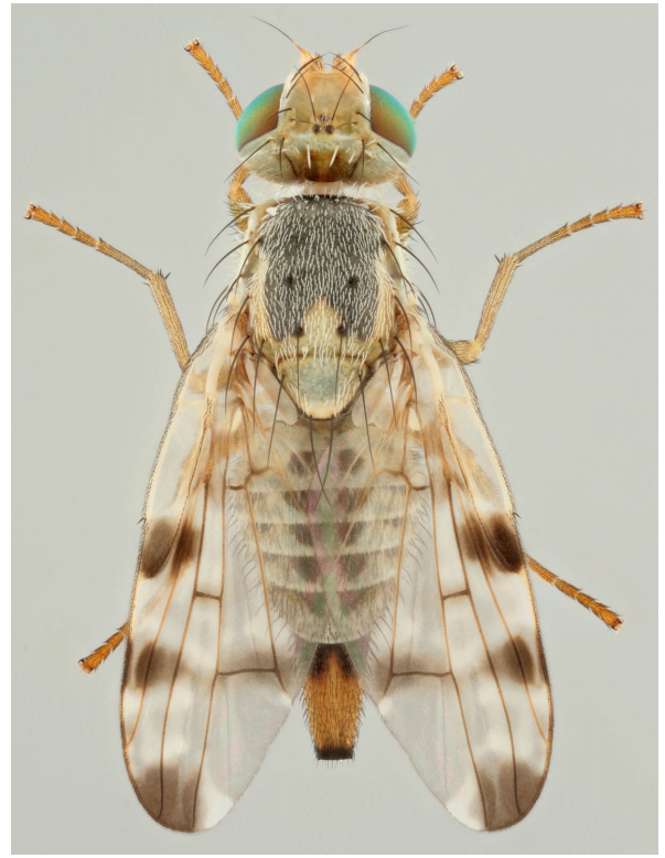
Female: dorsal view