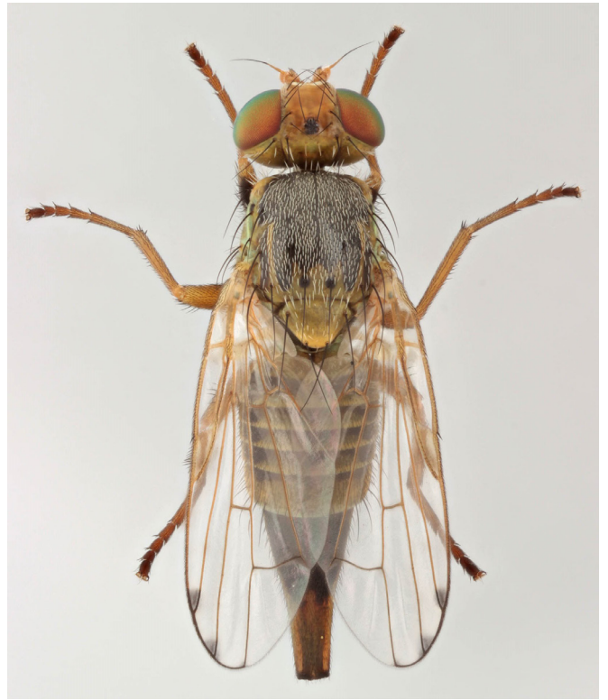
Female: dorsal view