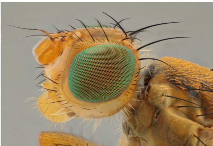
Male: head - lateral view