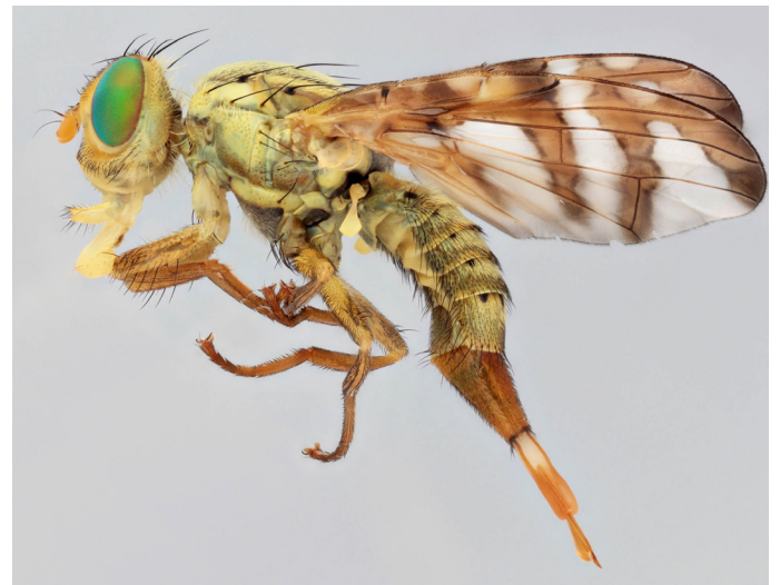
Female: lateral view