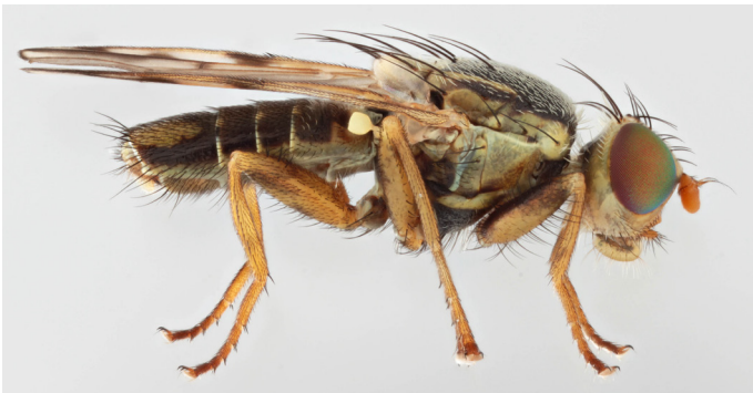
Male: lateral view