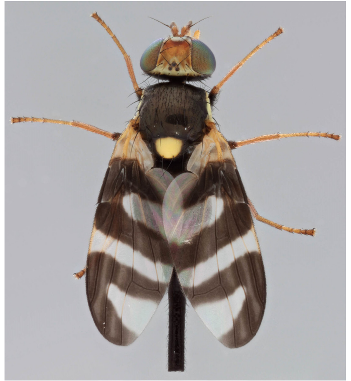
Female: dorsal view