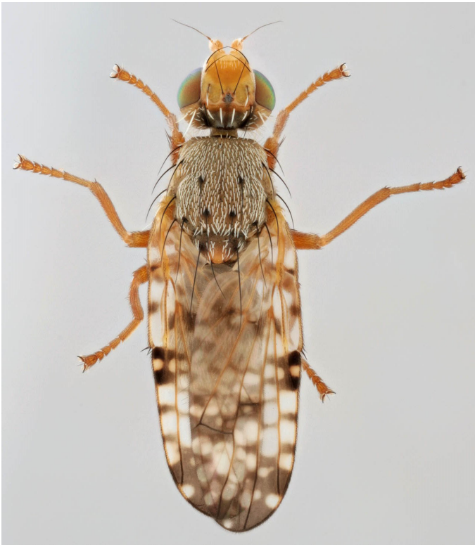
Male: dorsal view