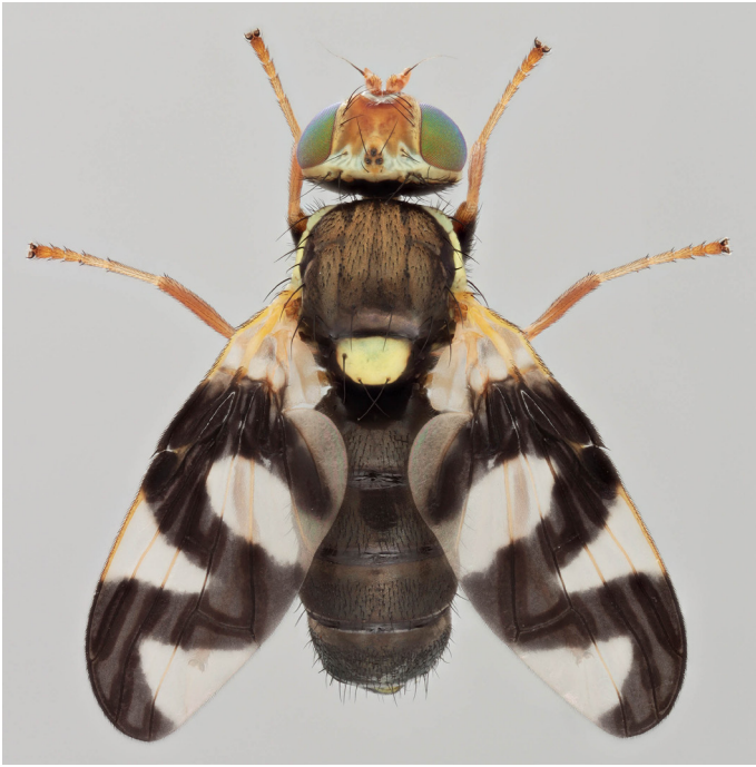
Male: dorsal view