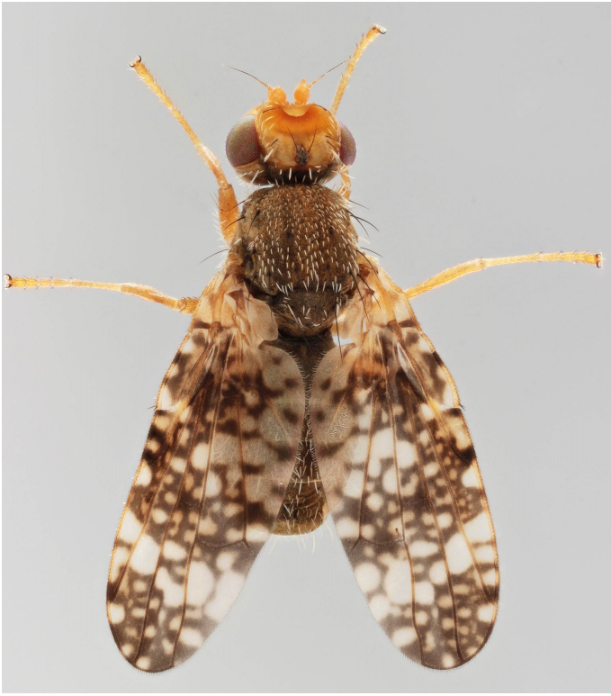
Male: dorsal view