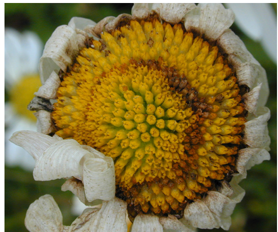
Larval feeding signs on Ox-eye Daisy ( Leucanthemum vulgare )