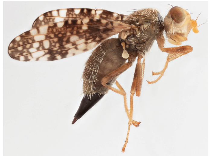
Female: lateral view