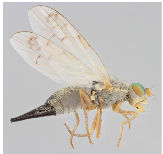
Female: lateral view