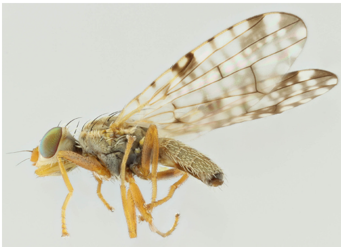
Male: lateral view