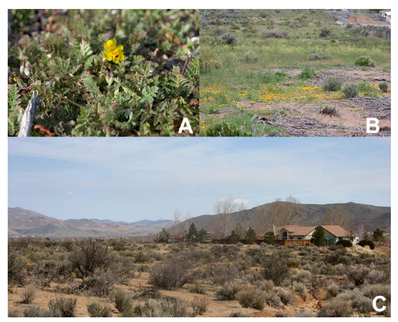
Fig. 2: Threats to Erythranthe carsonensis . A. Erodium cicutatrium (filaree) competing with E. carsonensis at the north end of Prison Hill (Photo by Jim Morefield, May 18, 2019; <u>https://www.inaturalist.org/observations/12260513</u>). B. Erythranthe carsonensis growing in a field of Sisymbrium altissimum (tumblemustard) at the west end of Prison Hill near Gentry Lane. (Photo by Naomi Fraga, May 17, 2010). C. Former habitat that has since been developed at the intersection of Highway 396 and Topsy Lane. (Photo by Naomi Fraga, April 13 2009)