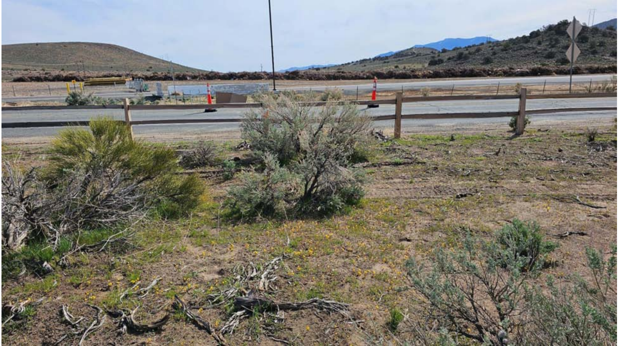
Fig. 3: Access road to the municipal landfill cutting through occupied Erythranthe carsonensis habitat (flowers can be seen as yellow spots in foreground). Photo taken April 29, 2023 at 39.1966597,-119.6828347.