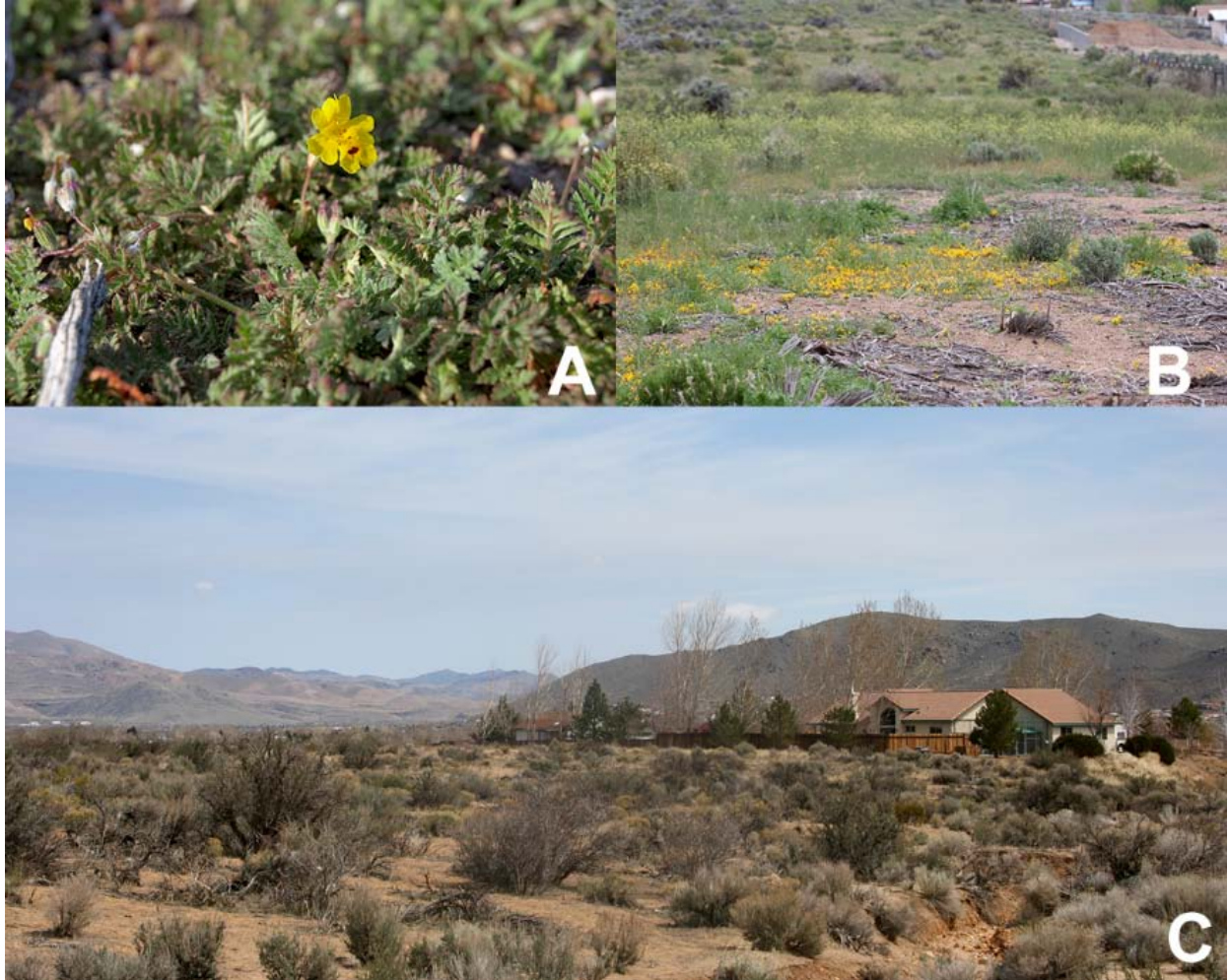
Fig. 2: Threats to Erythranthe carsonensis . A. Erodium cicutarium (filaree) competing with E. carsonensis at the north end of Prison Hill. B. Erythranthe carsonensis growing in a field of Sisymbrium altissimum (tumblemustard) at the west end of Prison Hill near Gentry Lane.. C. Former habitat that has since been developed at the intersection of Highway 396 and Topsy Lane.