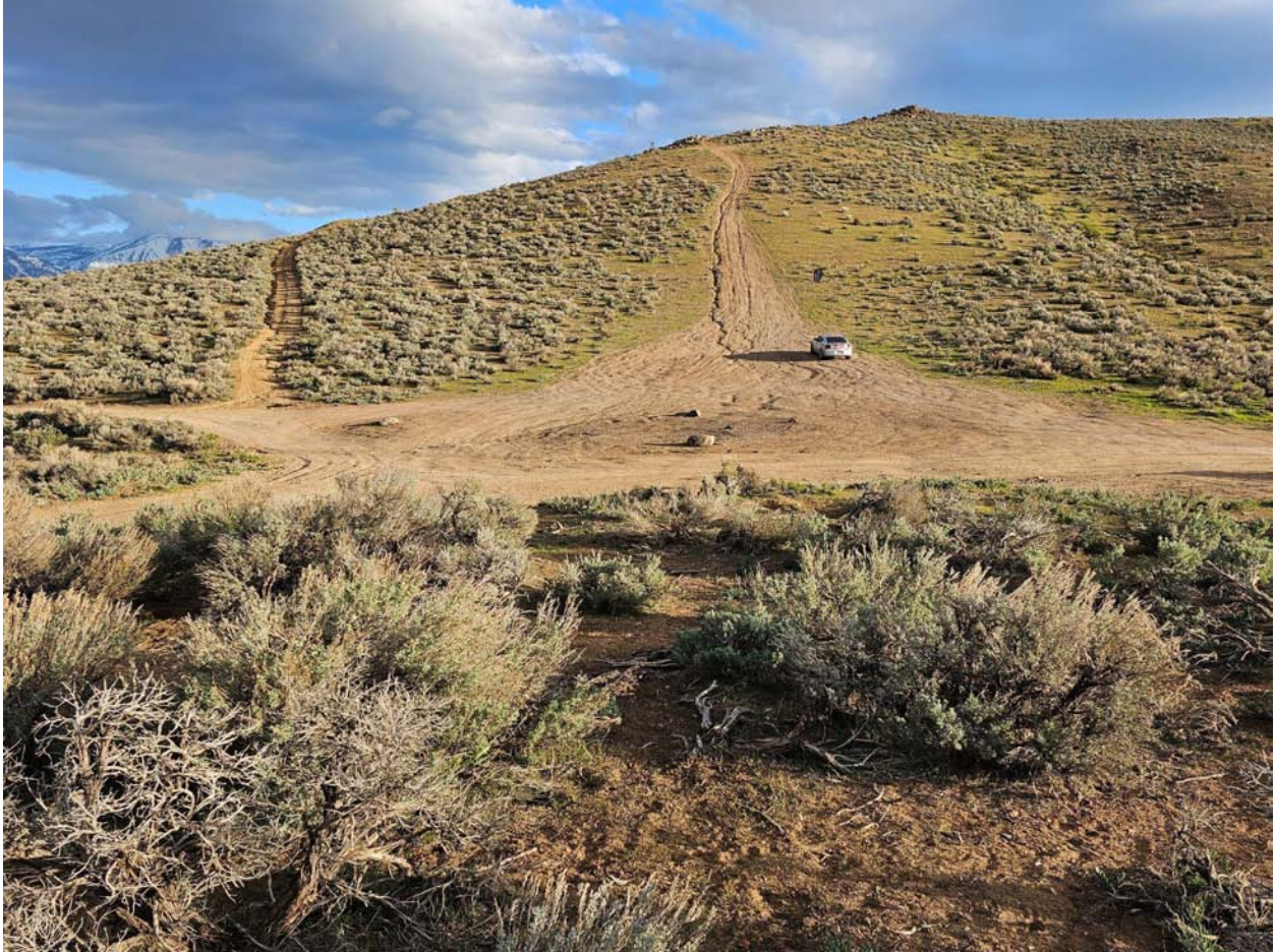
Fig. 4: OHV activity in occupied Erythranthe carsonensis habitat near Nine Hill in north Carson City. Photo taken May 1, 2023 at 39.2315939,-119.7514018.