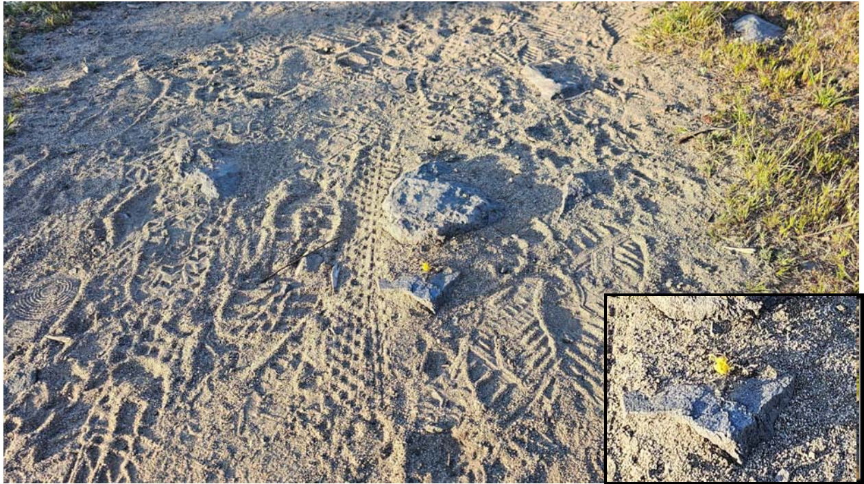
Fig. 6: Erythranthe carsonensis growing directly on a trail in the North Prison Hill population. Photo taken May 10, 2023 at 39.155361°, -119.729806.

Prison Hill North and Prison Hill West are two important populations of Erythranthe carsonensis that are situated within the Prison Hill Recreation Area, a 2,500 acre parcel managed by Carson City for recreation purposes. Several designated trails directly cross E. carsonensis habitat, and indeed flowering plants can sometimes be seen growing directly in and adjacent to the trails (Fig. 6).