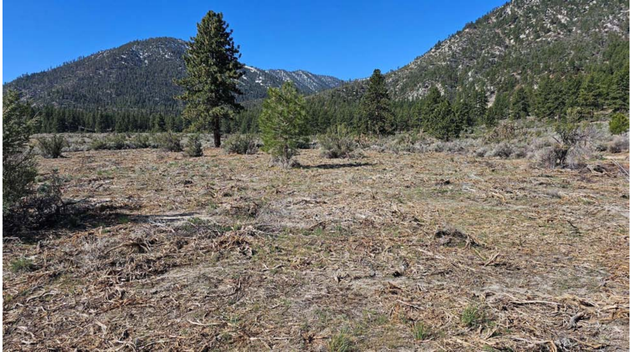
Fig. 9: Fuels treatment in Erythranthe carsonensis habitat at the Fay-Luther Trailhead. Photo taken May 13, 2023 at 38.869167, -119.811639.