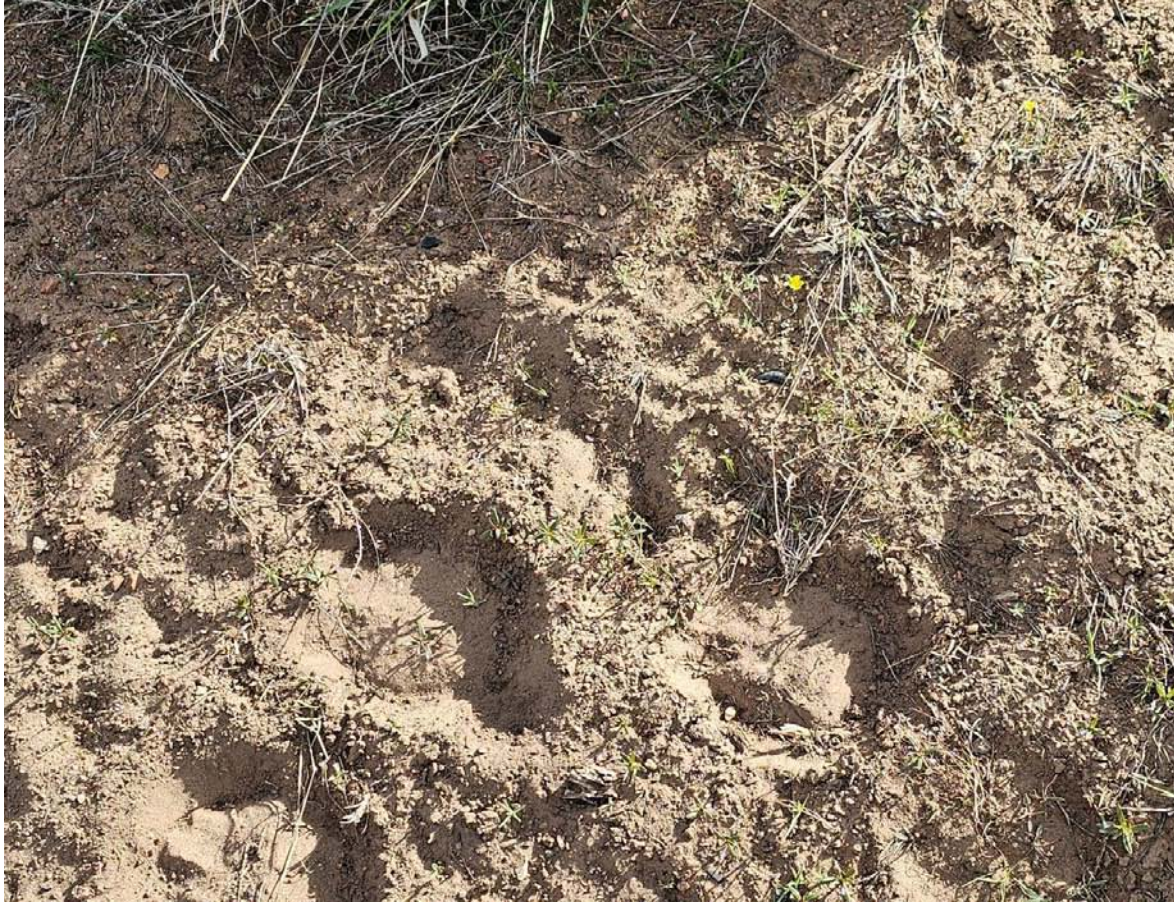
Fig. 8: Feral horse hoofprints trampling Erythranthe carsonensis flowers in the Nine Hill area of the North Carson City population. Photo taken May 1, 2023 at 39.2321955, -119.7580868.