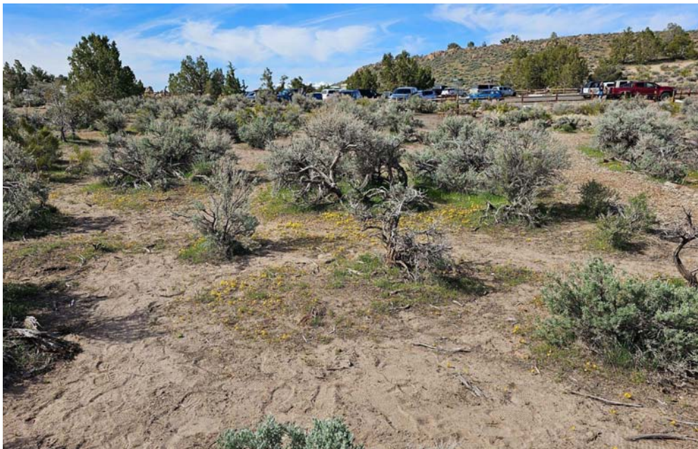
Fig. 5: Trampling, trail construction, and parking lot development at the frisbee golf course within occupied habitat at the Flint Road/Moundhouse population. Flowers can be seen as yellow dots throughout the photo. Photo taken April 29, 2023 at 39.1955919,-119.6833796.

Occupied Carson Valley monkeyflower habitat at the Flint Road/Moundhouse population has been turned into a frisbee golf course, resulting in the direct loss of individuals and the fragmentation and ongoing destruction of habitat through trampling ( Fig. 5 ).