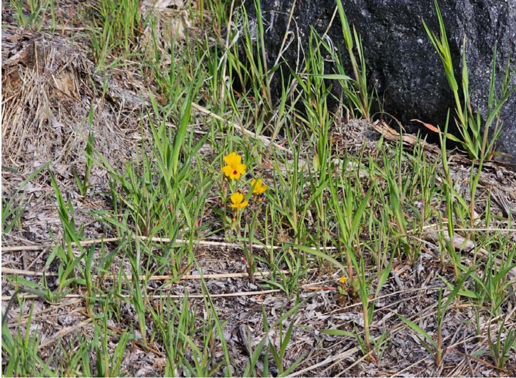
Fig. 10: Carson Valley monkeyflower growing among Bromus tectorum , Prison Hill North area. Photo taken April 29, 2023 at 39.155222°, -119.730722°.