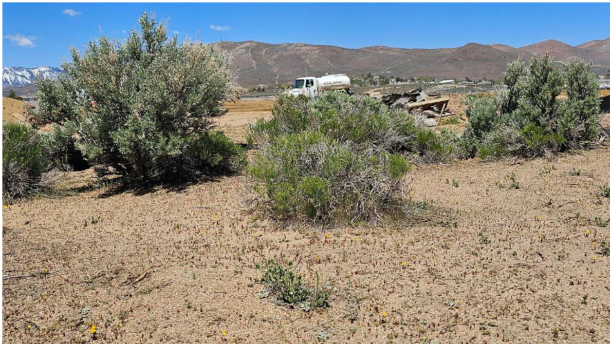
Fig. 7: Occupied Erythranthe carsonensis habitat being graded and paved on Old Hot Springs Road in Eagle Valley. Flowers can be seen in the foreground. Photo taken May 11, 2023 at 39.1919986,-119.745112.