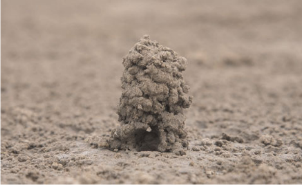
Fig. 4. Pillar structure in Abi estuary area.