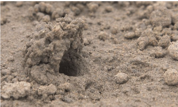
Fig. 5. Hoods structure in Abi estuary area.