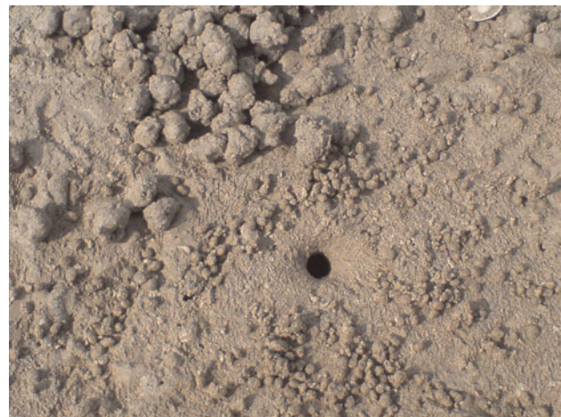
Fig. 3. Food pellets (are small) and burrow balls (are big) in Abi estuary area.

We observed two types of mud balls: feeding pellets that are the result of the crab spitting out the sediment it has processed in its mouth after extracting the organic matter; and burrow balls that are the result of cleaning out the burrow. Burrow balls are much larger than feeding pellets (Figure 3). During the breeding season (February–September), we also observed three types of mud structures constructed by U. annulipes populations. We found an abundance of pillars ( 1.3 \pm 1.62 pillars in a 0.5 m 2 area; N = 92 ) (Figure 4). Pillars are upright piles of mud that sit behind the burrow entrance and are 3.2 \pm 0.51 cm tall ( N = 30 ). We also found much rarer hoods that consist of mud piled behind the burrow entrance to half surround it and cover the top of it with an overhanging lip (an average height of 2.1 \pm 0.3 cm, N = 30 ) (Figure 5) and semi-domes that were a collection of mud balls placed behind the burrow entrance in a low semi-dome shape (average height = 2.3 \pm 0.39 cm, N = 30 ) (Figure 6). We found no such structures in the populations of U. sindensis .