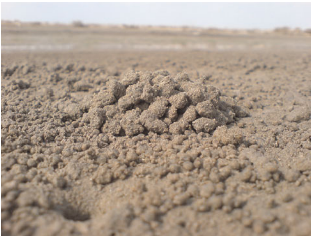
Fig. 6. Semi-domes structure in Abi estuary area.